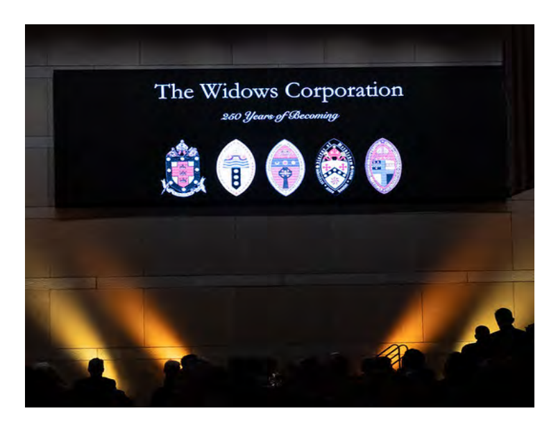
250 Years of Becoming

Therefore the Corporation will henceforth be known as the Clergy Assurance Fund: Assurance to our Clergy that we will use our Fund to help them maintain healthy families that support healthy clergy who will better lead healthy congregations.