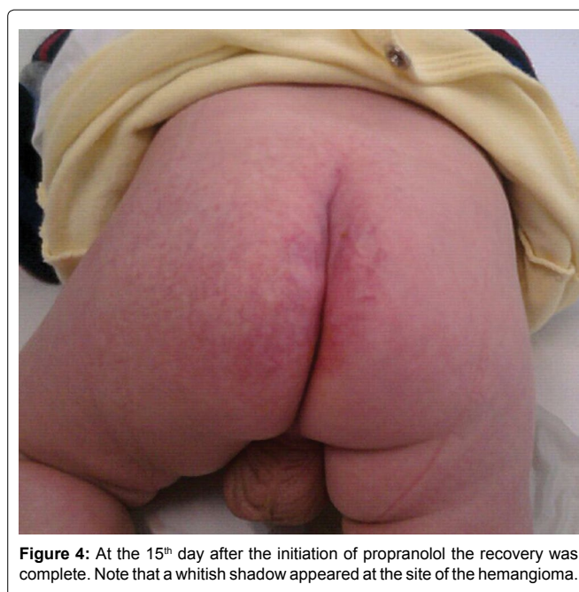
Figure 4: At the 15 th day after the initiation of propranolol the recovery was complete. Note that a whitish shadow appeared at the site of the hemangioma.