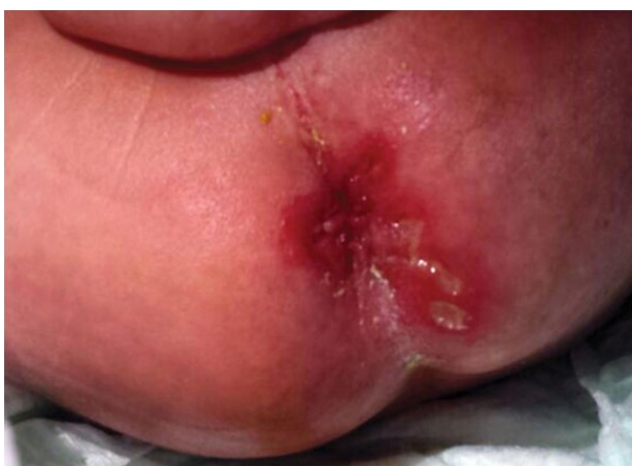
Figure 1: At the time of consultation the neonate showed a reddish skin in the perianal area and two deep ulcers of 25 × 10 and 5 × 10 mm.

The Infantile hemangioma with minimal or arrested growth (IH-MAG) is a recently defined type of hemangioma in which the proliferative phase could not be appreciated as it is limited to less than 25% of the surface. Its recognition is important as it often becomes ulcerated and this can lead to misdiagnosis and thus to an inappropriate and inefficacious therapy. Furthermore, IH-MAG could be associated to inner malformations that should be evaluated thoroughly.