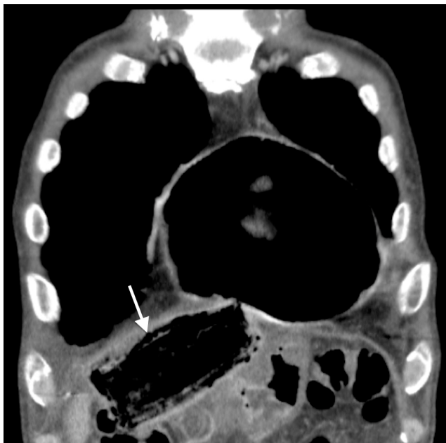
Figure 1: Axial CT image. Pleural effusion in both lung and hydropneumopericardium were confirmed.