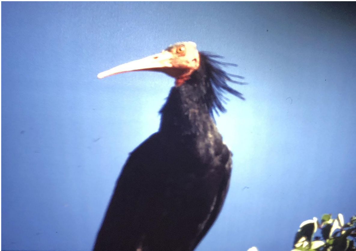
Northern Bald Ibis raised in captivity Photo 1987