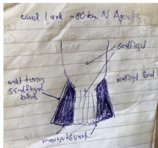
Tail of Dunn's Lark: Drawing from my original field-notes. (Notes in Swedish)