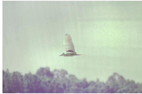
Black-crowned NightheroPhoto Stefan Lithner