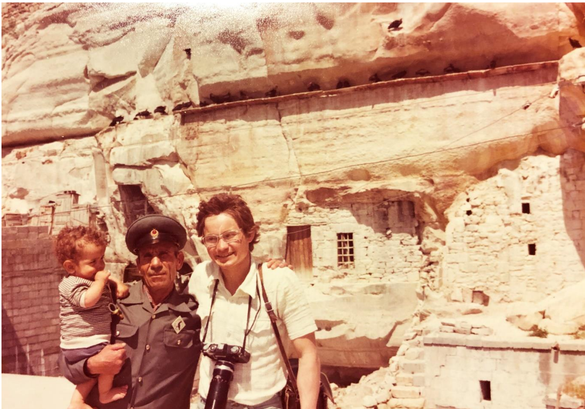
Chief of Police and appointed Ibis-guard in Birecik with son and report-compiler in front of breeding support for the Waldrapp.

The trip started in Danascus in the morning of May 29, by bus to Haleb (Aleppo) where I overnighed. The following morning I took a taxi to Bab el Hawha, Despite this gate was not open to private people I managed to get across to Turkey. By lorry I made it to Kilis, where I took a taxi to Birecik. Ninety Northern Bald Ibis/Waldrapp were present, a rather obvious decline since 1974 when 120 birds were counted.