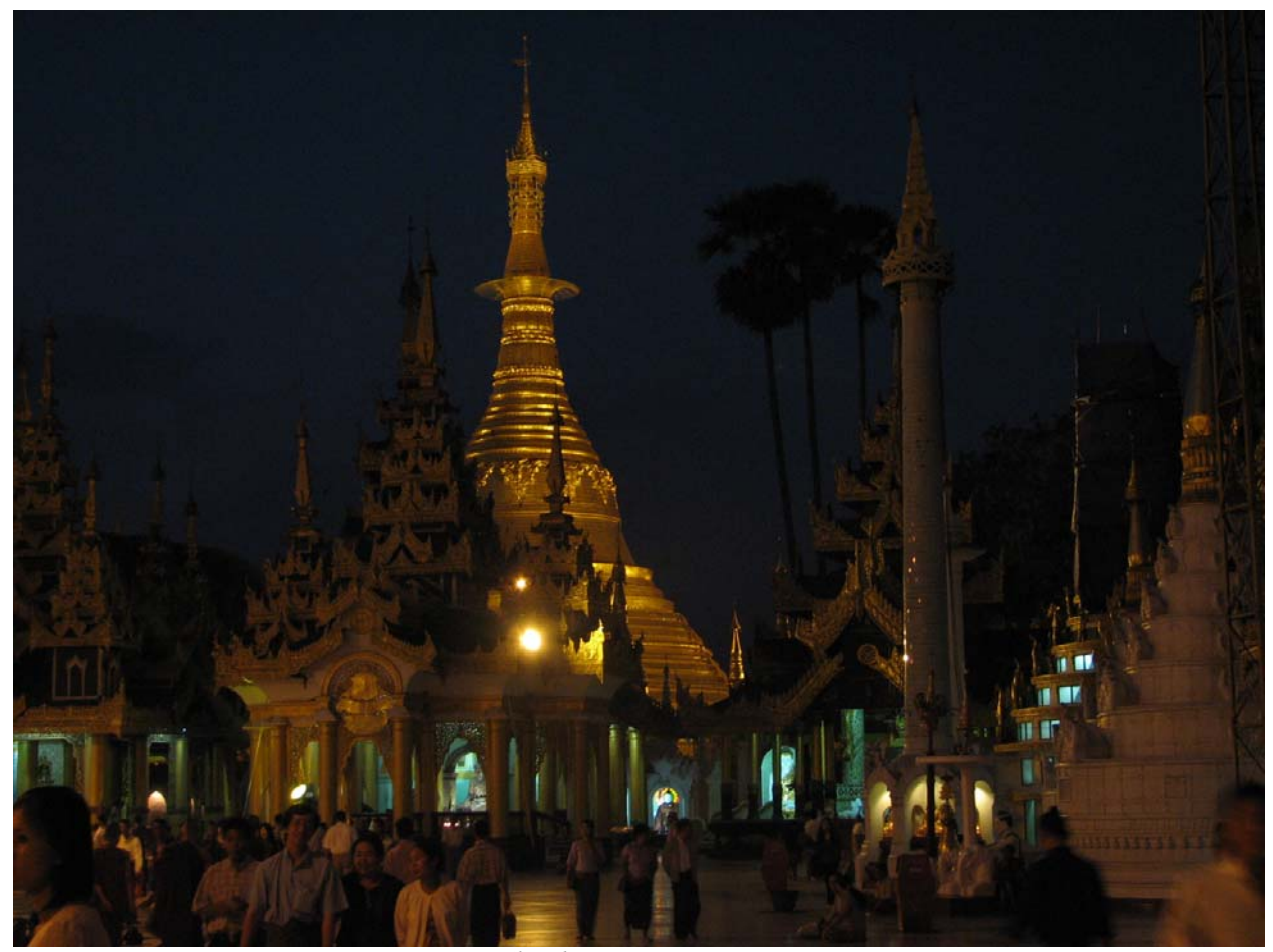
Shwedagon Paya in Yangon