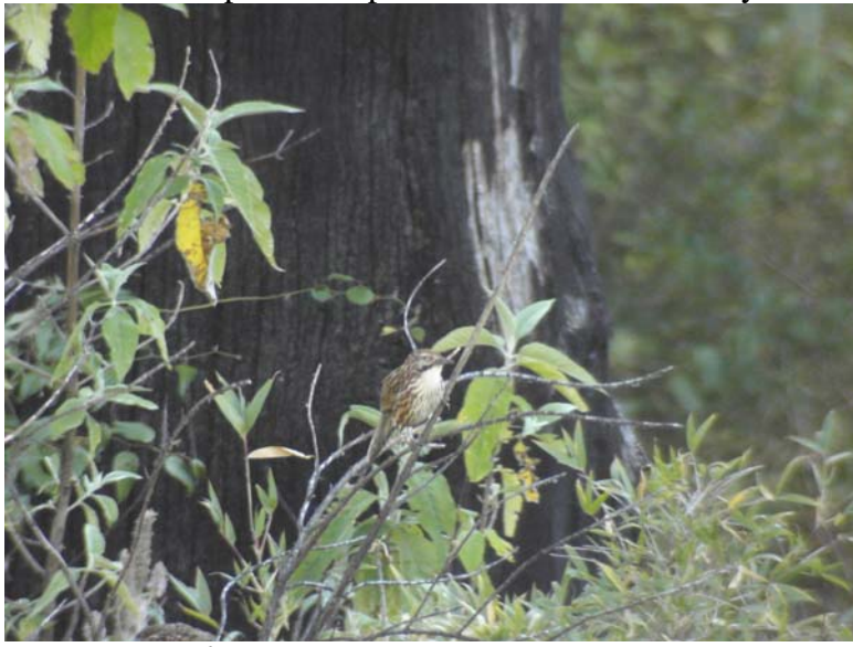
Mount Victoria Babax

Two heard and one of them seen very well in a patch of dwarf bamboo, just short of the ridge in the oak forest (above 2400 masl) and another heard and one seen at 2400 masl at Mt Victoria. This species is split from Chinese Babax by Rasmussen.