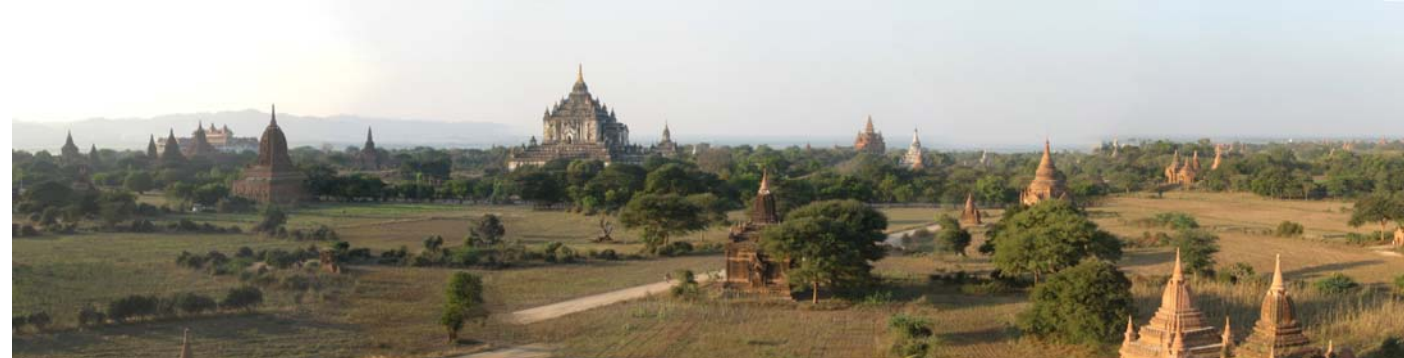
Panorama over Bagan

Top three cultural sites were Shwedagon Paya in Yangon, the floating gardens at Lake Inle and best of all the 2800 temples and pagodas at the ancient city of Bagan situated along the shores of one of the large Asian rivers, the Ayeyarwady River.