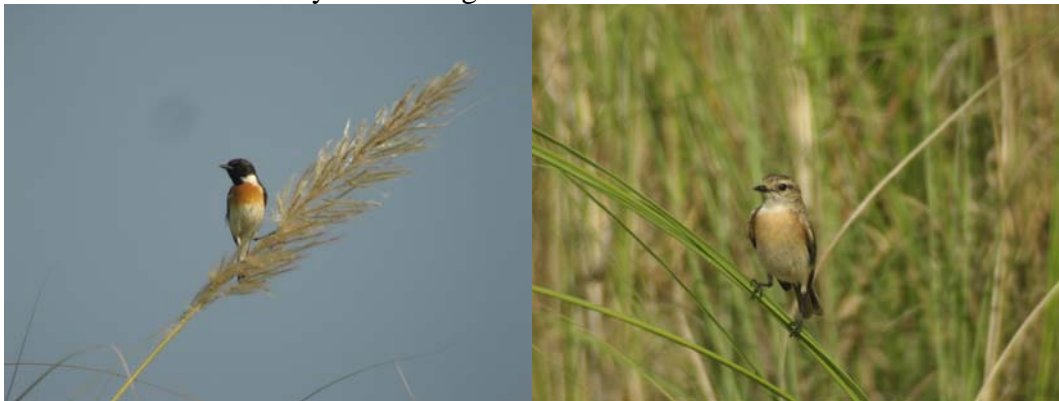
Male and female White-tailed Stonechats

white in the tail was only seen in flight and from below.