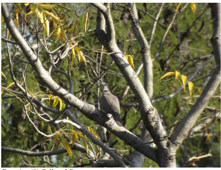
Eurasian (?) Collared-Dove

Red Collared-Dove, Streptopelia tranquebarica humilis