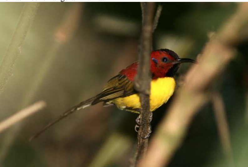
Gould's Sunbird, quite a different appearance compared to those in e.g. China

Black-throated Sunbird, Aethopyga saturate ochra & johnsi