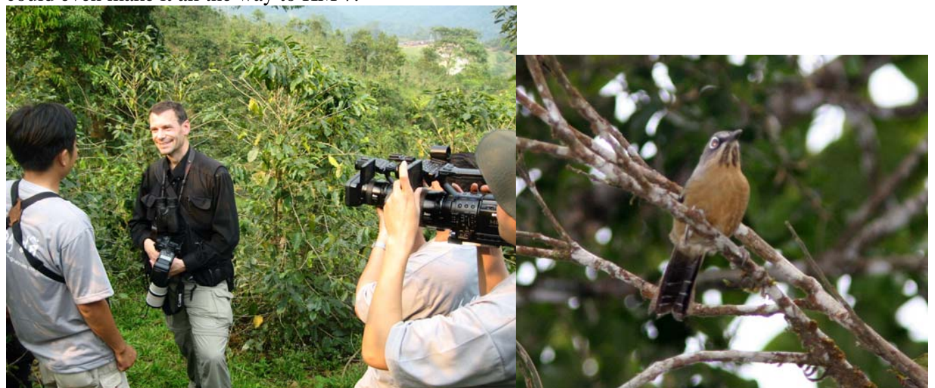
Yours truly being happily interviewed by the TV team after having seen...

Lo Xo pass hit the headlines during the last few years as THE site for Black-crowned Barwing. This species is endemic to central Annam and neighboring Lao and was described to science only some ten years ago. Interestingly it favours the scrub and plantations at the edge of the forest, so with the clearance of forest that is going on, it seems to have increased in numbers. In addition to this prize bird, Lo Xo also provides easy access to real good forest at altitudes between 1100 to 1400 masl. This is exciting as another recently described babbler, Golden-winged Laughingthrush, was discovered at nearby Ngoc Linh mountain. Hope is therefore that it may occur even at Lo Xo, although the altitudes are significantly below the 2000-2200 masl known range. The road to Dak Blo was only very recently constructed, so not many birders have been to the higher reaches of this forest. From the highest point at 1400 masl (KM 7) there is supposed to be a trail leading to perhaps 1800-1900 masl, which may very well be enough for the Laugher. The forest is excellent and is anyway worth birding for at least a day, maybe more. We played the song of Golden-winged all the way between KM 4 and 7, but got no response at all. It should be mentioned that the highest point of the road is actually the border with Lao, and foreigners are not supposed to be there without permission. Some local officers fortunately granted us access and our car could even make it all the way to KM 7.