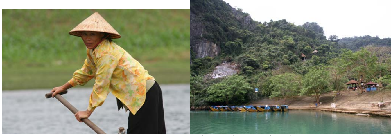
The jetty at the caves at Phong Nha

Phong Nha is a large national park bordering Lao's. From Hue airport it takes almost four hours to drive on good roads. For birders it is well known as one of the easiest sites to find the near endemic Sooty Babbler. The best site for this bird is the tourist caves less than half an hour boat-ride upriver from the entrance village. Previously the national park itself has been very difficult to access for foreigners due to the proximity to the Lao border. Only during the last year this has changed and it is now fully possible to enter the forest. We visited an area where Bao had seen Red-collared Woodpecker a few years earlier. To reach this area is one drives along the river (upstream) through the village. When the road suddenly becomes a smaller track, we turned left on a paved road. This means leaving the riverside and having the fields to the left and the limestone mountain to the right. After a few km there is a gate, where I guess a permit has to be shown. The patch of forest that we visited was on the right hand side between KM 11-12, which is now a sort of wild botanical garden with a few trails contouring a small ridge. The trails start either at the green houses near KM 11 or immediately beyond KM 12. In the late afternoon on the first day we also birded along the road between KM 12 and 13.