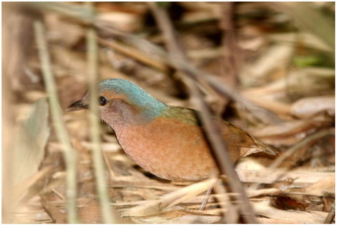
Blue-rumped Pitta at Cat Tien