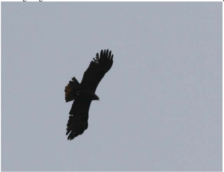
Black Eagle, better not being a Pheasant when this silhouette is overhead

Two sightings at Bach Ma summit area and two birds at the Bach Ma gate.