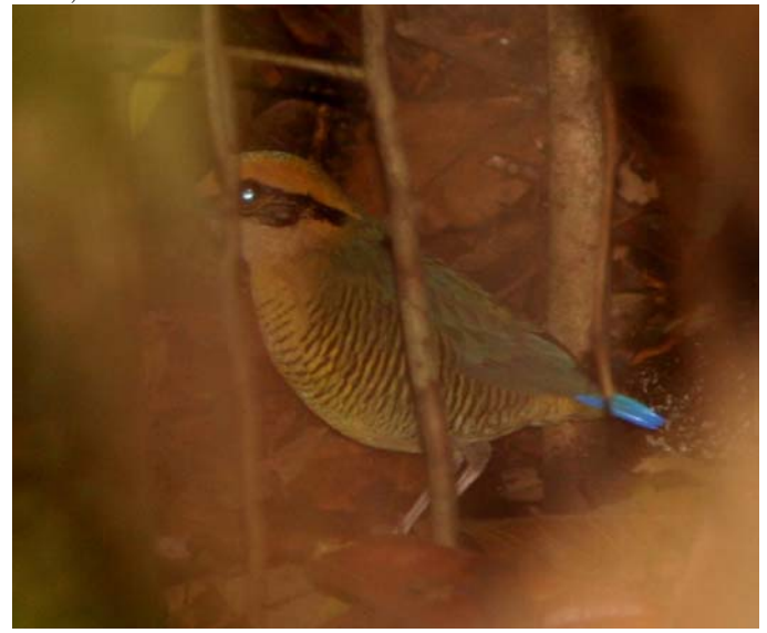
Female Bar-bellied Pitta with its gleaming tail

At least five heard at the forest inside Phong Nha NP in the late afternoon/evening, one heard at Bach Ma Pheasant Trail, at least ten at Bau Sau Trail Cat Tien of which three seen well and a few more scattered heard at Cat Tien.