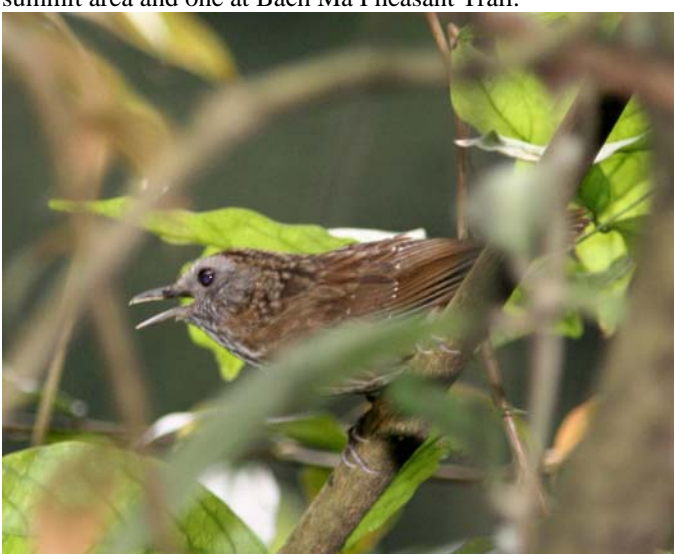
Streaked Wren-Babbler at Phong Nha

One pair at the caves at Phong Nha. Apparently occupying the same territory as the Sooty Babblers. One at Bach Ma summit area and one at Bach Ma Pheasant Trail.