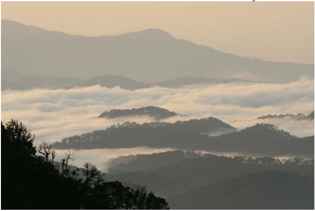
The vista from the summit of Mount Langbian

Mount Langbian was the targeted site for us on the Da Lat plateau. The mountain is situated very near to Da Lat town and can be reached in about 20 minutes. One has to go with one of the local jeeps up the mountain to where the summit trail starts. The trail first leads through open pine forest (good for V Greenfinch and the endemic taxon of Brown-throated Treecreeper) before entering the broadleaf forest. Key birds are Vietnamese Cutia, Collared Laughingthrush and Black-crowned Fulvetta. Indochinese Fulvetta and Indochinese Wren-Babbler are said to occur, but are very seldomly seen. The area is rather small and from the start of broadleaf forest to the summit is only 30 minutes of steady walk.