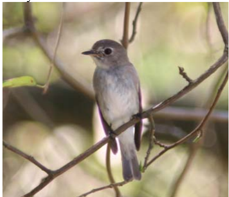
Asian Brown Flycatcher

Narcissus Flycatcher, Ficedula narcissina