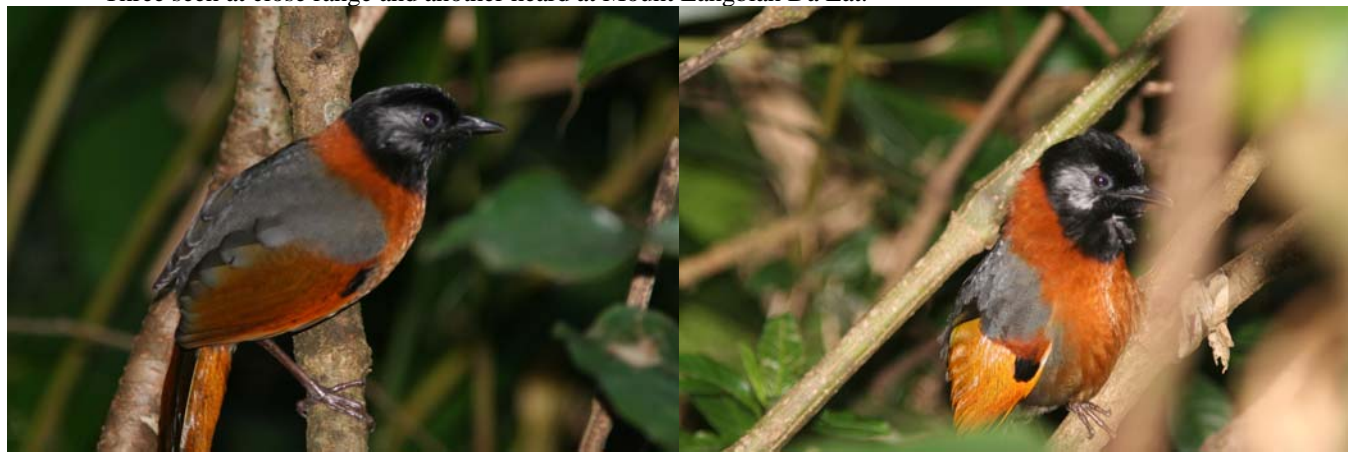
Abbott's Babbler, Malacocincla abbotti altera

Three seen at close range and another heard at Mount Langbian Da Lat.