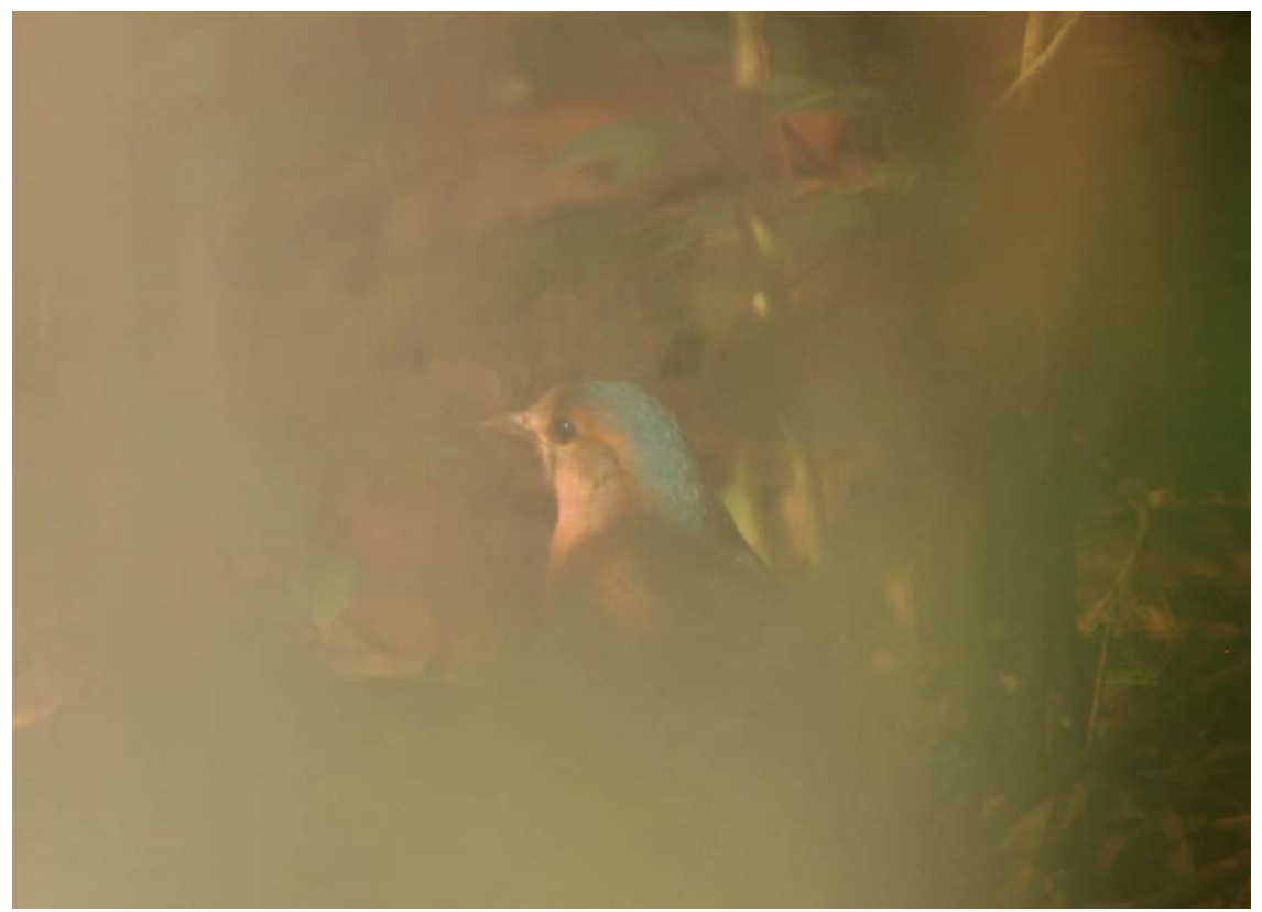
Blue-rumped Pittas, one male even hit by a sun-ray