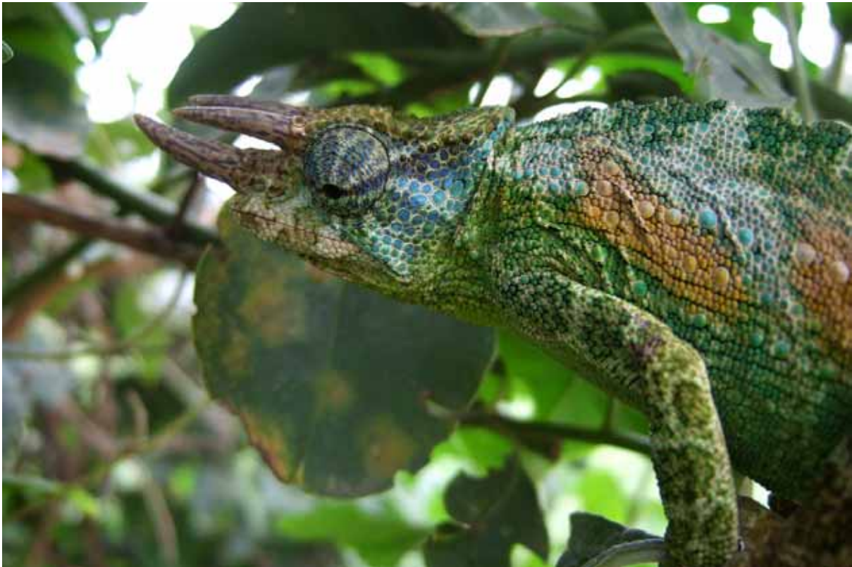
Johnston's Chameleon ( Chamaeleo johnstoni)