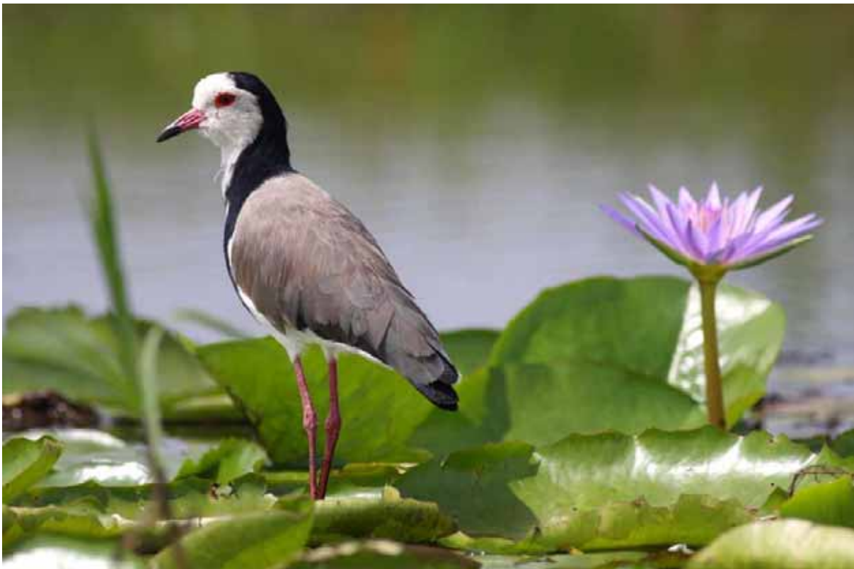
Long-toed Lapwing ( Vanellus crassirostris )

I was picked up at the hotel at 06.45 and driven to the nearby Mabamba Bay Wetland. Mabamba Bay is supposed to be one of the most accessible and reliable sites to see this sought-after bird, but this morning luck was not on my side and after canoeing through the wetland for three hours it was time to head back to shore again. My plan had been to drive back to Entebbe, have lunch, and visit the botanical gardens in the afternoon. But, not having seen the shoebill I decided to have another go later in the afternoon. Not having brought packed lunch we drove to the village of Mpigi and had a nice meal of beans, rice and chapatti at a small local restaurant.