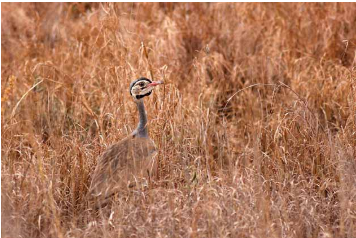
White-bellied Bustard ( Eupodotis senegalensis )

Trip reports from www.travellingbirder.com