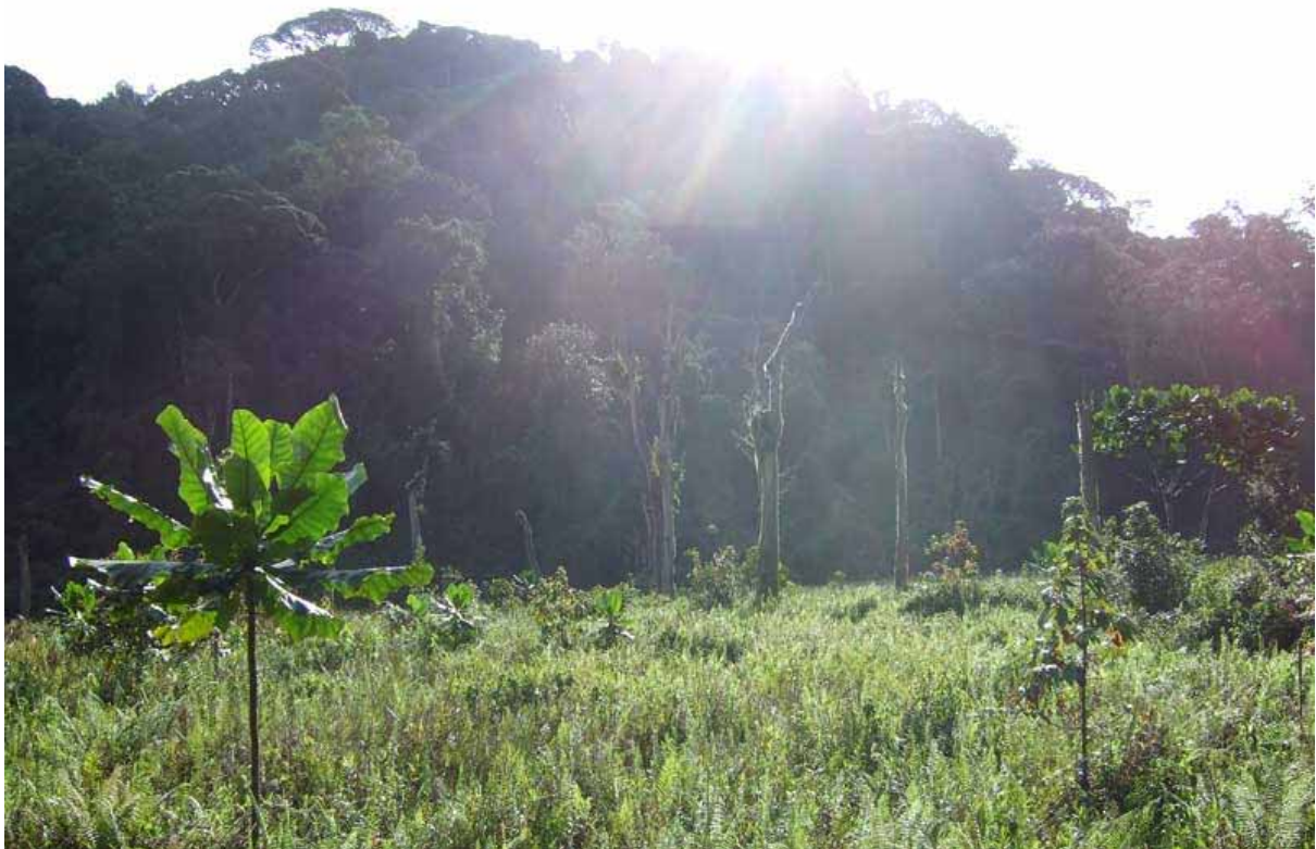
Morning at the Kamiranzovu marsh.

Today we had until lunch in Nyungwe and we decided to spend the morning on the trail surrounding Kamiranzovu marsh. The scenery at the marsh was beautiful with several species of flowering orchids. Several Grauer's Swamp-Warblers were easily found out on the marsh and a Sharpe's Starling was singing from a dead tree. Along the trail we had good views of Evergreen Forest Warbler , Black-faced Prinia and Black-billed Weaver , but both Neumann's Warblers refused to give us any tickable views. Claver told us that he'd seen the little known Albertine Owlet at this site, so it was too bad that we weren't allowed to do any night birding!