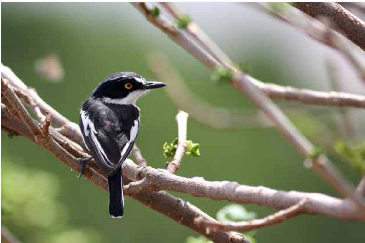
Western Black-headed Batis ( Batis erlangeri )

Today we had a very long drive ahead of us, so we had breakfast and left at 07.10. Since the president's wife was visiting Moroto the same day we were told that security would be extra tight in the area and that it should be safe for us to take the route over Moroto back. We decided to trust their advice, but Alfred was even more stressed than on the way up, and kept pushing on, avoiding any stops along the road – and meeting UN caravans with heavily armed escorts probably made him even more anxious to get out of the Karamoja province. Since we were passing through some really good looking habitat this was a bit frustrating, but we had to do with birding from the car. Good observations included large numbers of White-rumped Shrikes – at least 60 on my side of the road – a couple of Heuglin's Wheatear and a handful of Purple Rollers .