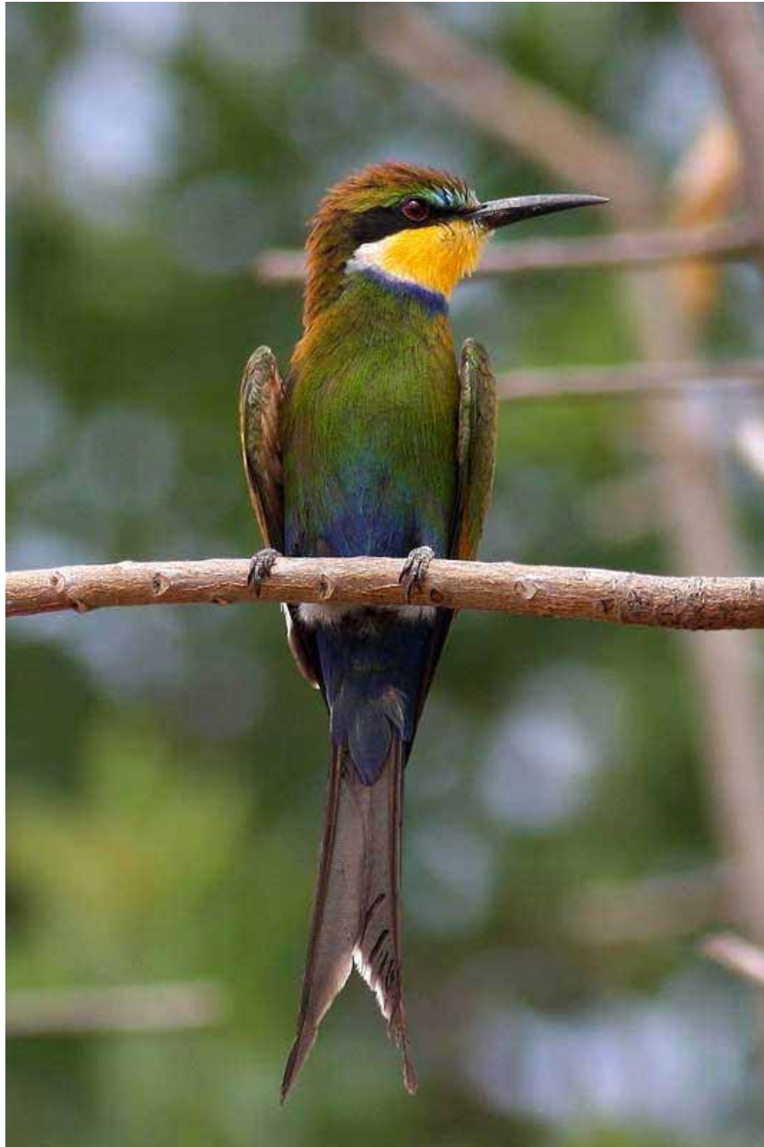
Swallow-tailed Bee-eater ( Merops hirundineus )