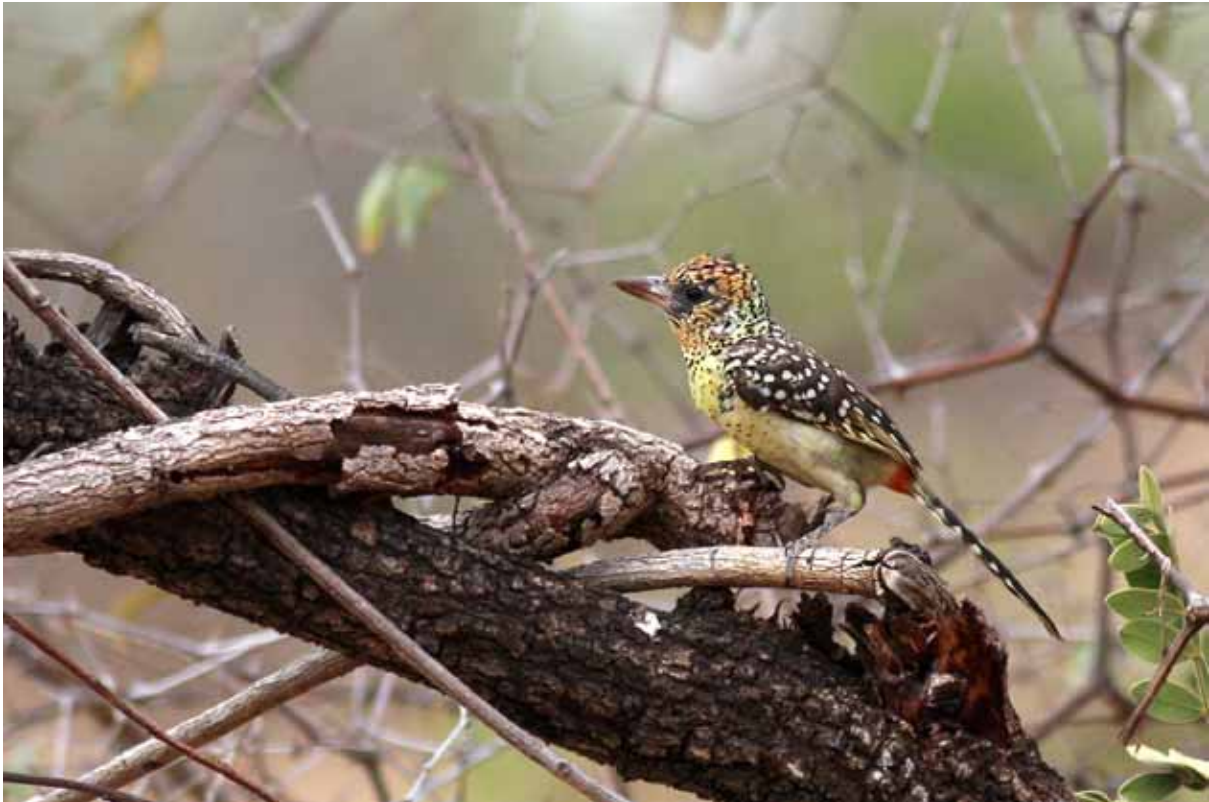
d'Arnaud's Barbet ( Trachyphonus darnaudii )

At 17.00 we decided to head for Kampala, since Alfred wanted to avoid driving at night, arriving at the Fairway Hotel at 18.30.