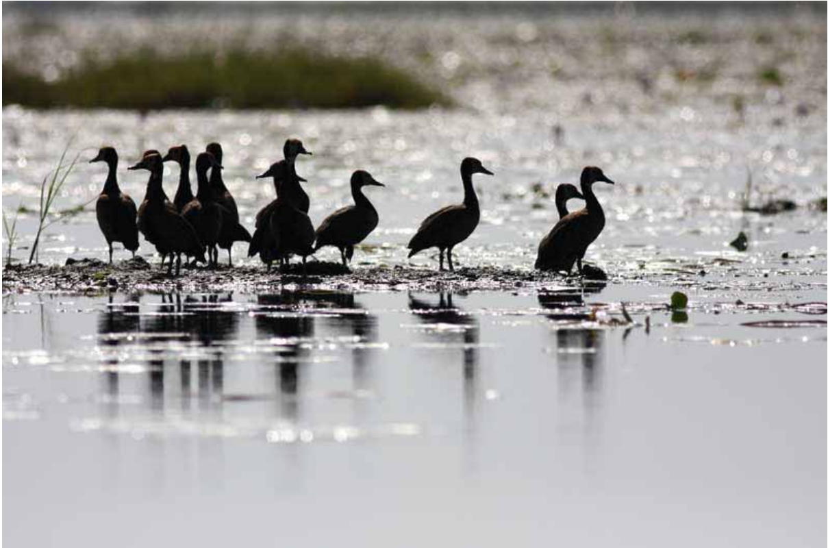
Whistling-Ducks on Lake Bisina. ( Dendrocygna bicolor )

Apart from this individual we also saw a single male and a few more females that were almost certainly Fox's Weavers. We also heard a Red-chested Flufftail calling and added Beaudouin's Snake-Eagle, African Purple Swamphen, Greater Painted-snipe and " Black-headed " Wagtail to the trip list.