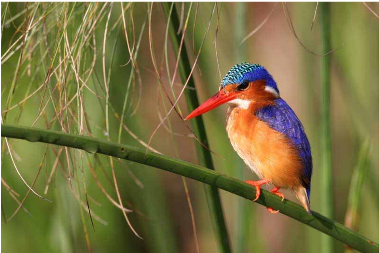
Malachite Kingfisher ( Corythornis cristata )