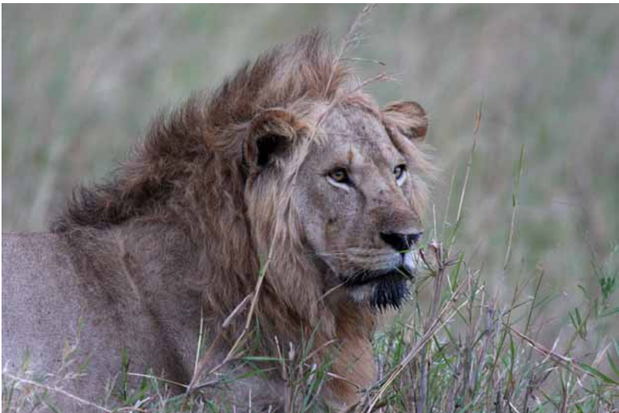
Lion ( Panthera leo )