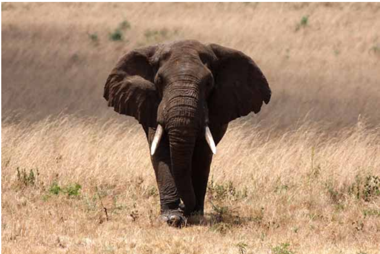
African Savanna Elephant ( Loxodonta africana ) ©Markus Lagerqvist

Back at the lodge we spent more time than planned enjoying another fantastic meal and we had to rush to the boat taking us out on the Kazinga Channel. From the car we spotted a Southern Red Bishop , and in some shrubbery close the dock we spent a few rushed minutes searching for roosting nightjars, seeing at least a couple of Square-tailed Nightjars .