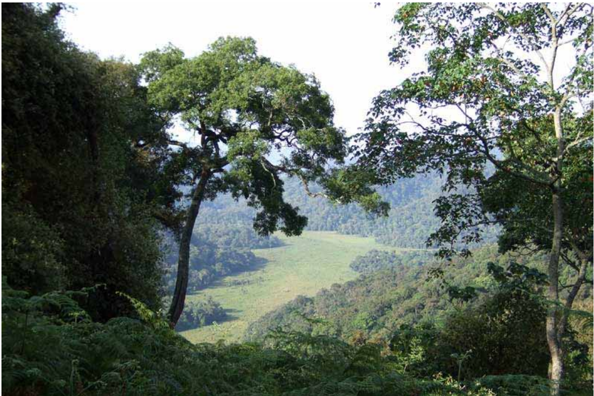
The fabled Mubwindi Swamp.

At 07.30 our ranger finally materialized, and we headed out on the trail. We walked on fairly quickly to get to the best area, not seeing much more than a couple of White-headed Wood Hoopoes on the way. Well at the nest site we quickly discovered a pair of Red-chested Owlets giving us fantastic views. When inspecting the nest itself we saw that it looked unfinished and had probably been deserted. Maybe owls aren’t the bird’s favourite neighbours? Staking out the site for a while proved unproductive and we decided to walk down to the swamp, birding and keep listening for the characteristic sound.