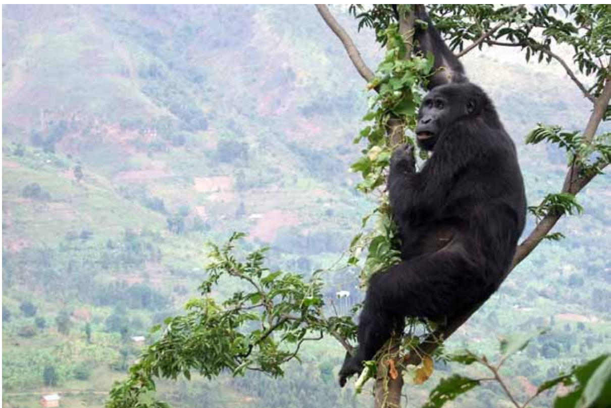
Eastern Gorilla ( Gorilla beringei).

Our prayers were heard and we were assigned to meet group M. Starting out at 09.00 it only took half an hour for the trekkers to locate the group. We then had the privilege to spend an hour in the company of these majestic animals – an experience not to be missed!