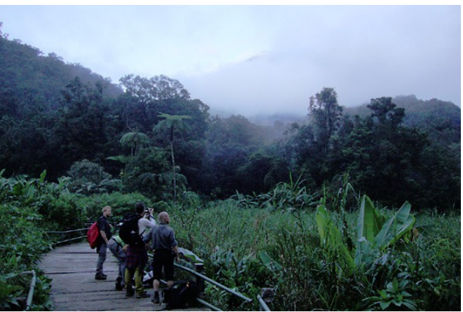
Break of dawn at the boardwalk. The summit of Gunung Pangrango barely visible through the clouds.