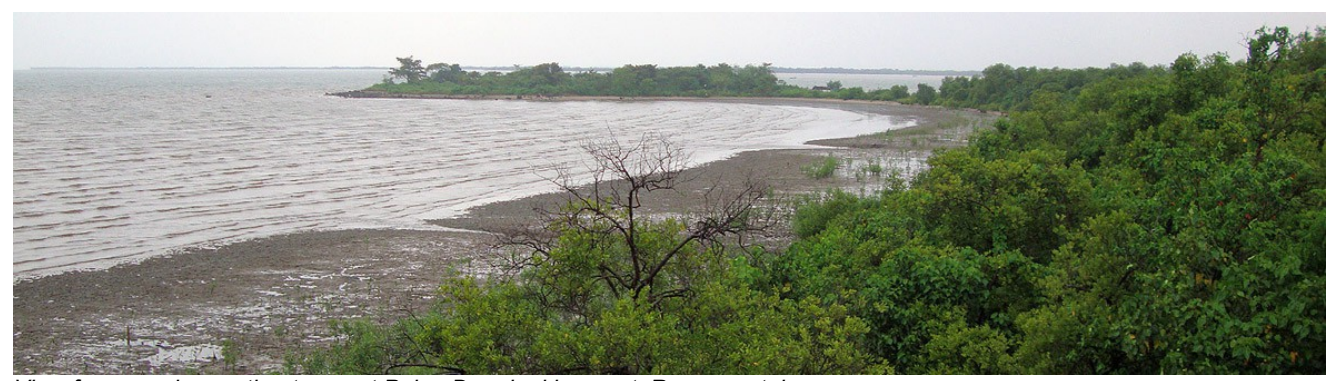
View from an observation tower at Pulau Dua, looking east. Rare coastal mangroves.