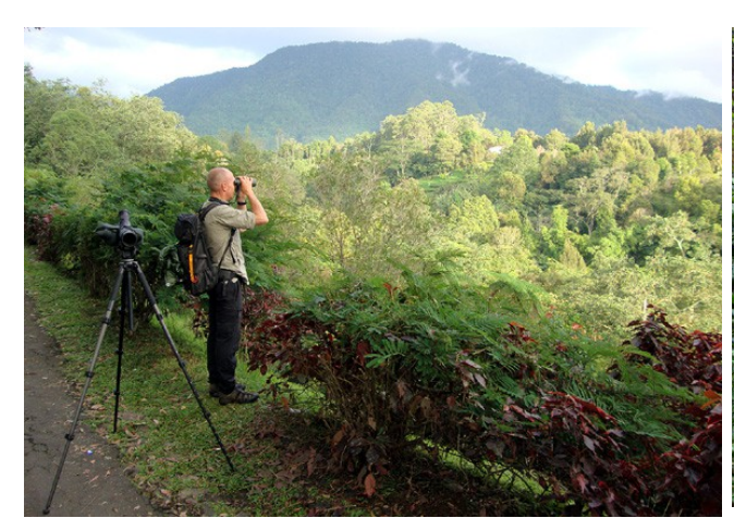
JN scanning at Cibodas Botanical Gardens. Where is that Kingfisher?