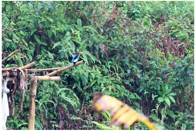
Finally all of us had tremendous views of this huge-billed Javan Kingfisher on the way to Gunung Halimun.