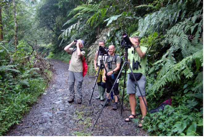
A successful DIMP-twitch. Dark-backed Imperial Pigeon scoped at Gunung Halimun.