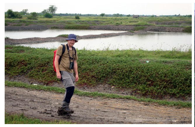
MN practice cley-walking at Pulau Dua.