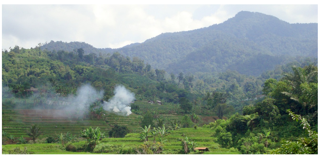
Road to Gunung Halimun National Park. One of very few still truly wild places of western Java. Pristine rainforest covers the slopes of surrounding hills.