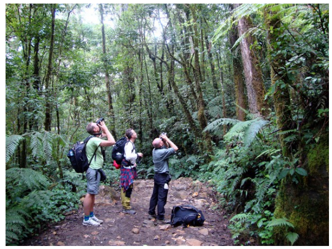
Breaking necks at Air Panas, Gunung Gede.