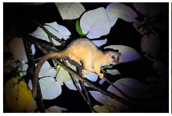
Recently rediscovered Javan Small-toothed Palm Civet in a Great flashlight-views of this endemic Javan Frogmouth at fruiting tree at Cikaniki Research Station, seen from the veranda(!).