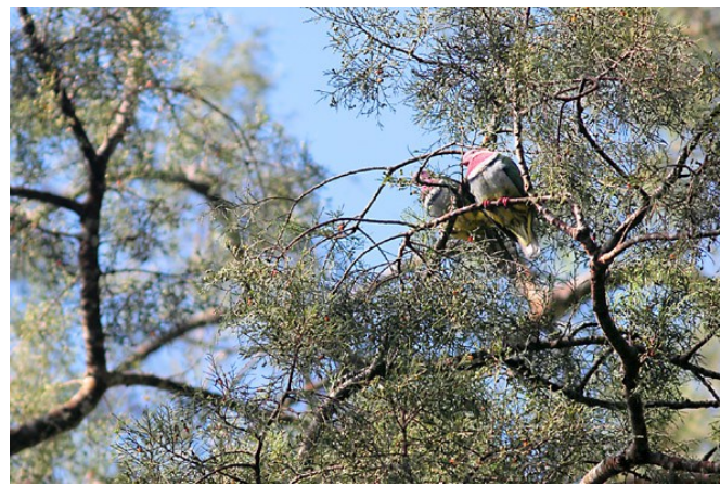
Pink-headed Fruit Dove, frequently heard hooting between the junction and Air Panas at Gunung Gede.