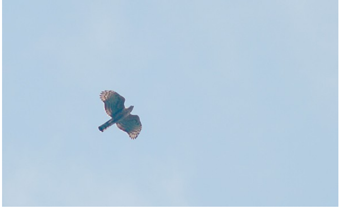
Javan Hawk Eagle, seen a few times along the entrance road to Cikaniki Research Station.