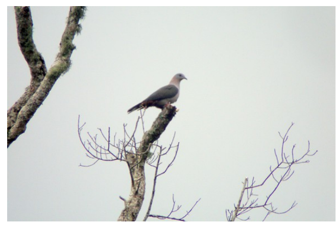
Dark-backed Imperial Pigeon at the entrance road to Cikaniki Research Station.