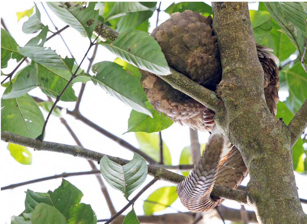
Common African Pangolin (sometimes called White-bellied Pangolin).

Common African Pangolin Manis tricuspis 1 Atewa farm bush 13.11.