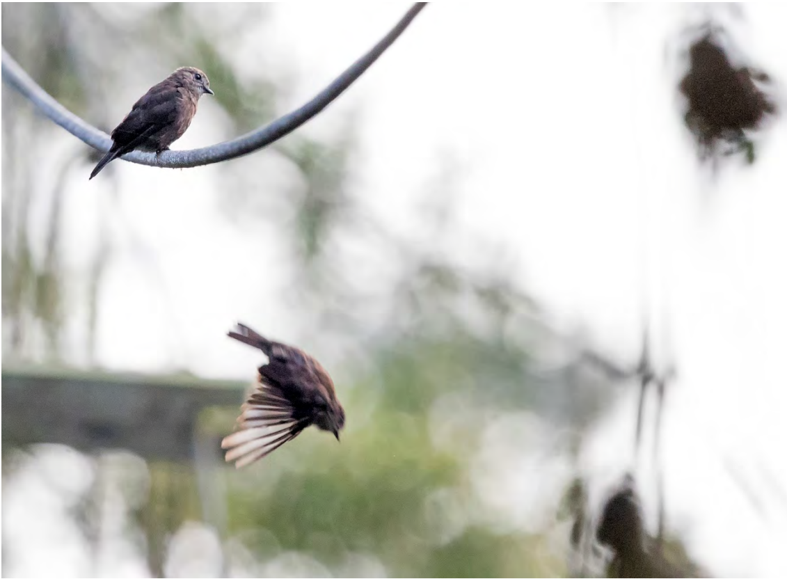
Ussher's Flycatcher is a locally common to rare Upper Guinea Forest Endemic.