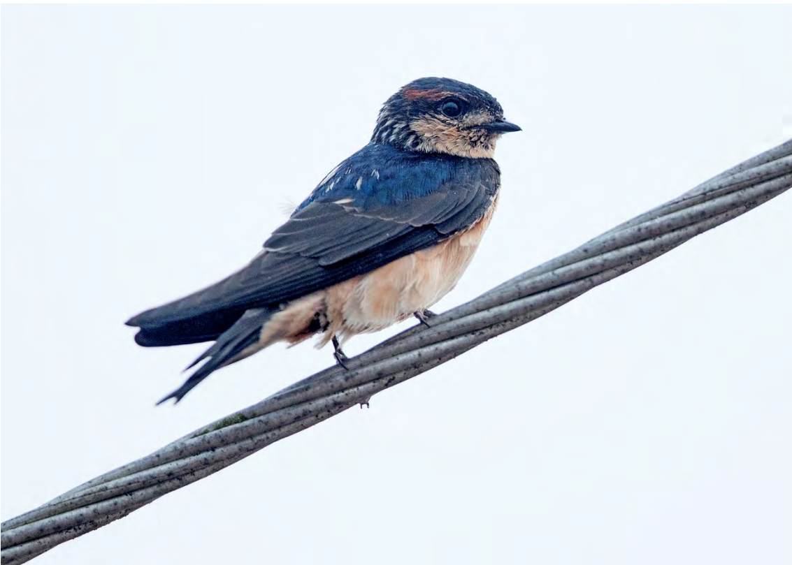
Preuss's Cliff Swallow