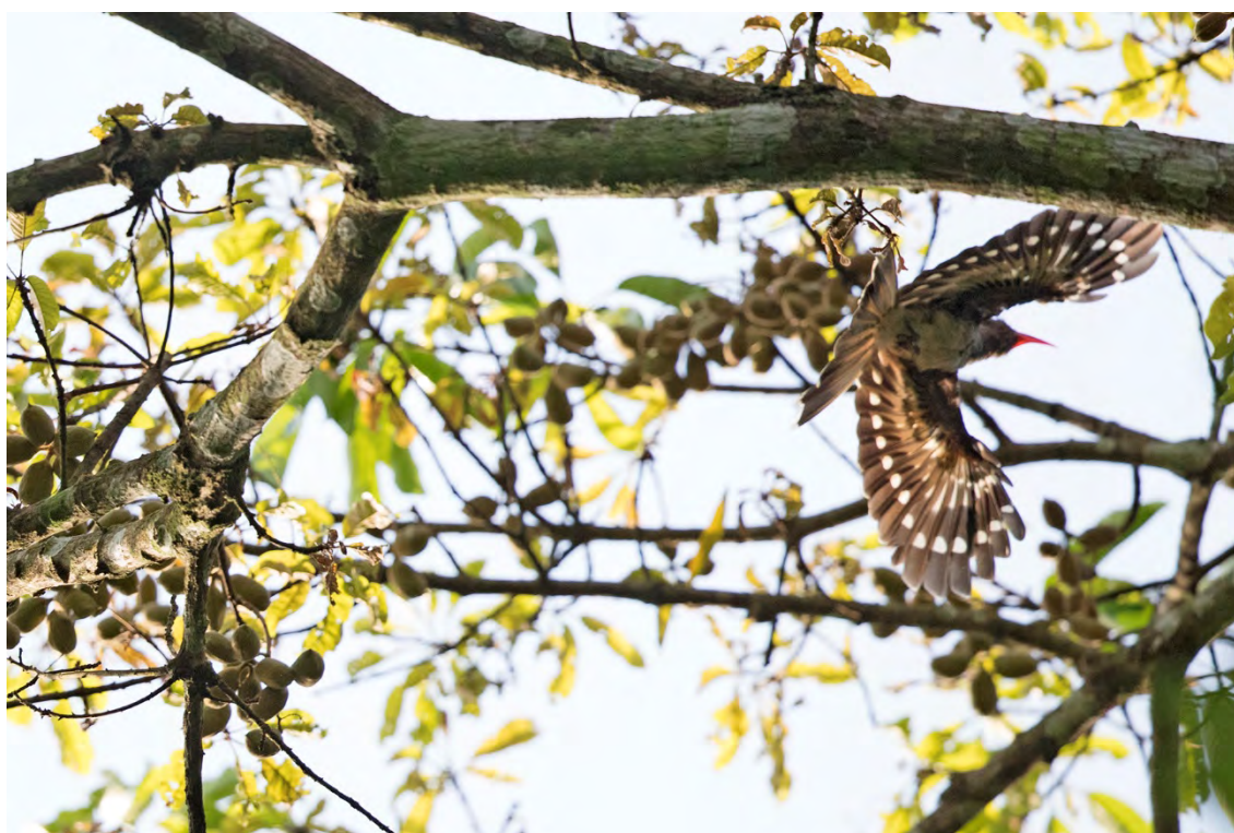
Red-billed Dwarf Hornbill