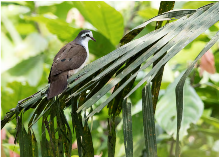
Tambourine Dove, more often heard than seen.