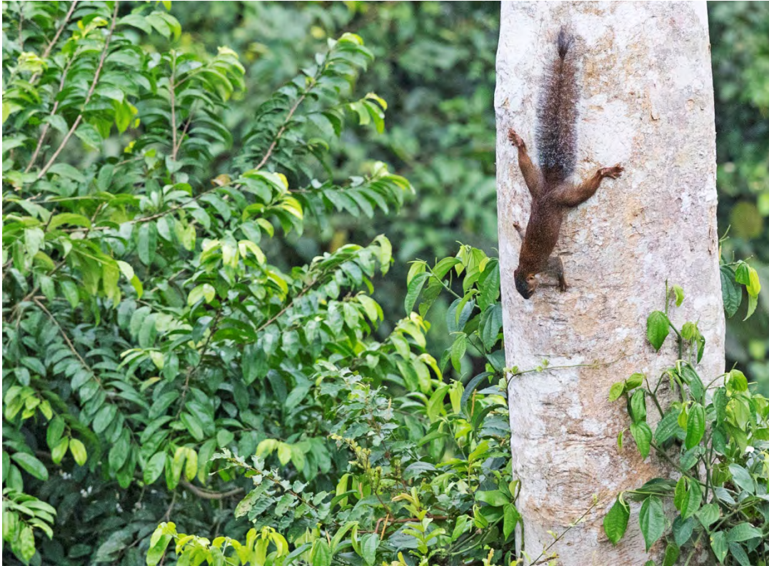
Forest Giant Squirrel in Kakum NP, seen from the canopy walkway.

Common African Pangolin Manis tricuspis 1 Atewa farm bush 13.11.