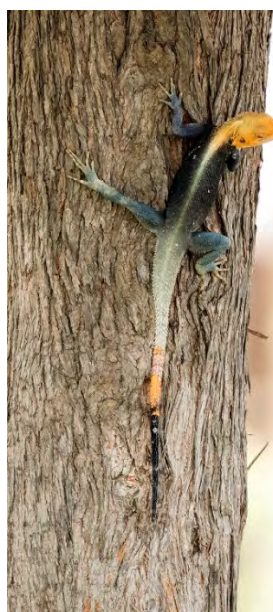
Common Agama Agama agama