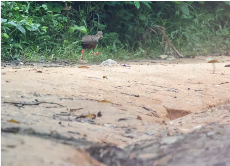
We were lucky to get a glimpse of the rail running on the road...