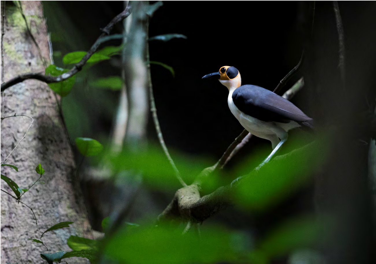
One of the trip's many highlights: White-necked Rockfowl (Yellow-headed Picathartes).