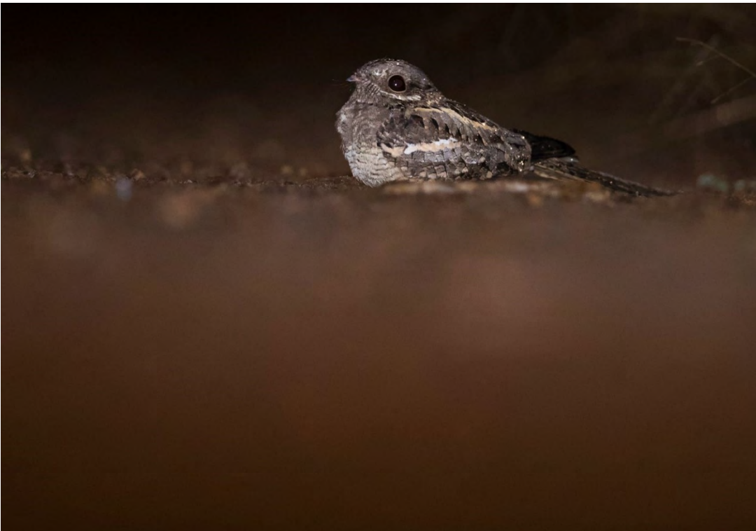
Long-tailed Nightjar on the road in Kalakpa.

84. Long-tailed Nightjar Caprimulgus climacurus Caprimulgus climacurus sclateri 1 Bonkro 10.11 and 2 Kalakpa RR 13.11, 8 there 14.11.