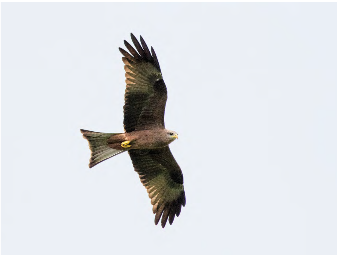
Yellow-billed Kite, a common bird in Ghana.