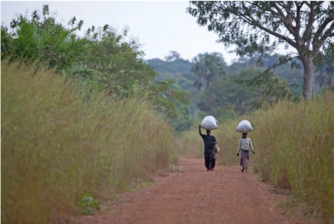
Ghana people, Kalakpa Reserve.