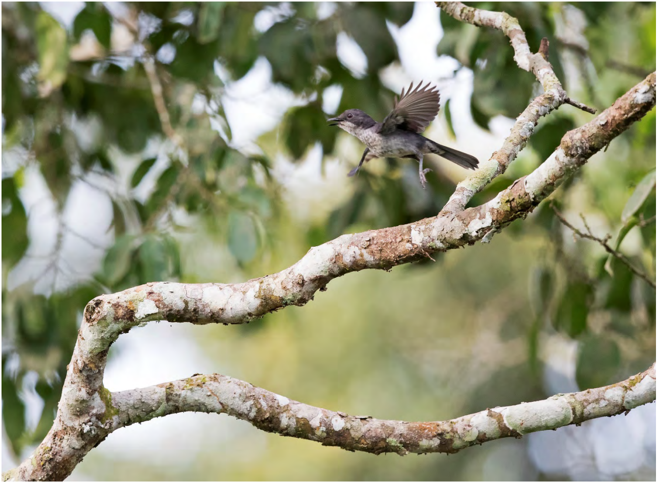
Fraser's Forest Flycatcher