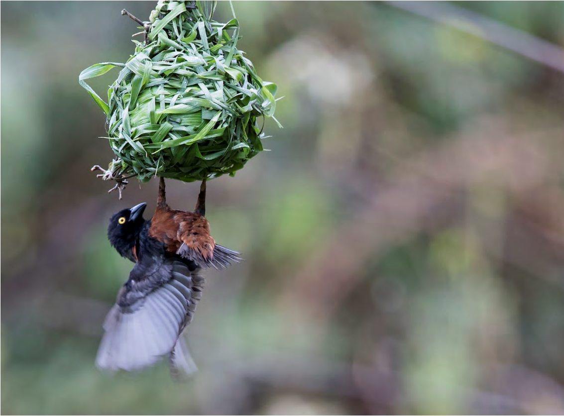
Vieillot's Black Weaver