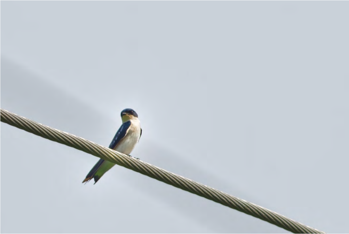
Pied-winged Swallow