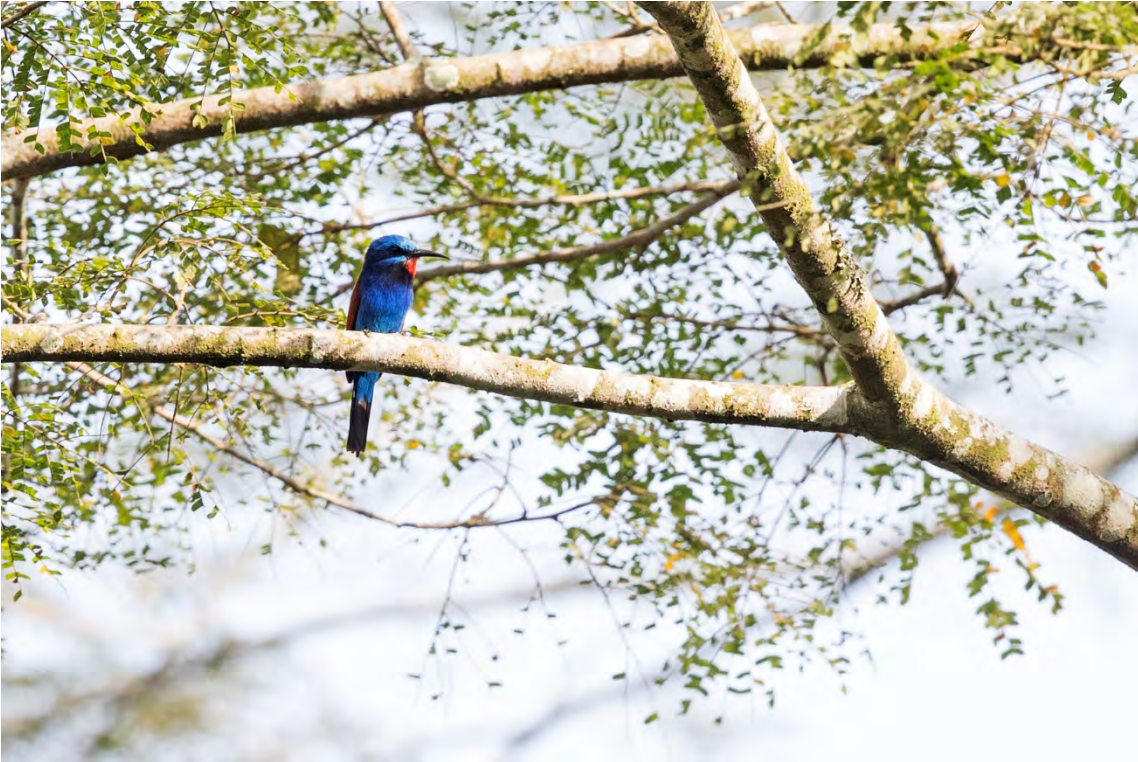
Blue-moustached Bee-eater, a “most wanted” species!