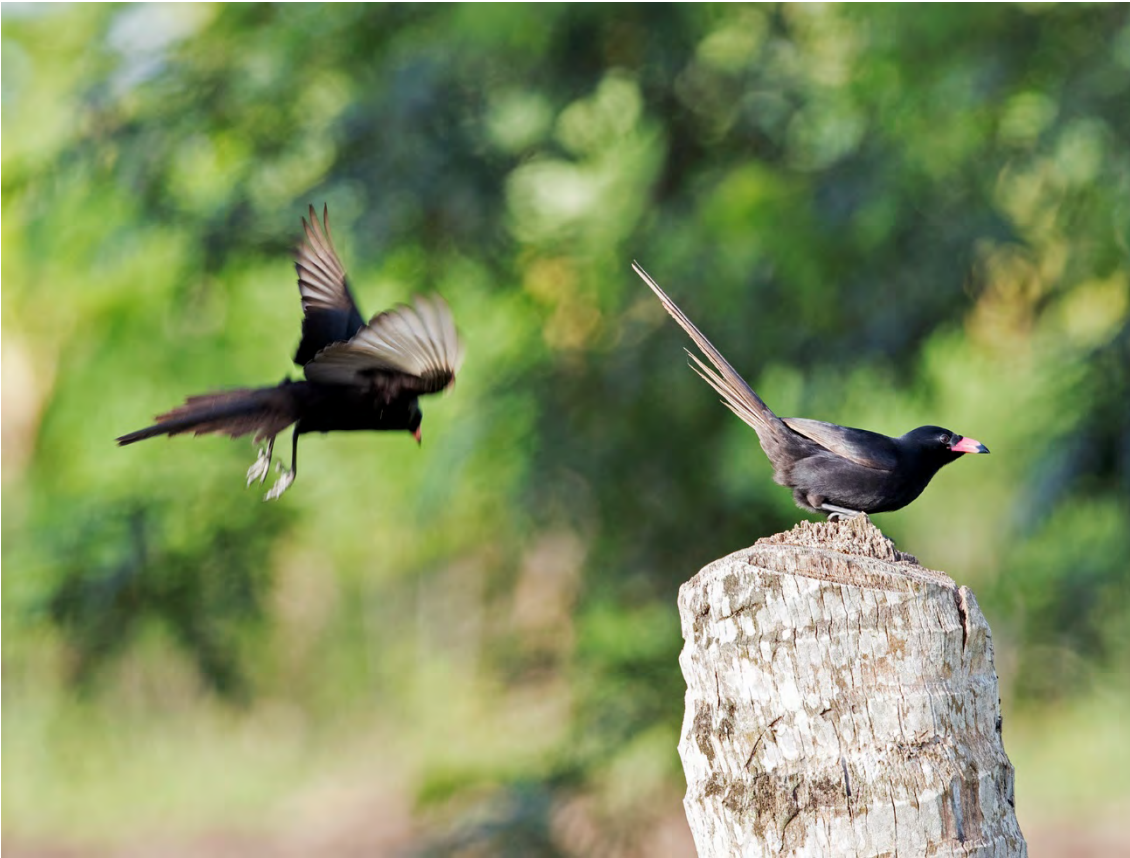
Piapiac, juveniles (note pink bill).