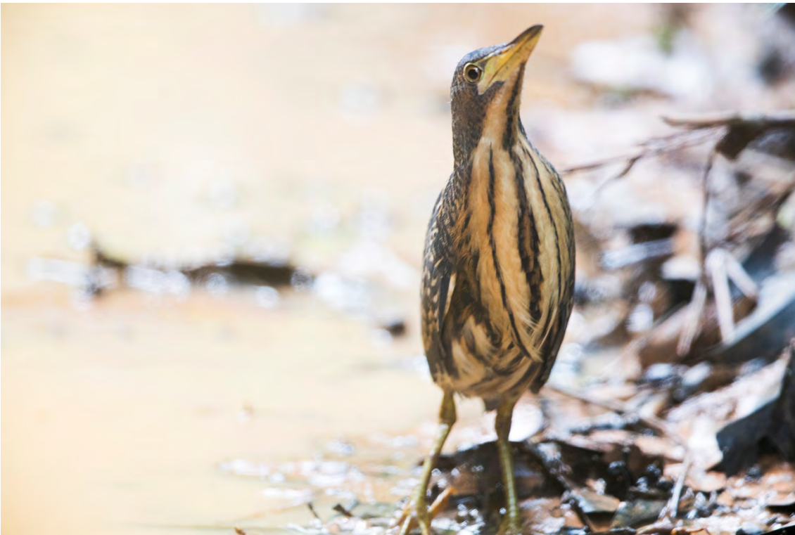
A Dwarf Bittern was standing on the road in Ankasa Reserve, just in front of our vehicle.