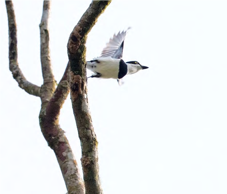
Fernando Po Batis

157. Fernando Po Batis Batis poensis Batis poensis occulta 2 Atewa Range Forest Reserve 12.11.