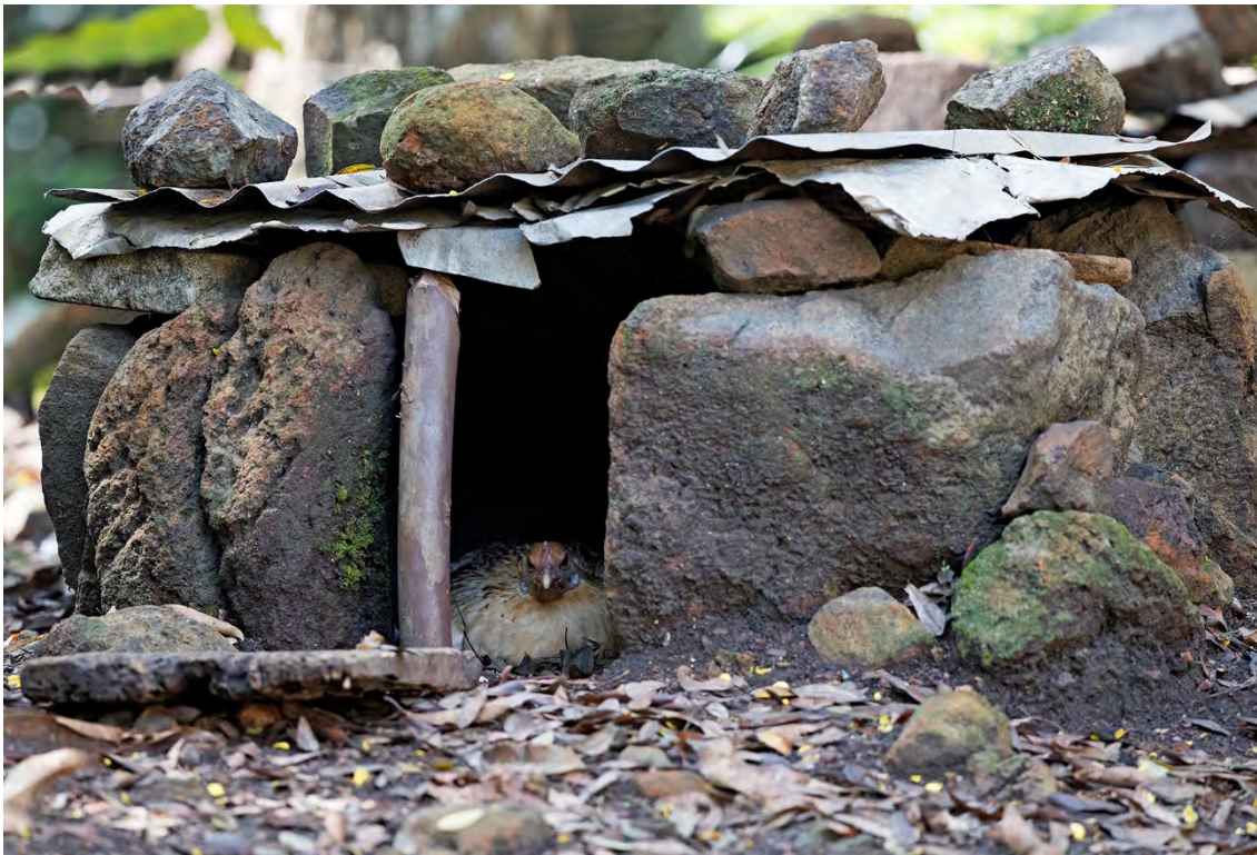
A hen's house at the parking lot in Kalakpa Forest Reserve.

331. Yellow-fronted Canary Crithagra mozambica Crithagra mozambica caniceps 10 Kalakpa RR 14.11, 10 there 15.11.