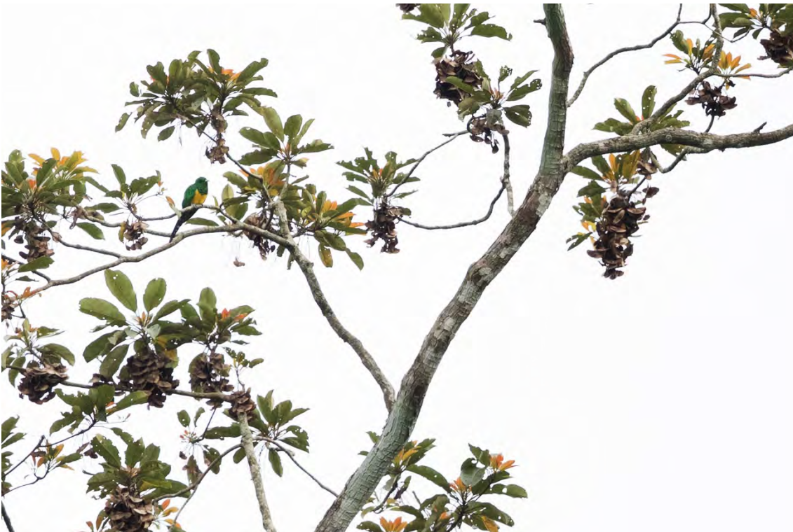
African Emerald Cuckoo. More often heard than seen. Has a characteristic call: "Hello Georgie!"