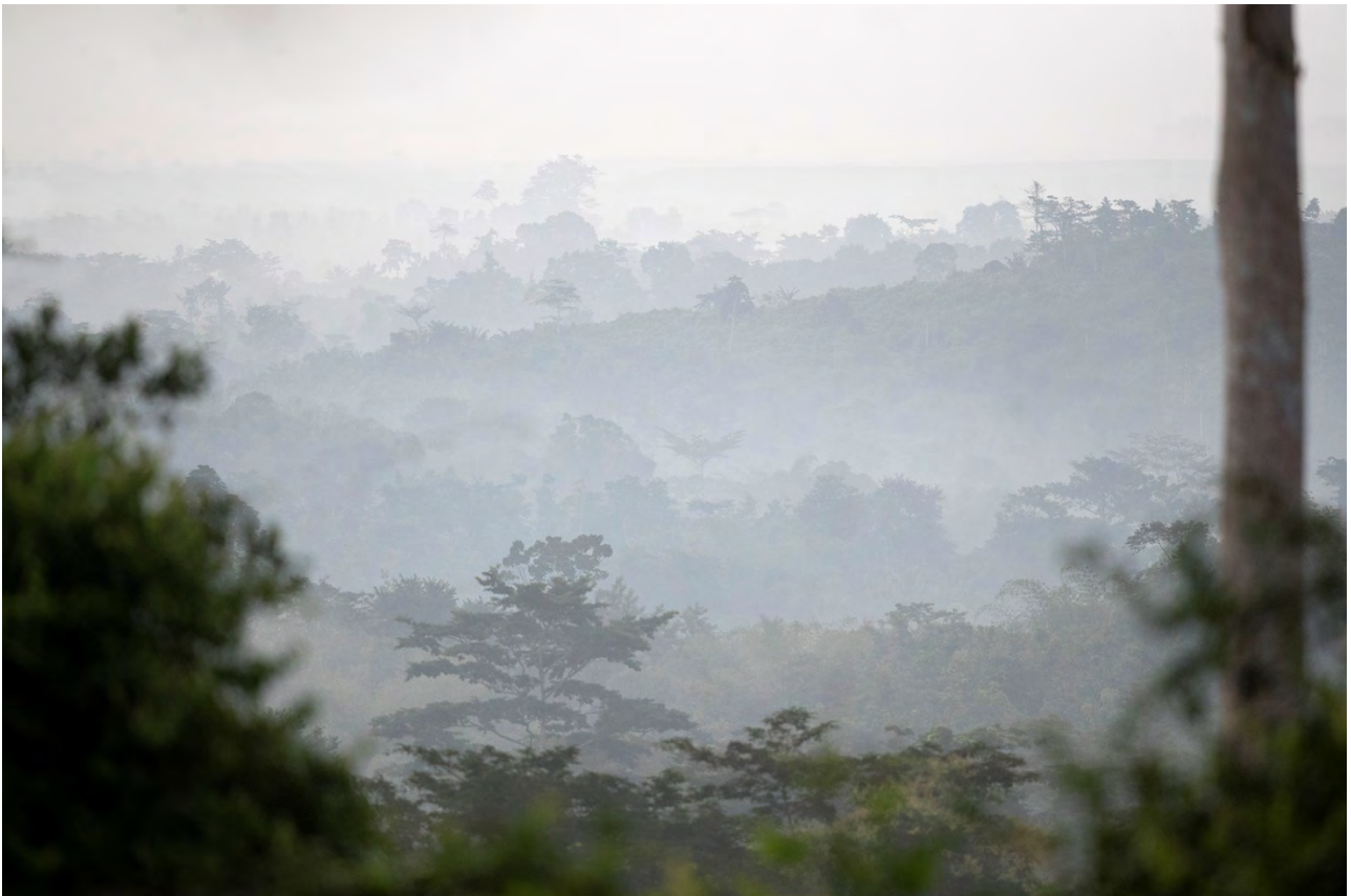
The canopy walkway and stunning rainforest in Kakum National Park.