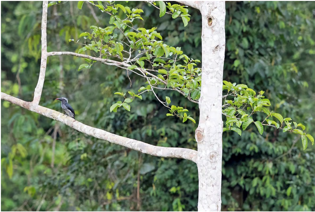
Black Dwarf Hornbill