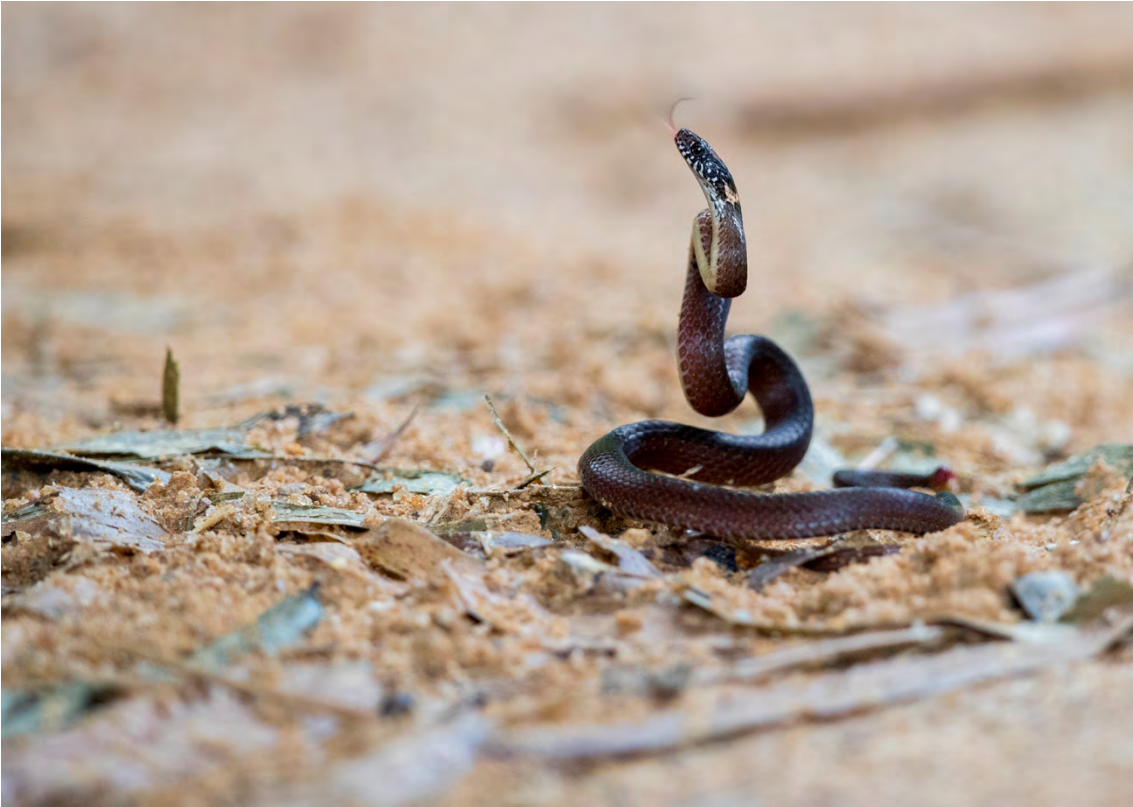
Variegated Marsh Snake Natriciteres variegata , Ankasa Reserve