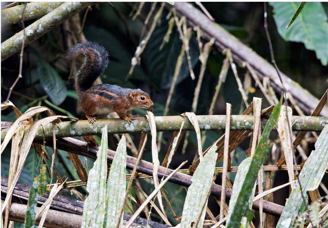
Fire-footed Rope Squirrel

Fire-footed Rope Squirrel Funisciurus pyrropus 1 Ankasa Reserve 8.11, 1 heard 10.11.