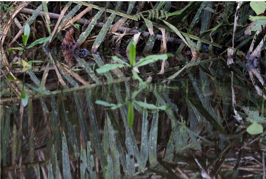
Dwarf Crocodile Osteolaemus tetraspis , listed as Vulnerable by IUCN.