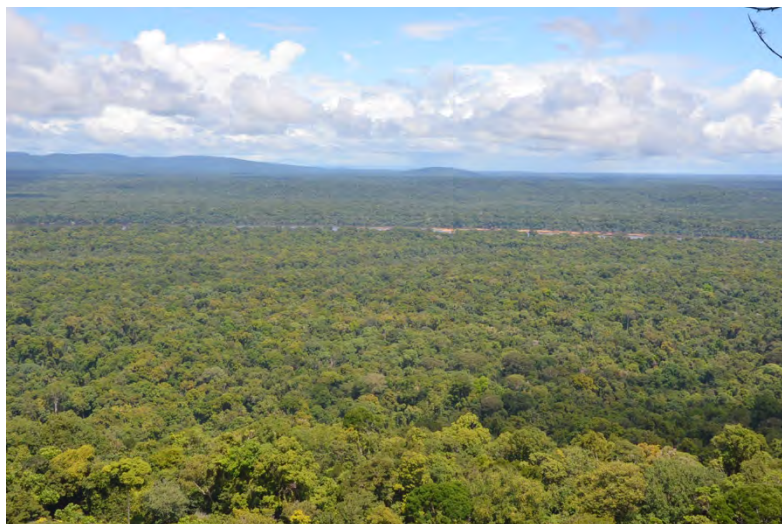
PHOTO: VIEW FROM TURTLE MOUNTAINS