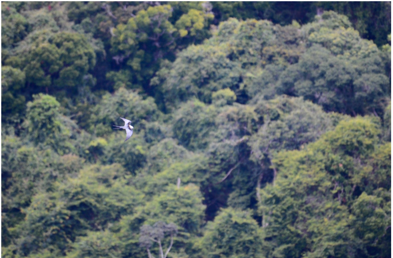
Photo: Swallow-tailed Kite