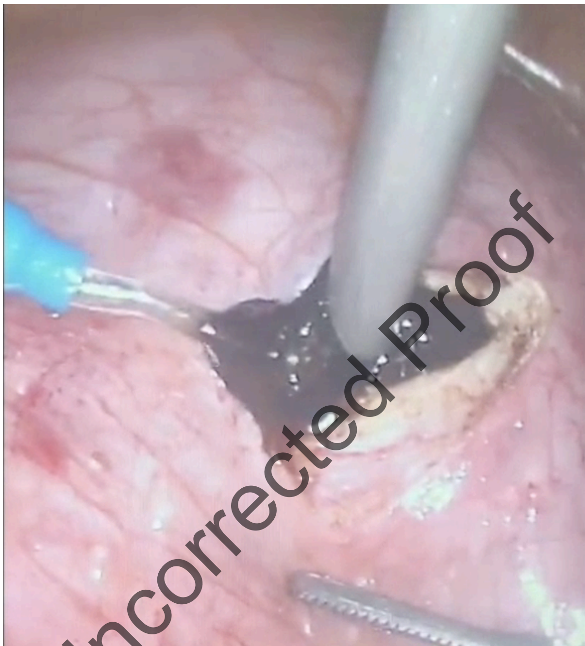
Figure 2: Draining the old menstrual blood