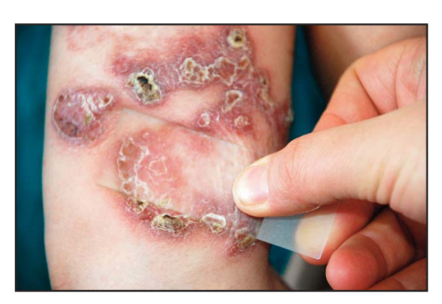
Figure 2. Apple-jelly appearance on diascopic examination

were contracture deformities on medial interphalengeal joints of 4. and 5. fingers of left hand. Applejelly refle was found positive on diascopy examination ( Figure 2 ). Routine biochemistry tests, urogram, hemogram, peripheral blood smear, CRP, tumor makers, hepatitis markers, chest graphy were normal. Bacillus was detected in 300 areas in one of the AARB (Acid-Alcohol Resistant Bacteria) examinations in sputum done on 3 sequential days