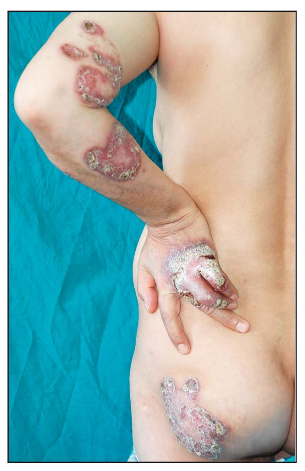
Figure 1. Typical lupus vulgaris plaques and joint deformities

were contracture deformities on medial interphalengeal joints of 4. and 5. fingers of left hand. Applejelly refle was found positive on diascopy examination ( Figure 2 ). Routine biochemistry tests, urogram, hemogram, peripheral blood smear, CRP, tumor makers, hepatitis markers, chest graphy were normal. Bacillus was detected in 300 areas in one of the AARB (Acid-Alcohol Resistant Bacteria) examinations in sputum done on 3 sequential days