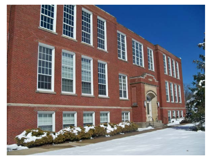
The building served as a school for almost eight decades.

that replaced them, see Issue 5 of Olmsted 200 from October 2013.) The wagons were needed to carry all students who lived more than a mile from the school and all first-grade students. Presumably the eight kid wagons arrived soon after that and classes began in the new school because the Enterprise made no more mention of the wagons - or the school – in the following weeks and months with the exception of this item in the December 29 edition: "Three of the 'kid wagons' failed to