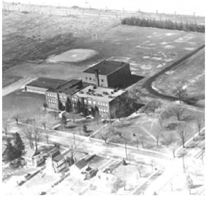
This aerial photo shows the 1916 school in the center, the 1926 addition to its immediate left, the 1948 addition to the left of that and the 1938 gymnasium above them.

After a new high school opened in 1968, the old school became a middle