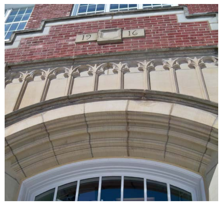
although the building was used for The original portion of the school, now Olmsted Falls various other purposes until it was City Hall, shows the 1916 date of its construction above one doorway.