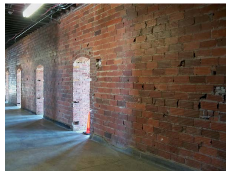
This photo shows an interior wall a few years ago before remodeling.

school with grades six through eight and served in that capacity for almost three decades until the district built the current middle school, which opened in 1996. The school district sold the old school in 1997. The 1916 and 1926 sections became Olmsted Falls City Hall, the 1938 gymnasium became the Olmsted Community Center, and the 1948 wing became a day care facility. Thus, a building that went into service one century ago this month with little notice still serves the community.