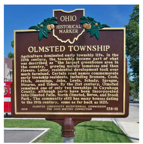
This is the south side of the new marker.

The marker and a similar marker for Olmsted Falls that was unveiled on Memorial Day at the Village Green were among the final projects for the Olmsted Community Bicentennial Commission, which was formed a few years ago to celebrate the 200<sup>th</sup> anniversary of Olmsted Falls and Olmsted Township. Although the original plan was for one side of both markers to be the same and the other sides