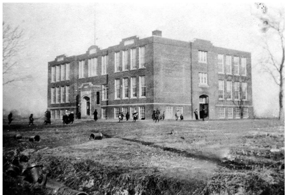
This undated photo seems to have been taken shortly after the school was built in 1916.

Thus, a reader might have expected a big article in the newspaper about the opening of the school in September 1916. But that reader would have been disappointed. An Olmsted 200 review of copies of the Berea Enterprise on microfilm from August 1916 through May 1917 revealed hardly a mention of the new school. The regular Olmsted Falls column in the paper included just one item in the September 15 edition that indicated the school year started late: "On account of the 'kid wagons' not getting here the schools did not open last Monday."