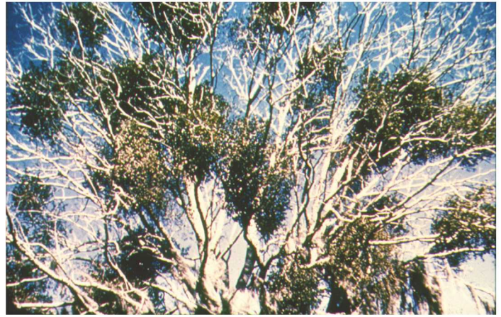
Multiple infections of true mistletoe.

Control of true mistletoe depends on physical removal of the aerial shoots from the host plant by pruning infected branches or by periodic removal of the shoots. Breaking