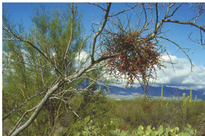
True mistletoe aerial shoots with berries.