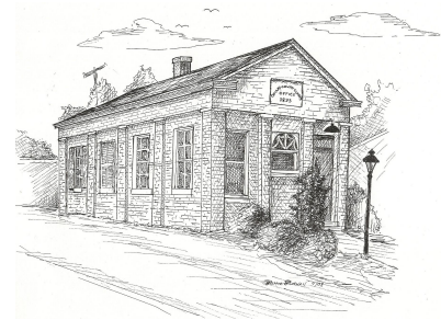
Artwork by Pattie Purnell

ceed westbound 4.6 miles, turn right at the first traffic signal (Bullittsville-Burlington Road aka Garrard St.); turn left into the Boone County Administration Building parking lot. The Museum is the small white brick building marked "County Court Clerk's Office...1853" The street address is 2965 Gallatin Street, Burlington, KY 41005.