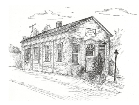
Artwork by Pattie Purnell

Burlington Road aka Garrard St.); turn left into the Boone County Administration Building parking lot. The Museum is the small white brick building marked "County Court Clerk's Office...1853" The street address is 2965 Gallatin Street, Burlington, KY 41005.