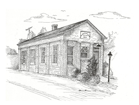
Artwork by Pattie Purnell

Burlington Road aka Garrard St.); turn left into the Boone County Administration Building parking lot. The Museum is the small white brick building marked "County Court Clerk's Office...1853" The street address is 2965 Gallatin Street, Burlington, KY 41005.