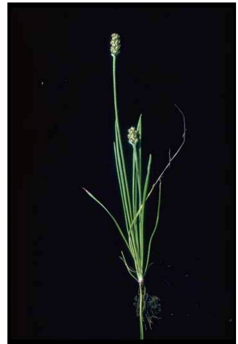
California plantain ( Plantago erecta ).