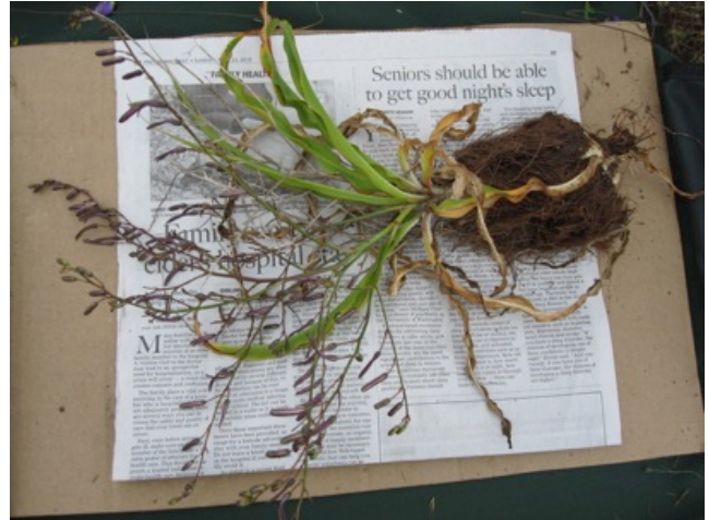
Chlorogalum pomeridianum var. divaricatum . Marin County, June 2, 2010.