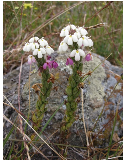
Triphysaria eriantha subsp. rosea at Jenner Headlands.