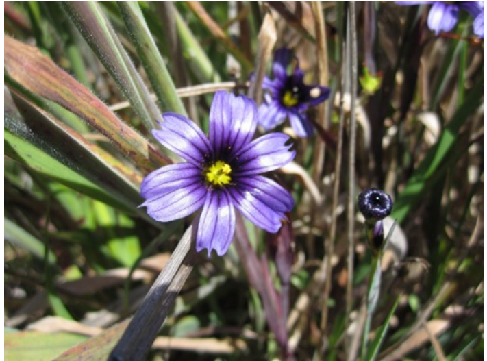
Sisyrinchium bellum S. Watson. Photo by D.(Immel) Jeffery, 2010.

Blue-eyed grass is a perennial monocot with starry six-petal deep bluish purple to pale blue flowers with yellow centers.