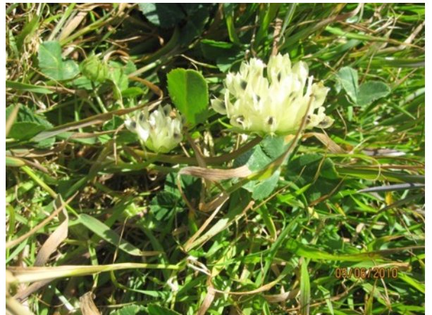
Bull clover ( Trifolium fucatum ) at Bodega Marine Reserve. Photo by D.(Immel) Jeffery, 2010.