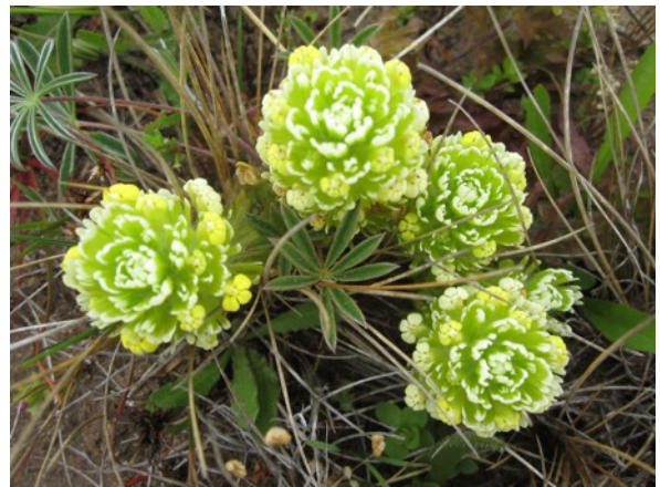
Castilleja ambigua subsp. ambigua at Point Reyes National Seashore July 22, 2010.