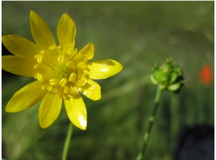
California buttercup flower and developing seed head at Ridgecrest in Marin County.