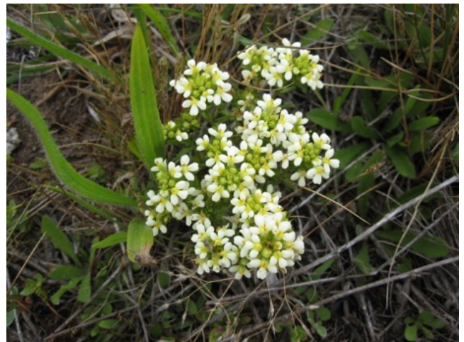
San Francisco owl's clover ( Triphysaria floribunda ) at Point Reyes National Seashore. Photo by D (Immel) Jeffery, 22 July 2010.

San Francisco owl’s clover is an annual forb that has creamy white flowers petals. The lower lip of Triphysaria (Greek for “three bladders”) flowers is divided into three pouches.