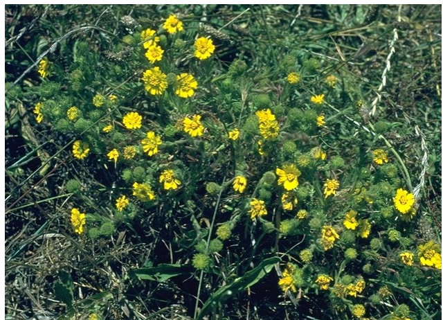
Deinandra corymbosa ( Hemizonia corymbosa) at Point Reyes, Marin County June 18, 1981.