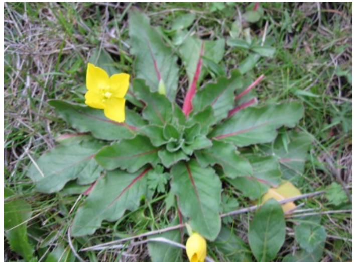
Taraxia ovata at Point Reyes National Seashore 15 Feb 2011.