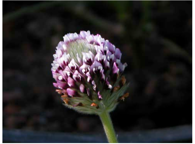
Showy Indian clover flower head. Photo by D.(Immel) Jeffery, 2004.