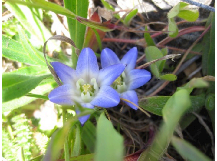
Brodiaea terrestris ssp. terrestris growing with Trifolium sp. and Leontodon taraxacoides at Sonoma Coast State Beach. 2010 May 10.

Dwarf brodiaea is a perennial herb with bell-shaped flowers consisting of six showy blue-violet petals. Dwarf brodiaea flowers are on a very short stalk (called a scape).