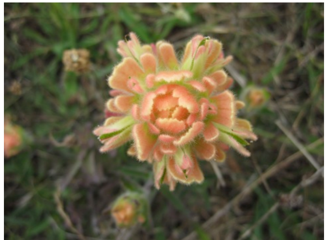
Castilleja sp. at Point Reyes Kehoe Beach area. July 22, 2010.