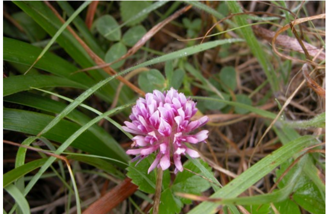
Cow clover ( Trifolium wormskioldii ) growing with Douglas' iris and wild strawberry in coastal prairie at Point Reyes National Seashore.