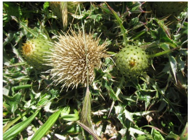
Brownie thistle at Sonoma Coast State Beach 2010 May 11.

Brownie thistle is a native perennial with long rhizome-like runner roots. Brownie thistle grows in low mounds with flowers on very short stems (Howell, et al. 2007).