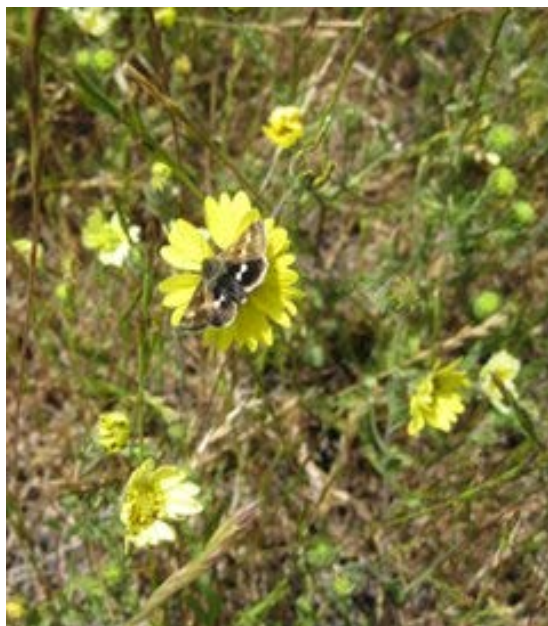
A skipper sipping visiting a Hemizonia congesta ssp. lutescens flower at Jenner Headlands. Photo by D. (Immel) Jeffery, 25 June 2010.