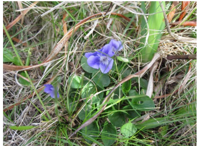
Western dog violet ( Viola adunca ). in Deschampsia cespitosa prairie at Point Reyes National Seashore, 2011 Feb 3.

Western dog violet is a perennial wildflower with short aboveground stems arising from thin branched rhizomes (underground stems) (Hickman 1993).