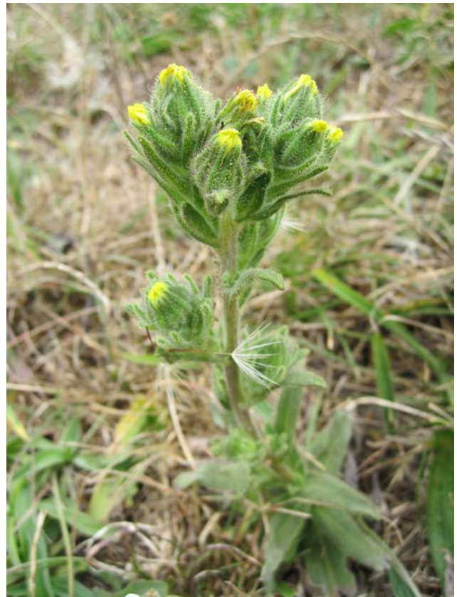
Madia sativa at Point Reyes National Seashore. July 2010.