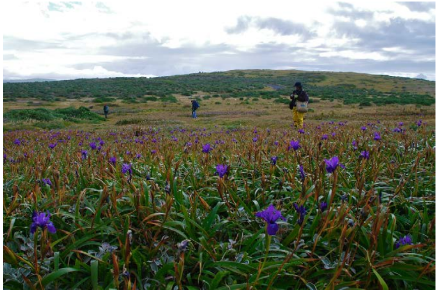
Iris douglasiana in coastal prairie near Bodega.