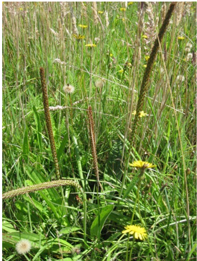
Tall coastal plantain ( Plantago subnuda ) with Leontodon taraxacoides at Point Reyes National Seashore 2010 July 29.