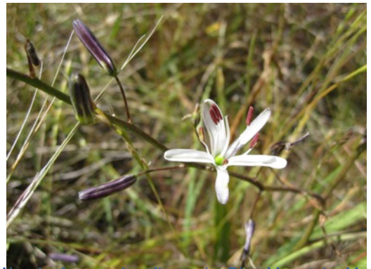
Wavyleaf soap plant flower (at King Mountain, Marin County). The flowers have 3 white petals and 3 white sepals (one petal is hidden within the top sepal in this photo). Photo by D. (Immel) Jeffery, June 12, 2010.

Soap plant is a geophytic perennial monocot. Panicles of white flowers bloom from May to August (Flora of North America Editorial Committee eds. 1993).