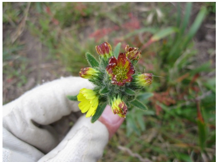
Madia sativa inflorescence at Point Reyes National Seashore near Kehoe Ranch. Photo by D.(Immel) Jeffery, July 2010.