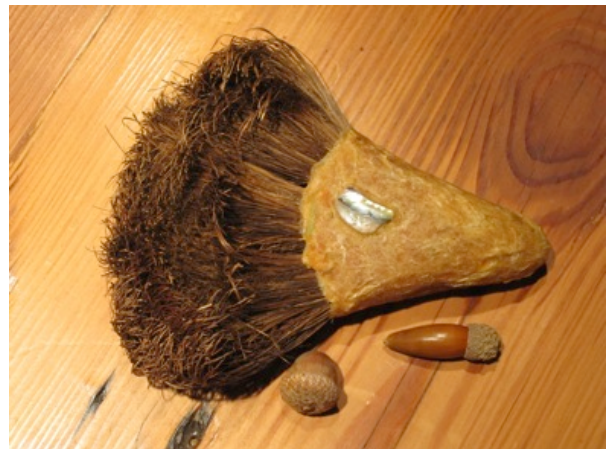
Brush made from wavyleaf soap plant by Yokut basketweaver, Lois Conner. Fibers are from the bulb covering. The handle is covered with a paste made from the baked pulp of the bulb.