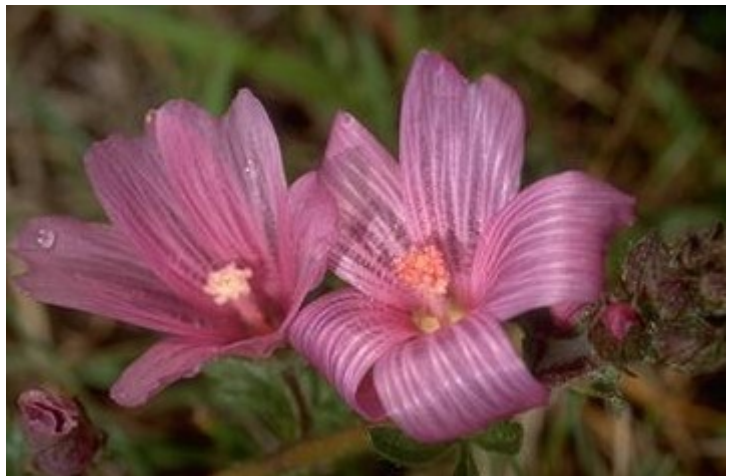
California checkerbloom at Salt Point State Park (Sonoma County, California, US).