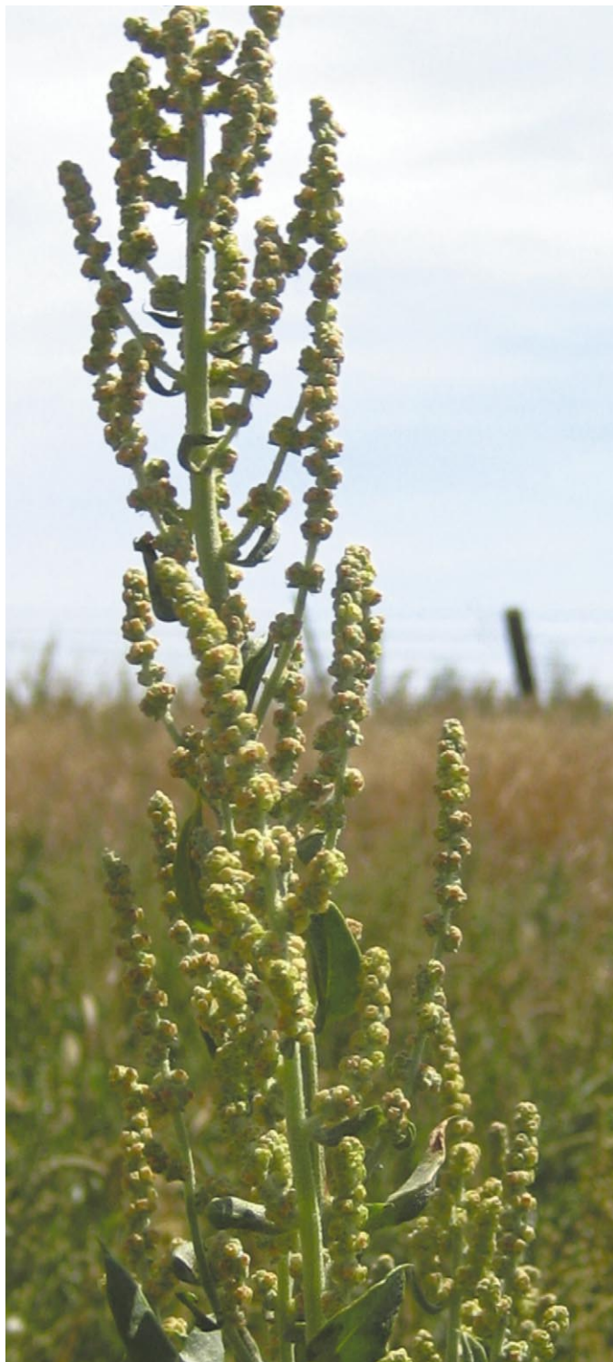
San Joaquin spearscale ( Atriplex joaquiniana).