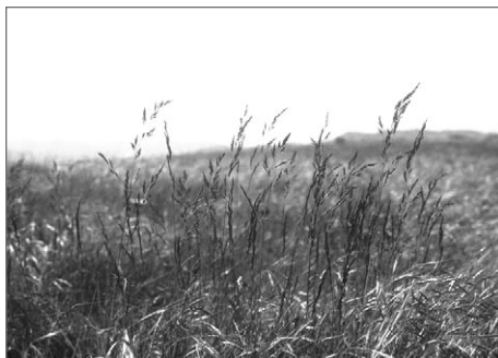
Festuca rubra , Pt. Molate coastal prairie (Spring 1983).

California Oatgrass, Danthonia californica (including its var. americana , a more pilose version), is widespread below 8,000 ft. Particularly prominent in the Coast Ranges, among our native bunchgrasses it is perhaps the most tolerant of overgrazing (by definition a condition in which livestock are left too long on a given site, with the result that native plant biodiversity declines or is kept at a significantly depressed level). It develops very low forms in overgrazed areas. These stay low in the garden, whether "managed" or not. I have often wished to type-convert a lawn to Danthonia californica . The grass has voluminous roots and takes trampling well. Unfortunately it is slow to germinate, and amassing enough for a lawn requires an extended nursery preamble. California Oatgrass is easy to recognize because its spikelets vaguely resemble those of a ubiquitous exotic trash-grass: wild oats, Avena ssp.; and because its culms fall