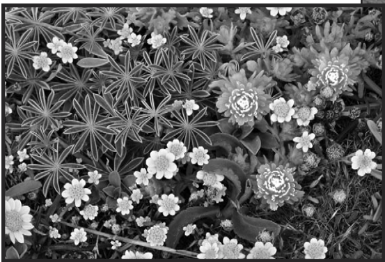
Photo 1 (above) Lupinus sp. and Lasthenia californica near Bodega Marine Lab.