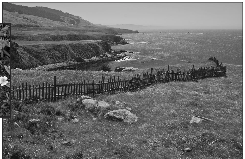
Photo 2 (right) Coastal Prairie near Fort Ross.