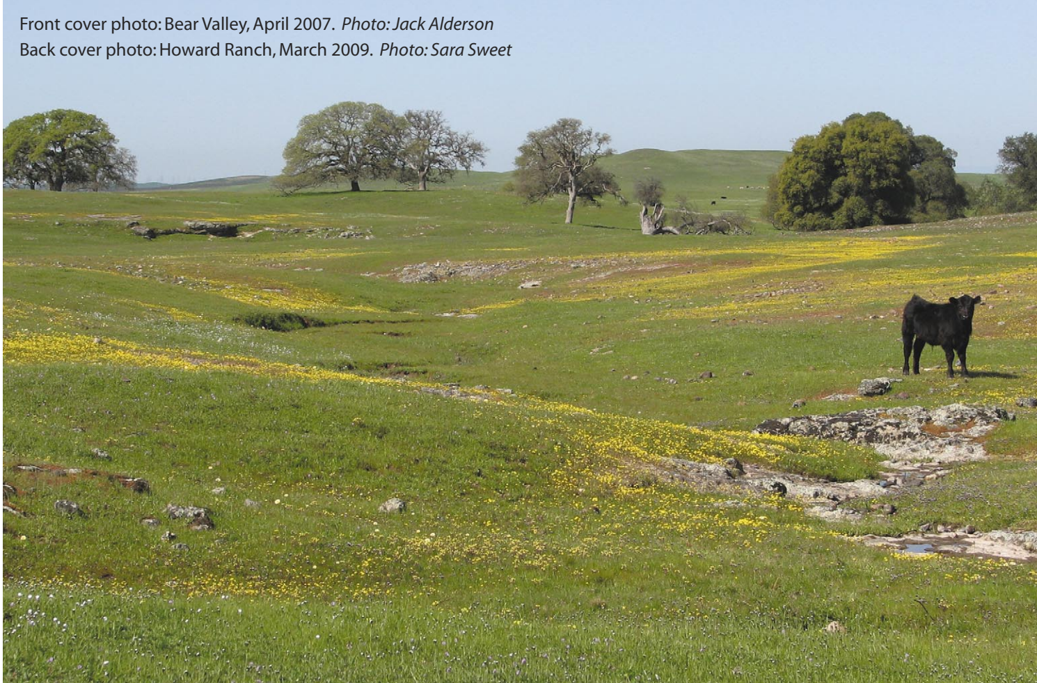
Front cover photo: Bear Valley, April 2007. Back cover photo: Howard Ranch, March 2009.

Register now for Spring & Summer Workshops! see pages 9-10