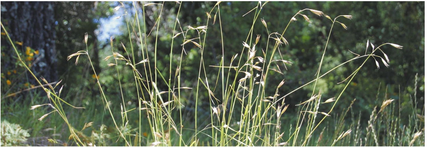
California oatgrass ( Danthonia californica), Pepperwood Preserve near Santa Rosa.