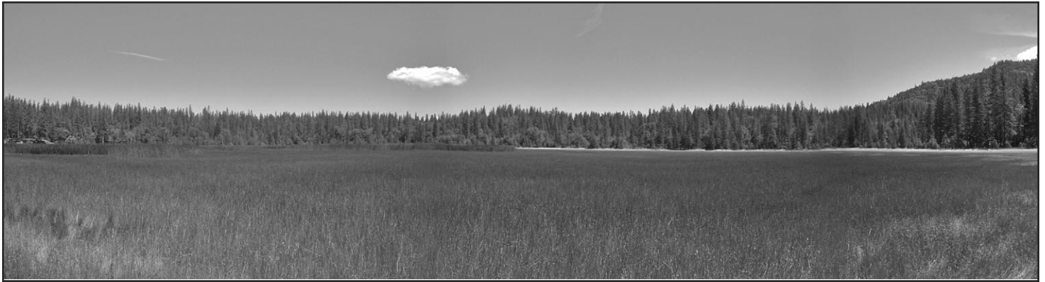
Boggs Lake Ecological Reserve (see May 6 field trip below).