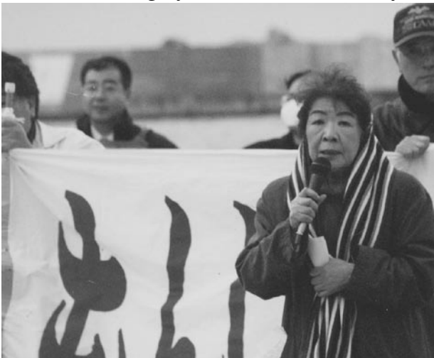
Picture :Author gave a keynote address at the national gathering.

Now the overwhelming attitude of the local citizenry towards Monju is, "The High Court has made a weighty decision, so obviously the