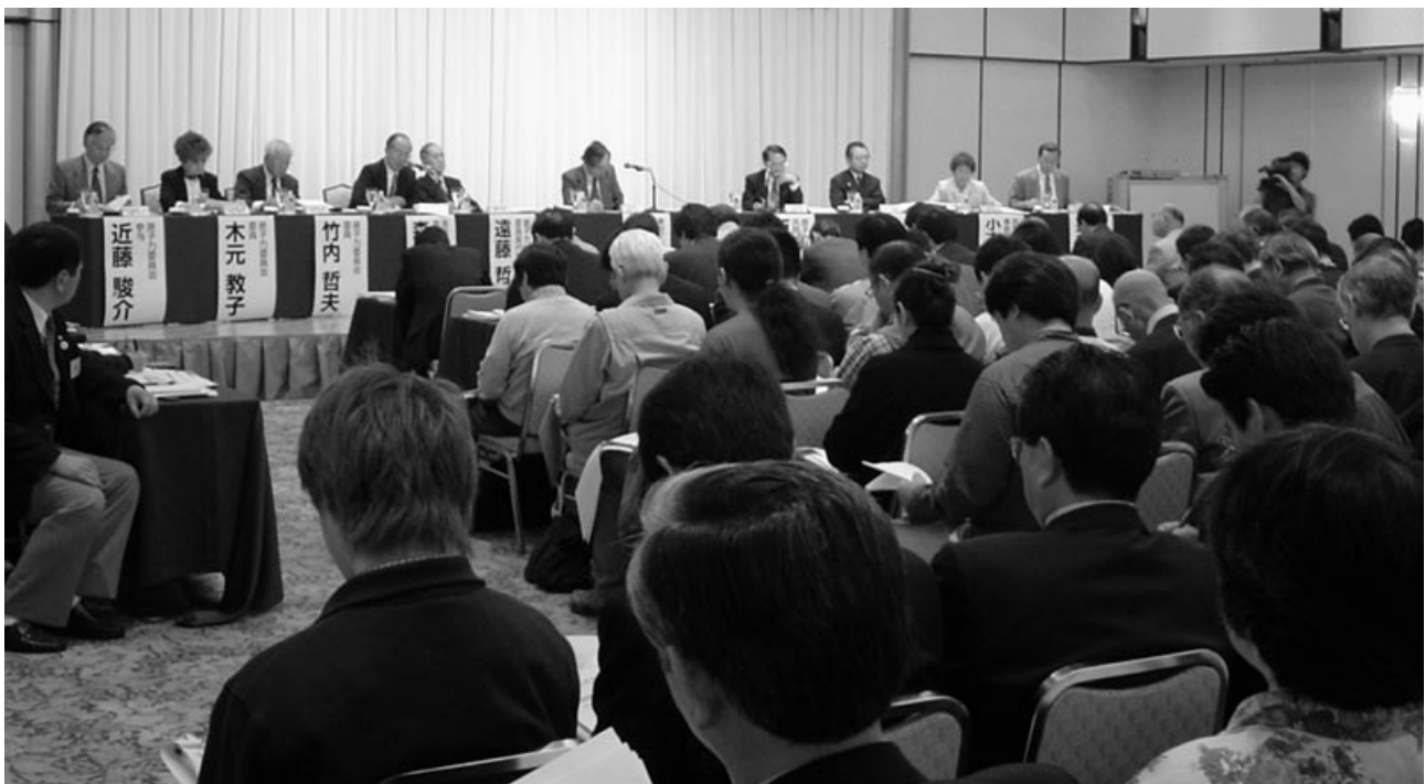
Participants at the "Open Debate: Rethinking Reprocessing and the Nuclear Fuel Cycle" held in Aomori on October 11th.