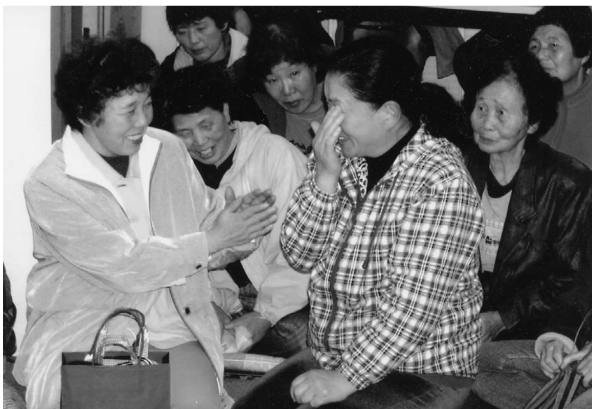
The joy of the citizens of Suzu on hearing that the Suzu Nuclear Power Plant plan had been cancelled

O n Dec. 24th, 2003, Tohoku Electric Power Company officially announced that it was abandoning its plan to build the Maki Nuclear Power Plant in Maki Town, Niigata Prefecture. According to the company the proposal for the construction dates back 32 years, but if one counts from the time when, in order to disguise its plan to build a nuclear power plant, the company bought land under the pretense of building a health resort, the project is actually 40 years old. However, in the end the resolute resistance of the local people against the nuclear power plant prevailed.