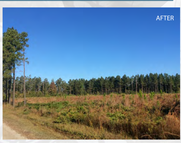
In late October, a crew working at the Brunswick Nature Park hand cut the loblolly and hardwood regrowth in the longleaf restoration area. Loblolly and hardwood compete with the longleaf seedling. Next on the agenda is a prescribed burn out at the site to clear out small trees and brush to open up the forest floor. Shown are the before and after photos.