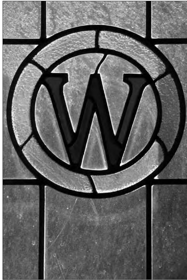
Stained glass "W" emblem window at the University Club