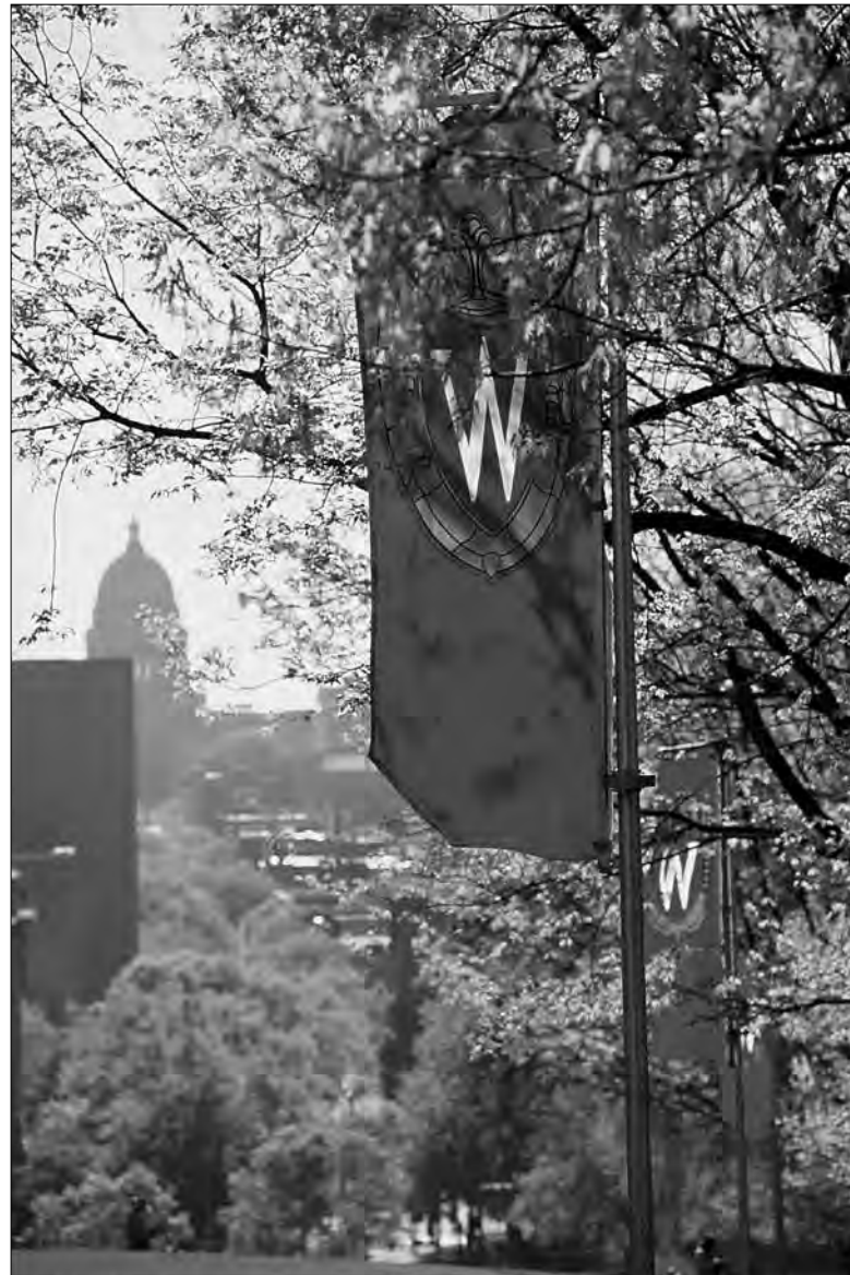
Banners on Bascom Hill