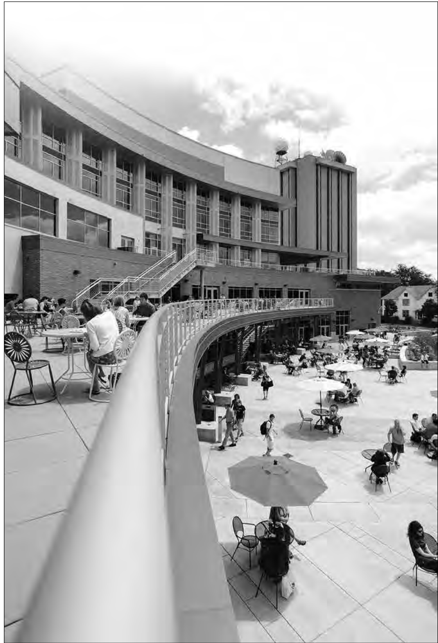
The Plaza at Union South