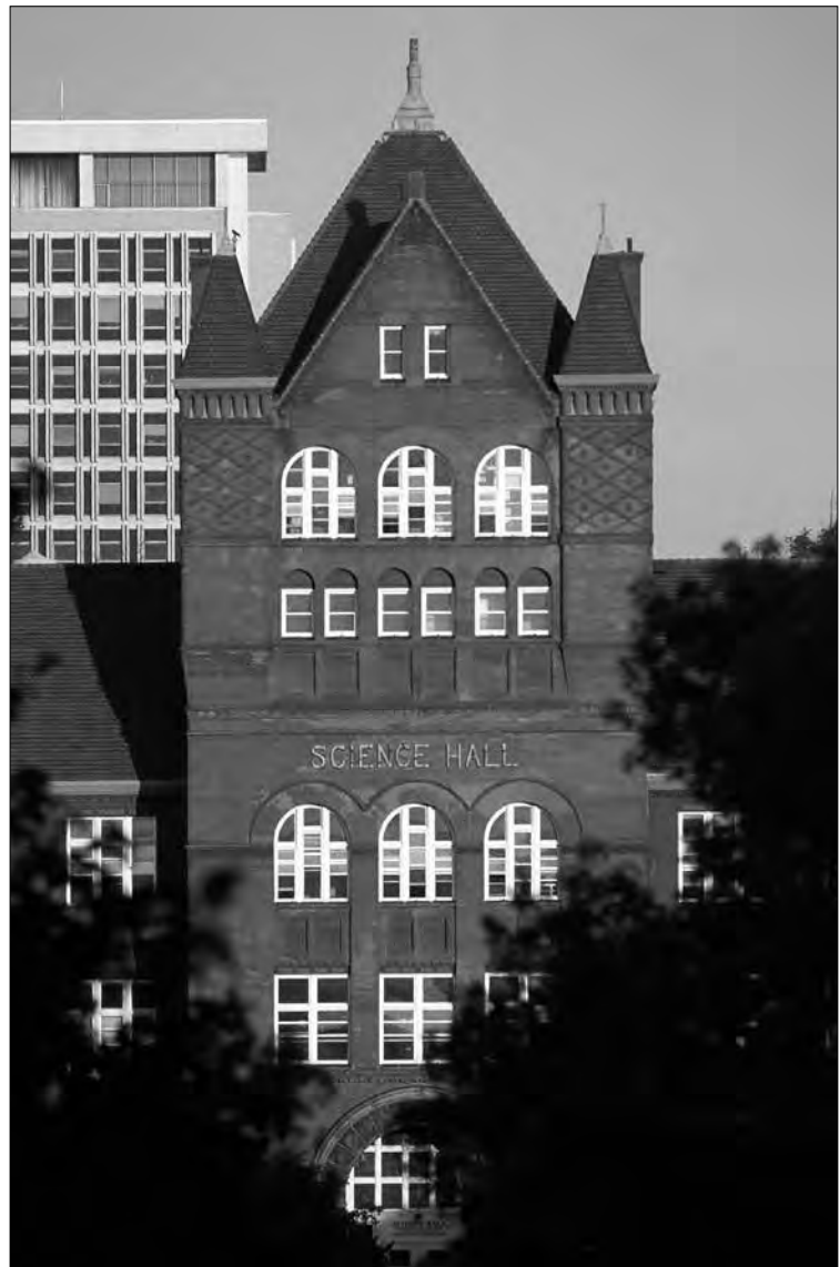
Telephoto lens view of Science Hall with Van Hise Hall in the background