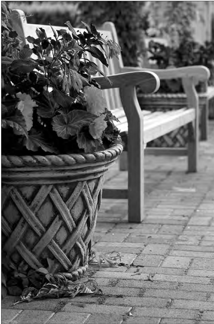
Allen Centennial Gardens