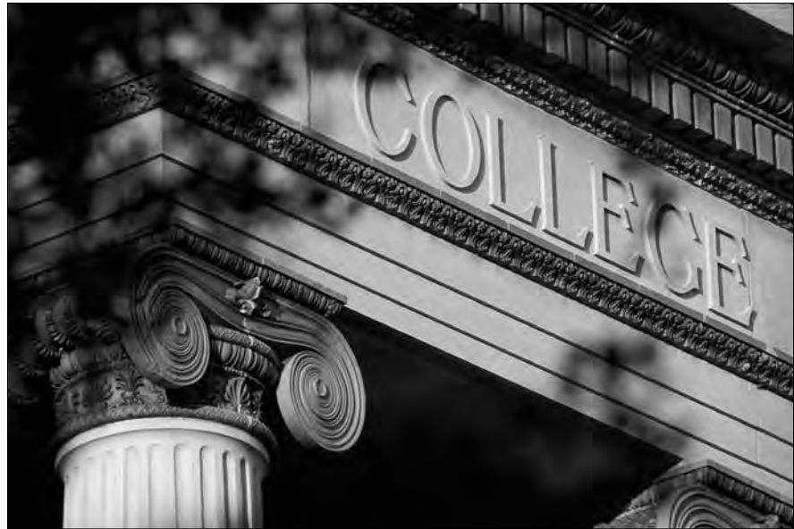
Architectural detail on Agricultural Hall portico