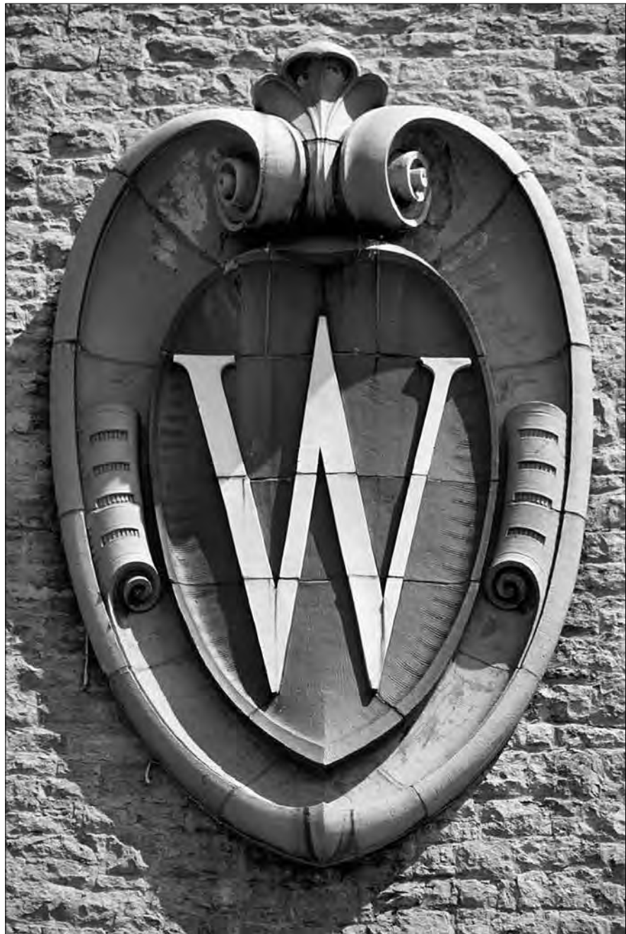
Architectural detail, UW Field House