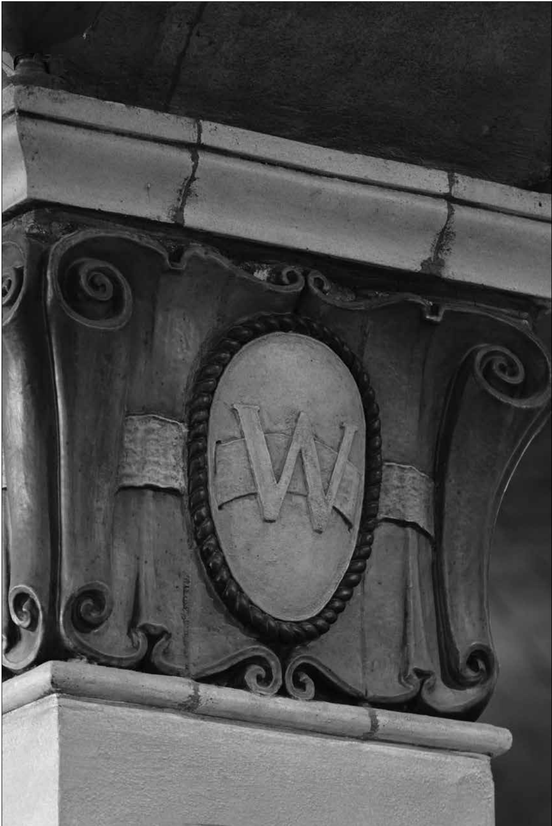
A column in the Rathskeller at the Memorial Union