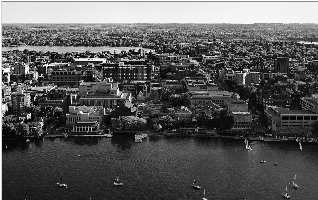
Lake Mendota shoreline

We are motivated by the “Wisconsin Idea”—articulated a century ago as the principle that the university’s influence should benefit everyone in the state. Today, this principle has expanded to a global scale. The Wisconsin Idea continues to permeate everything we do, helping to forge close partnerships between faculty, staff, and students, and people, communities, and industries around the world.