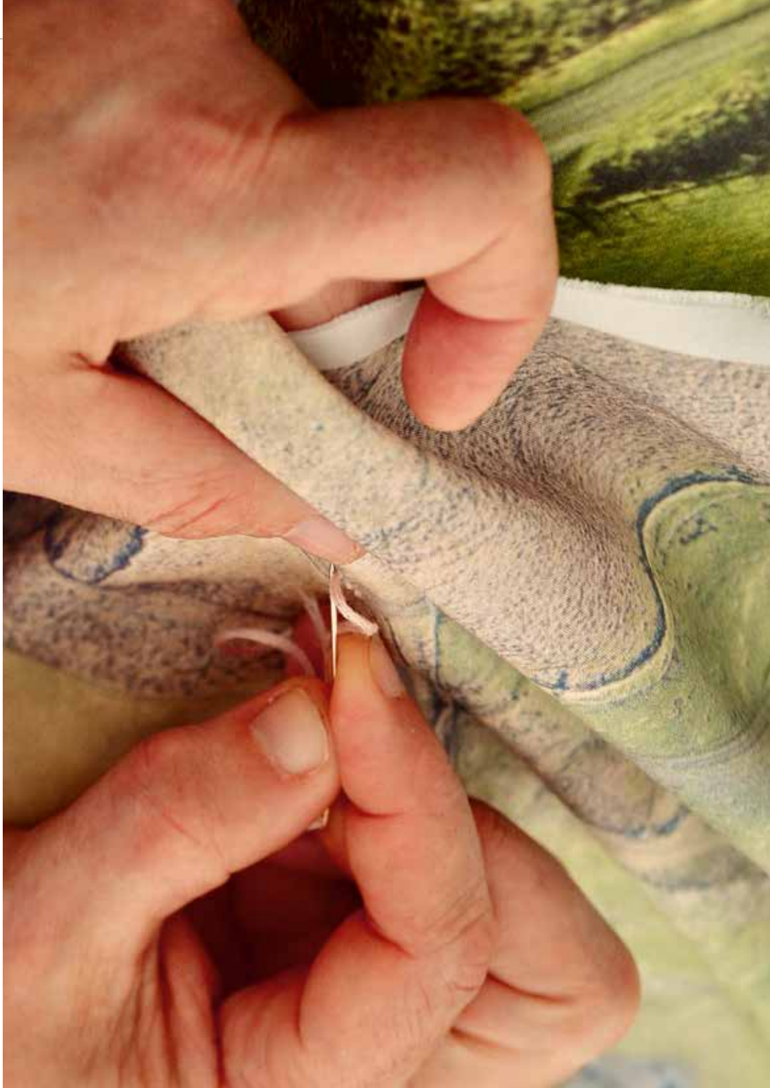
Overleaf left: Digitally printed cushion cover with stitching of the shores of Loch Clunie and the island within it which feature a number of archaeological sites of interest, photo Clare Cooper Overleaf right: Bunting made by children from Isla Primary School, photo Clare Cooper