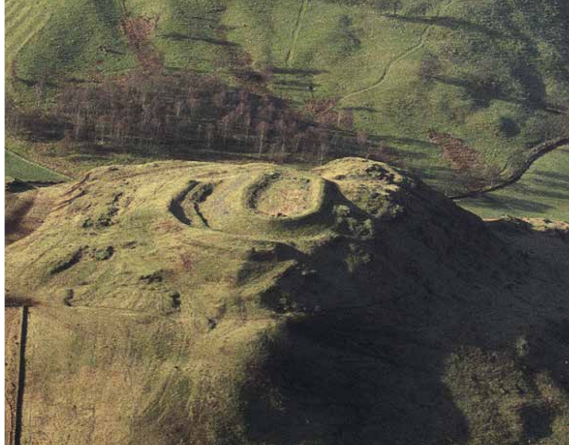
Above: The fort which crowns Barry Hill overlooks the mouth of Glen Isla and commands an extensive view across Strathmore. Barry Hill is impressive for the sheer scale of its defences which are both complex and multi-period, photo © Perth & Kinross Heritage Trust

Royal Commission on the Ancient and Historical Monuments of Scotland [RCAHMS] (1990) North-East Perth: An Archaeological Landscape . London: HMSO.