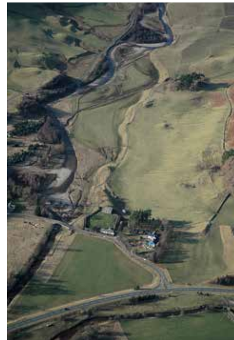
Left: Major Caulfeild's Bridge over the Shee Water at Spittal of Glenshee. In the field to the right of the present church, the rectangular outline of the 18th-century chapel, contemporary with the bridge, can be observed. The long lines of rig and furrow cultivation can also be appreciated within the same field in this image, photo © Perth & Kinross Heritage Trust