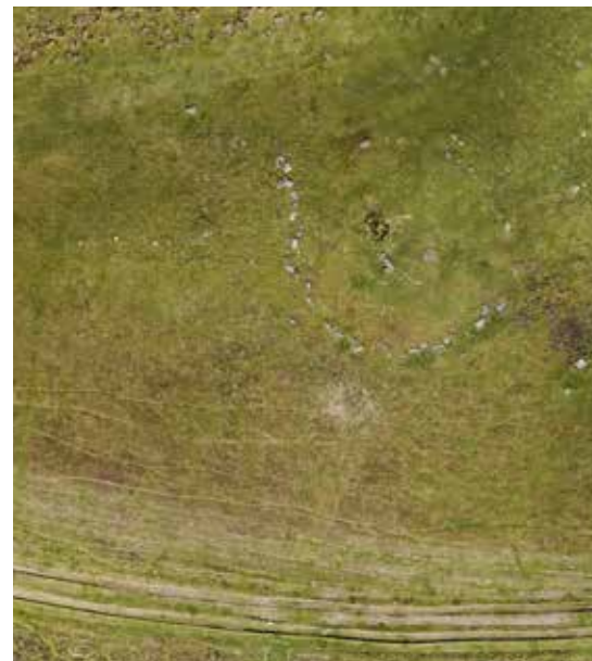
Above: The remains of a substantial prehistoric burial cairn are situated on a low knoll in the saddle between the Hill of Kingseat and Saebeg hill. The cairn is roughly circular, measuring 19m in diameter with at least sixty visible kerbstones, photo © Perth & Kinross Heritage Trust