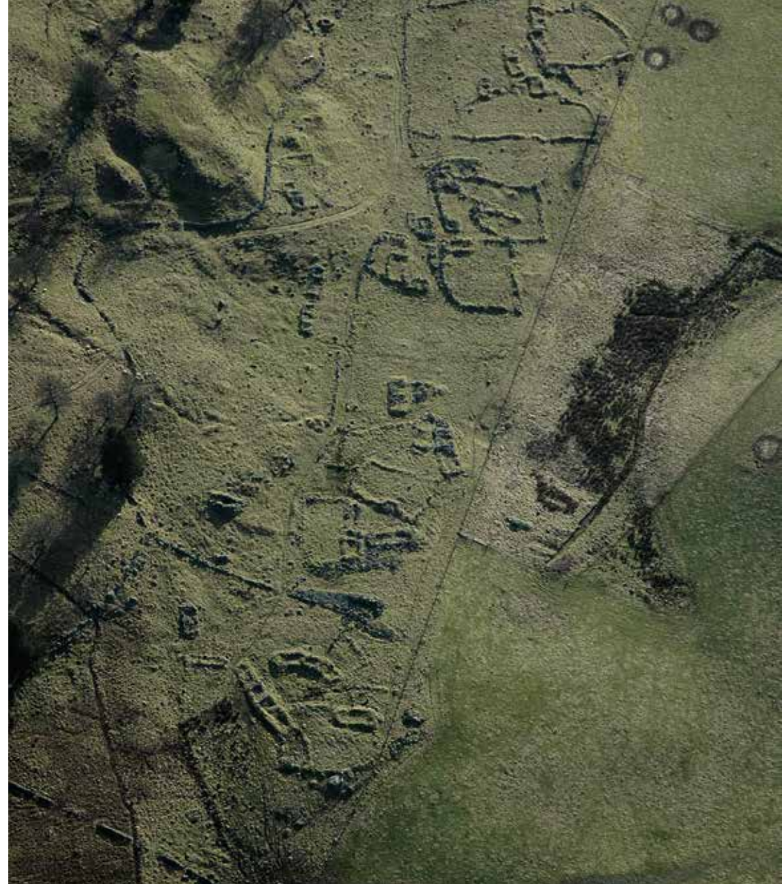
Above: Easter Bleaton is an exceptionally well preserved example of a linear post-medieval fermtoun settlement. The stone footing remains of at least fifty-two buildings together with a series of enclosures and four corn drying kilns can still be seen. From the disposition of the buildings it is possible to suggest the presence of at least eight different farmsteads, perhaps reflecting the properties of individual tenants, photo © Perth & Kinross Heritage Trust

Royal Commission on the Ancient and Historical Monuments of Scotland [RCAHMS] (1990) North-East Perth: An Archaeological Landscape . London: HMSO.