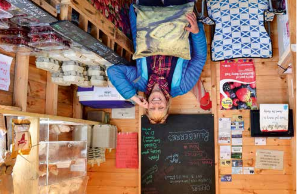
Above: Gifting one of the cushions to Marshalls Farm Shop