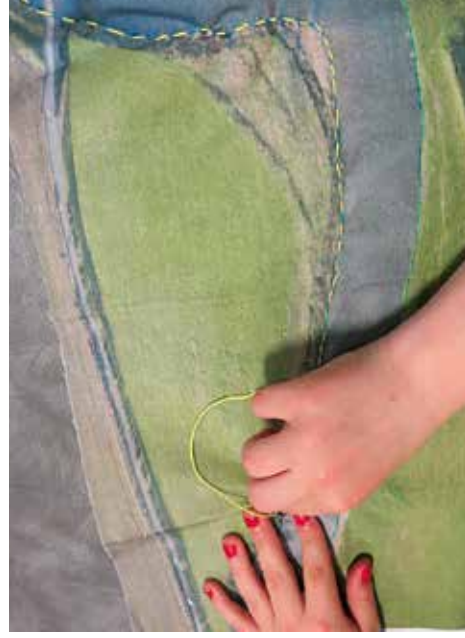
Left: Stitching the River Ercht, St Stephens Primary School