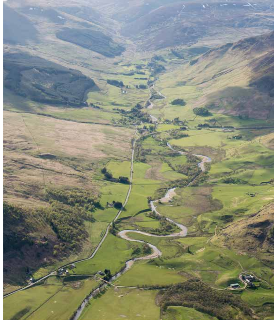
Above: Looking north-west through Glen Shee towards the village of Spittal of Glenshee with Dalmunzie House in the distance, photo © Perth & Kinross Heritage Trust

The Scottish cattle droving trade emerged out of this same poor climate where long winters and infertile soils meant a shortage of stored feed to sustain the large numbers of cattle produced through the feudal open common grazing system. The solution was for local men to visit surrounding farms, negotiate a price for small numbers of cattle and gather them together into large herds of 100-2,000 strong. The Drovers would head south and east, trading livestock at markets where demand and profits were higher. Through trade between Drovers, cattle from the Highlands could reach as far as York and London. The drove roads were long and the journey full of hazards, from fording fast flowing rivers to the threat of Cateran raids. In the middle of the 18 th Century, Kirkmichael's Michaelmas Fair was a major cattle market and drove roads connecting the village to Spittal of Glenshee and Ballinluig can still be walked today.