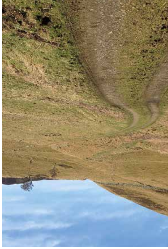
The Cateran Trail passes the site shortly after it leaves the Spittal of Glenshee