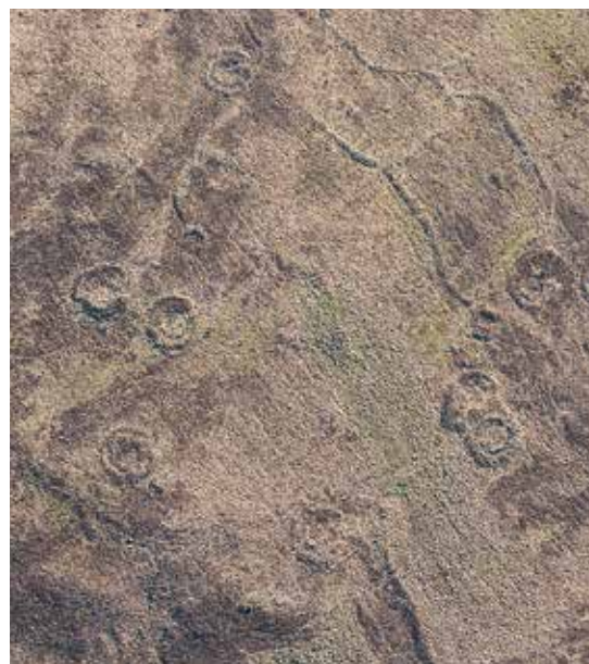
Left: This large group of roundhouses and cultivation remains extend across the south-west flank of Beddingrew, to the West of Drumturn Burn. At least twenty-two hut-circles and a platform can be identified.