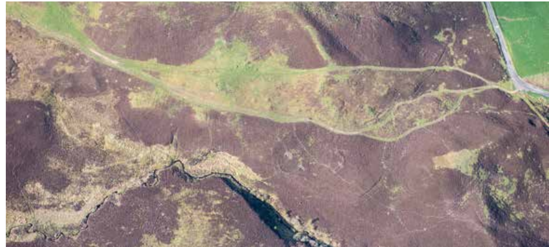
Top: This image was captured by a low-level small unmanned aircraft. It features Building #7 at Lair, Glen Shee, a medieval turf and stone longhouse, prior to its excavation as part of the Glenshee Archaeology Project in 2014