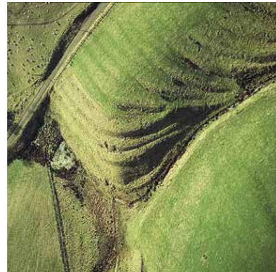
Left: Tullymurdoch

The aerial photos taken by Perth and Kinross Heritage Trust provide a vast visual and textural resource for visual art and design and will inspire many local artists over time. Originally we had discussed a Cateran Cloth using the images as inspiration but on exploring the idea of Commons further, cloth or multiple cloths which were accessible to many local people seemed more appropriate. In thinking more about community and commons it was important that the project reached out as far as possible into the communities around the Trail. Each group decided who they would like to make textiles for, and what they would make. The groups made cushions, a banner, a window blind and bunting which will be placed in local care homes local shops, a new school and an outdoor centre.