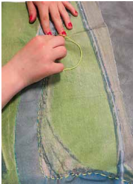
Left: Stitching the River Erich, St Stephens Primary School