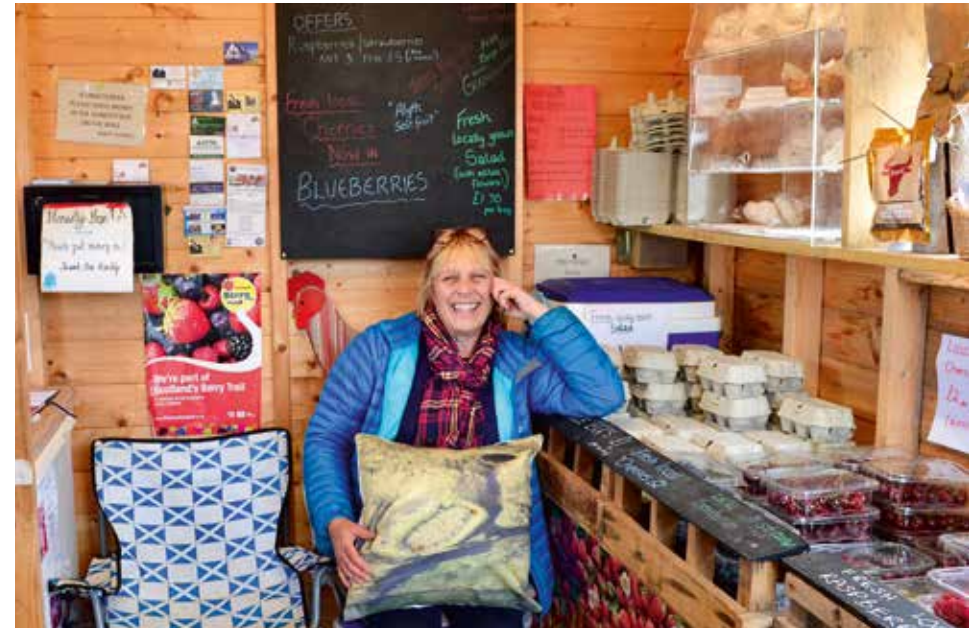
Left: Stitching the Trail at the Alyth & District Agricultural Show