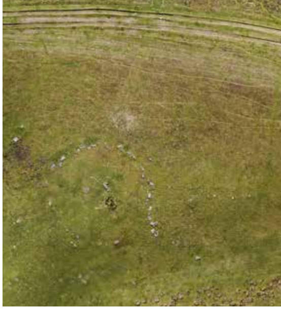
Above: The remains of a substantial prehistoric burial cairn are situated on a low knoll in the saddle between the Hill of Kingseat and Saebeg hill. The cairn is roughly circular, measuring 19m in diameter with at least sixty visible kerbstones, photo © Perth & Kinross Heritage Trust

Barclay, G. (1998) Farmers, Temples and Tombs: Scotland in the Neolithic and Early Bronze Age . Edinburgh: Canongate Books Ltd. Royal Commission on the Ancient and Historical Monuments of Scotland [RCAHMS] (1990) North-East Perth: An Archaeological Landscape . London: HMSO