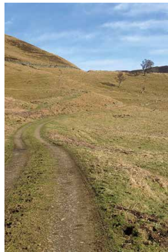
The path to Diarmuid's Grave

The many archaeological sites on the Cateran Trail provide interest for both walker and archaeologist and artist alike. Archaeological features in certain areas are more visible from the air than on the ground. Differences in ground surfaces caused by buried features can be viewed from the air and varying ground levels, soil, colour and texture provide not only information on new archaeological sites but both exciting colour and visual inspiration for creative activity for the many artists living around the Cateran Trail.