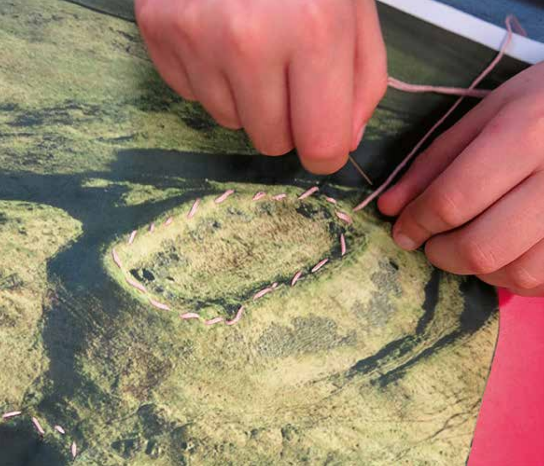
Stitching Barry Hill Fort, Kirkmichael Primary School

The fort which crowns Barry Hill overlooks the mouth of Glen Isla and commands an extensive view across Strathmore. Barry Hill is impressive for the sheer scale of its defences which are both complex and multi-period.