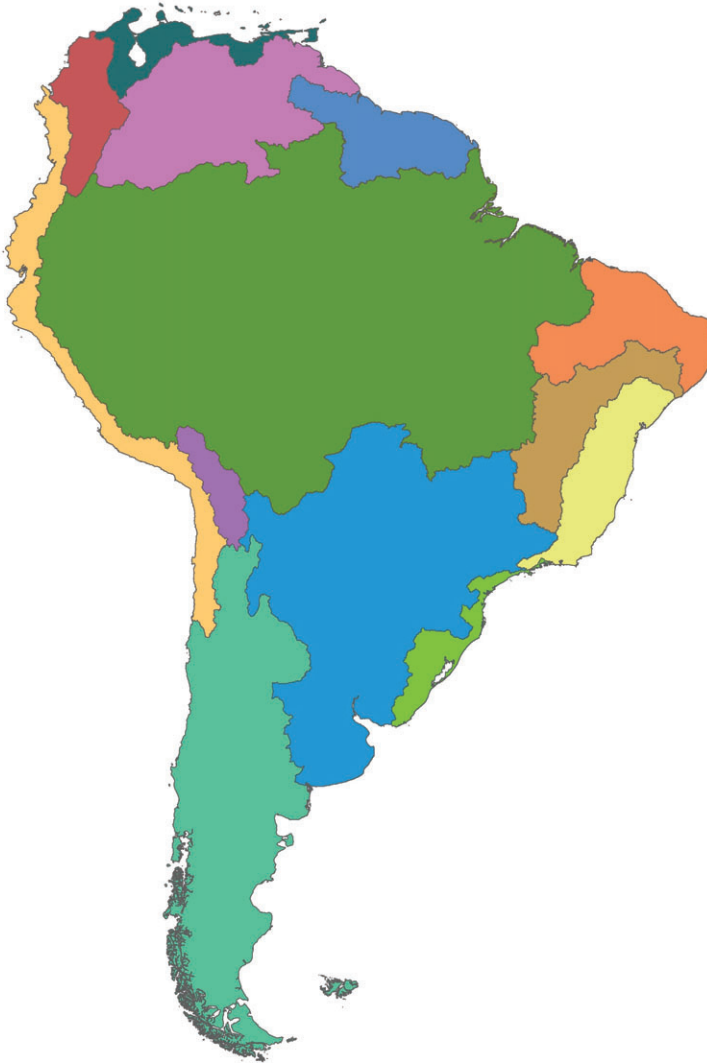
FIG. 3. Major river basins and basin complexes of South America. ■, Amazon; ■, East Atlantic; ■, Guianas; ■, Magdalena; ■, Maracaibo-Caribbean; ■, North-east Atlantic; ■, North-west Pacific; ■, Orinoco; ■, Parana-Paraguay; ■, South-east Atlantic; ■, Southern Cone; ■, São Francisco; ■, Titicaca.

Basin is dominated by several groups of ostariophysans and cichlids. Several other fish groups are also emblematic for the basin. The freshwater stingrays are not restricted to the Amazon, but their greatest diversity occurs there. The Amazon and Paraguay basins share the only South American sarcopterygian (lobed-fin) fish, the lungfish Lepidosiren paradoxa Fitzinger 1837, locally called pirambóia. Also very important, both evolutionarily and economically, is the pirarucu Arapaima gigas (Schinz 1822), the largest freshwater fish in South America. Along with the pirarucu, two species of aruanã ( Osteoglossum spp.) represent the primitive order Osteoglossiformes in the