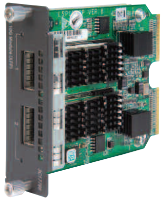
Switch 4500G 2-Port 10 Gigabit Module (XFP) (3C17766)