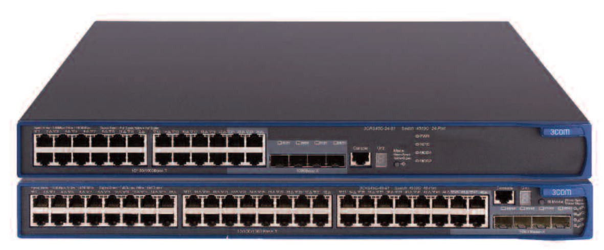
From top: 3Com Switch 4510G 24-Port, Switch 4500G 48-Port.

Self-paced and instructor-led technology and product courses, plus certification programs