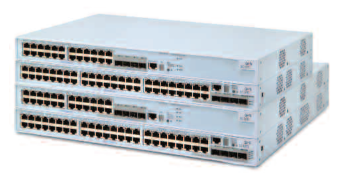
From top: 3Com Switch 4500G 24-Port, Switch 4500G 48-Port, Switch 4500G PWR 24-Port, Switch 4500G PWR 48-Port (Switch 4510G models not shown).