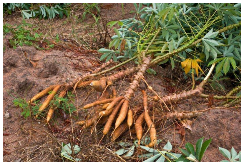
Figure 4. Harvested cassava plant, showing roots

treating them as a perennial crop, and thereby storing food underground (Byrne, 1984; Nassar and Ortiz, 2006; Sardos et al., 2008). Some farmers may harvest only a few roots from a plant, covering the remaining roots with soil for future harvesting. However, with increasing age and unfavourable conditions, such as moisture stress, storage roots become lignified and less desirable for consumption, and the plants become more susceptible to lodging and rot (Lebot, 2009).