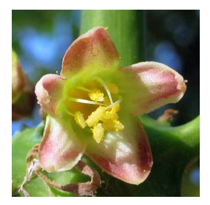
b) Male flower