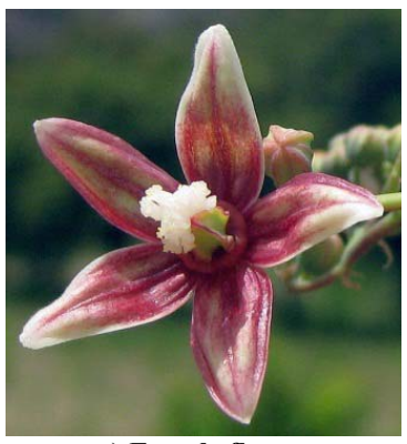
Figure 5. Cassava female and male flowers