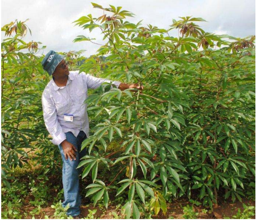
Figure 1. Cassava growing in Nigeria

10. HCN is released through the hydrolysis of two cyanogenic glycosides, primarily linamarin, with lower levels of lotaustralin, and hydrolysis is initiated by physical disruption of plant tissues. Linamarin is hydrolysed by linamarase to release HCN. Linamarin is contained in the vacuoles of intact plant cells, while linamarase is located in the cell walls. Tissue disruption allows the two compounds to react (Alves, 2002).