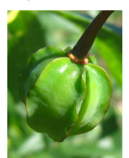
Figure 6. Fruit of cassava

46. The fruit of cassava (Figure 6) is a tricarpellary capsule, and each locule contains one ovule; however, it is common for capsules to contain fewer than 3 seeds (Kawano, 1980). The fruit reaches maturity two to three months after pollination, and the fruit dehisces explosively, although seed typically falls to the ground near the mother plant (Alves, 2002).