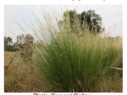
Seed has an awn, but no corona. When mowed, tufts often feel sharp and spiky when a hand is placed on them.