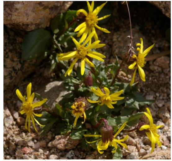
Ligularia holmii

We also documented Selaginella densa , a clubmoss, which had never been collected before. It seems rather strange that this plant had never been collected at Mount Evans, since it is common in the alpine.