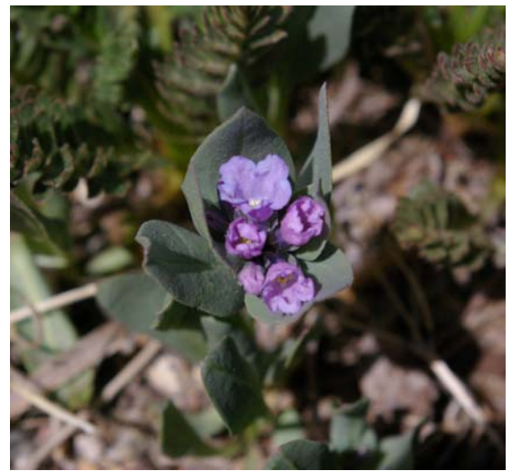
Mertensia lanceolata

previously documented Summit Lake flowering plants. Among these were five rare species including Delwiensia pattersonii (G3G4S3), Draba fladnizensis var. pattersonii (G4 S2S3), Mertensia alpina (G4S1), Alsinanthe stricta ,(G5S1) and Alsinanthe macrantha , (G3?S3?).