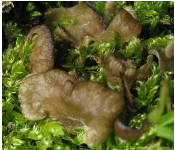
Arrhenia lobata

Linnea Gillman, a volunteer from the Denver Botanic Gardens is now the first person to ever collect mushrooms at Summit Lake. She collected seven species, four of which have been identified including the species Arrhenia lobata , pictured below.