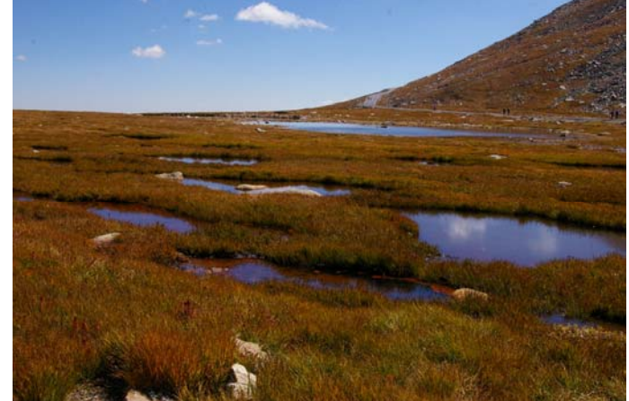
Peat Fen on Terminal Glacial Moraine

Summit Lake Park is located in a glacial cirque with a huge, gently sloping terminal glacial moraine that fans out to the northeast toward Denver. If you stand just below the Mount Evans Road which traverses the park, the glacial moraine is so flat that it seems to slope <u>up</u> to a ridge below the park. Because of the flatness of