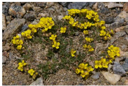
Draba grayana (G2 S2)

Because of the extensive wetlands and because the park is located in a cirque, the park has many different aspects, slopes and hydrological regimes. This diversity results in a large number of very distinct plant communities. We identified and mapped 15 different plant communities, each with its own special suite of plants.