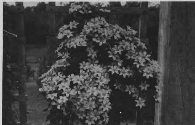
This clematis, 'Appleblossom,' is in full bloom. In the Arboretum, clematis are grown on poultry wire attached to wood trellises.

Some clematis have large flowers. Flowers of this 'Prins Hendrik' variety are often 10 inches in diameter.