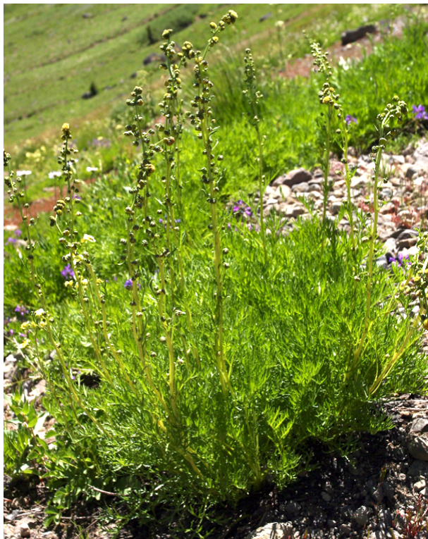
Figure 2. Artemisia norvegica ssp. saxatilis , Aug 12, 2006, Alpine County, California, US (Matson 2006)

Artemisia arctica Less. ssp. arctica is a terrestrial, herbaceous, perennial of the family Asteraceae , producing mildly fragrant and unassuming, drooping, yellow to slightly red, disk flowers and growing to a height of approximately 25- 40 cm (Hultén 1968; Shultz 2006) It is classified as a subshrub or hemicryptophyte, based upon Raunkiaer's life-forms classification system, due to its woody roots and herbaceous stems, which are green to reddish, smooth to slightly hairy (Hultén 1968; Beentje and Williamson 2016). Leaves are approximately 5-8 cm long by 2-3 cm wide, arranged in a circular configuration around the base of the plant, staggered on the upper stem and with smooth to slightly hairy leaf texture (Figures 1 and 2). Petioles are absent; thus, the leaves are sessile (Hultén 1968). Artemisia arctica ssp. arctica blooms in mid- to late summer (Shultz 2006, 2012). If allowed to spread freely in the landscape, it naturally forms clumps by vegetative reproduction via stolons and may also proliferate by wind dispersal via seed (Hultén 1968; Shultz 2006).