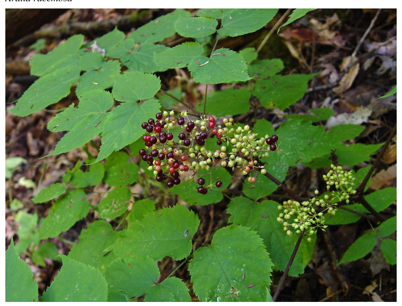
Figure 1. This is a picture of mature Aralia racemosa . Here we can see the ovary ripening to give an impressive display of pink to burgundy colored berries.