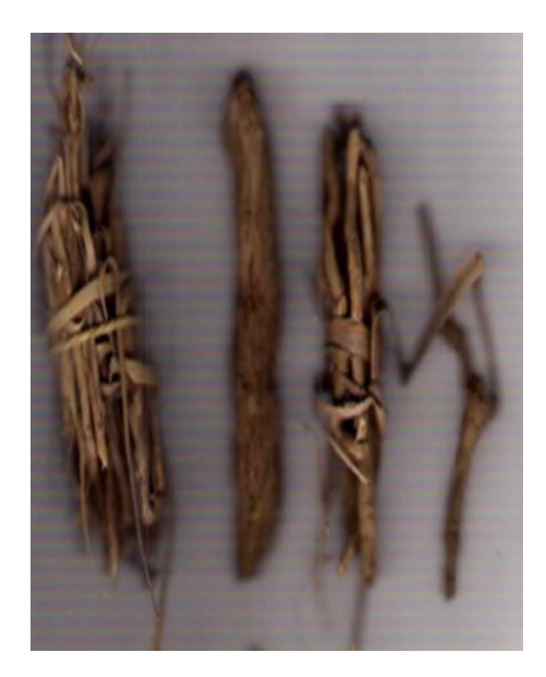
FIGURE 4. Aristolochia ringens root as it is sold on the market for medicinal purposes (Aigbe et al., 2019).

The Aristolochia genus has some specific growing requirements when it comes to germination. The plant is mainly seed propagated, although vegetative propagation could also be used. For seed germination, the seeds need to be soaked in warm water for 48 hours before sowing. The seeds need to be surface sown and then covered lightly with vermiculite, compost, or another similar material. The seeds should also be placed in a polyethylene bag to allow the seeds to germinate in darkness. Germination can take one to three months, or even longer if the growing requirements are not quite right ("Aristolochia ringens seeds (Gaping Dutchman's pipe seeds)"). The experiment that I am conducting with my seeds is planting half of them in darkness to germinate and half of them in light. Some of the articles that I have been reading say to cover them when seeding and then transplanting them away from direct sunlight. After germination, if my seeds germinate in time, I am going to grow the seeds germinating in the dark in the short-day light greenhouse, and the seeds germinating in light in the regular greenhouse. This will help to understand if A. ringens prefers light or dark growing conditions.