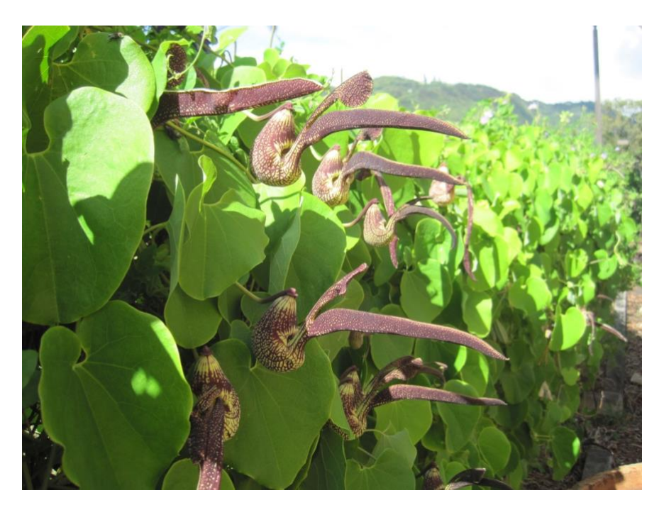
FIGURE 3. Aristolochia ringens plant including flowers and leaves ("Aristolochia ringens").

There is no known horticultural distribution chain in any of the literature. Seeds for the crop can be bought online, but the grower is not listed on any of the websites. The plant occurs naturally, so seeds must be taken from local plants to cultivate or the plant spreads in the wild.