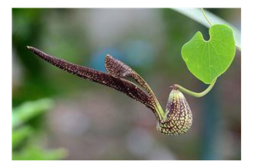
FIGURE 2. Closeup of Aristolochia ringens flower ("Aristolochia ringens (Dutchman's pipe)").