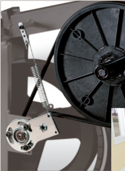
Quiet-Glide™ drive system

Many people read a magazine or watch television while working out on a piece of home fitness equipment. Additionally, they may work out in the early morning or late evening and do not want to disturb others. Vision Fitness is aware of this and, therefore, developed our Quiet-Glide™ drive technology, which utilizes a multi-ribbed supersilent Poly-V belt, to ensure an extra-quiet workout. The large eight-ribbed Poly-V belts on our 200 Series bikes give our products a competitive advantage. The larger surface area puts less tension on the belt, which results in a longer lifespan of not only the belt but the entire drive system. Computer modeling on this drive system shows the expected life to exceed 20,000 hours—that's over 50 years of life when used one hour a day!