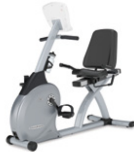
R2050 SEMI-RECUMBENT BIKE