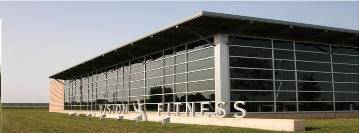
VISION FITNESS headquarters