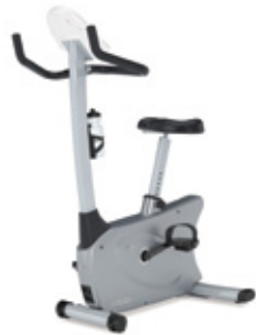
E1500 UPRIGHT BIKE