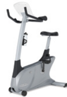
E3200 UPRIGHT BIKE

The R1500 and E1500 are our entry-level semi-recumbent and upright exercise bikes; however, they are still loaded with great features. They use an ECB magnetic resistance system with a 21-lb. flywheel and a supersilent Poly-V belt to create a durable drive system that offers smooth resistance changes. These models come standard with contact heart rate and are equipped with our Comfort Arc™ seats.