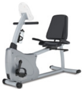
R1500 SEMI-RECUMBENT BIKE