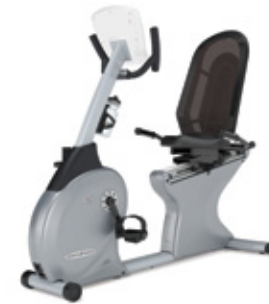
R2250 SEMI-RECUMBENT BIKE