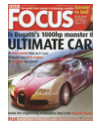
BBC Focus U.K. January 2006 E3200

“The step-through frame is just one of the comfort features on this body-friendly ride. Add the reclining seat, adjustable lumbar control, and 28 seat positions, and you might find yourself riding longer than you’d planned.”