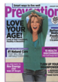
Prevention magazine January 2008 R2050

Try an award-winning Vision Fitness® bike at your local specialty fitness retailer. We are confident you will agree with the thousands of satisfied users and find our fitness bikes are the smoothest, quietest, and most comfortable you have ever ridden.