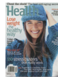
Health magazine January/February 2007 R2250

“The step-through frame is just one of the comfort features on this body-friendly ride. Add the reclining seat, adjustable lumbar control, and 28 seat positions, and you might find yourself riding longer than you’d planned.”