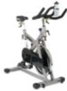
ES700 indoor cycle