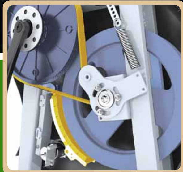
Friction-free magnetic resistance and large Poly-V belts make our bikes exceptionally smooth and quiet.

We build our bikes from the ground up and specify premium parts, such as sealed roller bearings, to ensure top quality. Vision Fitness will not cut corners, which is why we are the leader in the fitness bike industry.