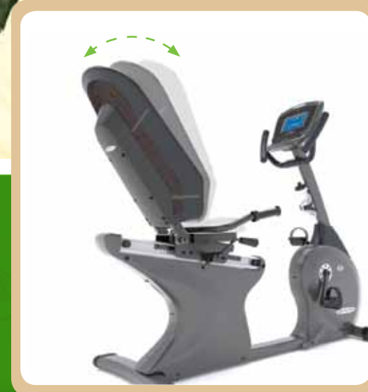
Comfort Arc™ mesh reclining seat (found on the R2250)

At Vision Fitness, we add features specifically to help you achieve your goals. A bike's seat is your primary contact point and, because of this, we have always set comfort of the seat as a top priority. Our Comfort Arc™ seats, with body-contoured foam and free range of motion, will have you smiling for miles. They are designed to fit the majority of the population and are considered the most comfortable in the fitness industry. Our upright seats have a cutout in the nose to reduce pressure on soft tissue areas.