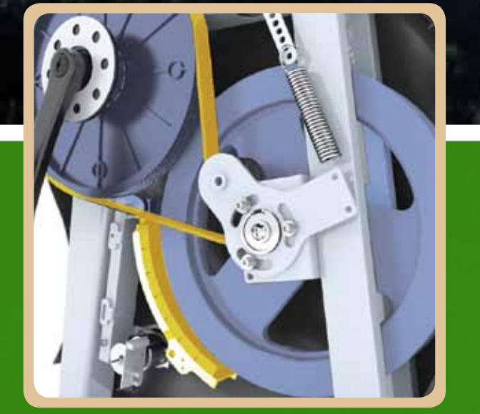
Friction-free magnetic resistance and large Poly-V belts make our bikes exceptionally smooth and quiet.

Vision Fitness® bikes provide years of maintenance-free performance without jarring or jerking, keeping your focus where it needs to be—on your goals. We pioneered the friction-free magnetic resistance system with no wearing parts for maximum performance and durability. Combine this system with our optimally-weighted flywheel, and you get the smoothest resistance system available. When the resistance level is changed on the console (even in the middle of a workout), the transitions are leader in the fitness bike industry. smooth, gradual, and fluid.