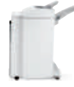
High Volume Finisher