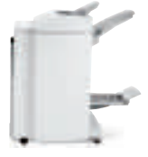
High Volume Finisher with Booklet Maker