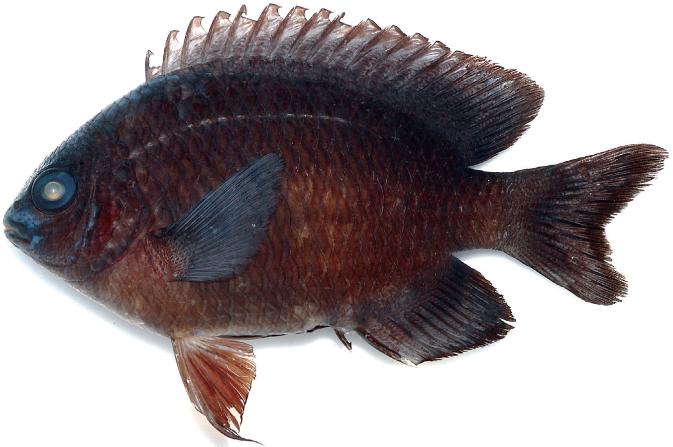
Figure 2. Pomacentrus bellipictus n. sp., preserved holotype, MZB 24596, 65.1 mm SL, Kokas District, West Papua Province, Indonesia (G.R. Allen).

Diagnosis. Dorsal-fin elements usually XIV (rarely XIII), 12–14 (usually XIV, 14); anal-fin elements II, 12–15 (usually 14–15); pectoral-fin rays 17–19 (rarely 19); tubed lateral-line scales 17–19 (usually 18); total gill rakers on first arch 18–20 (rarely 20); body depth 1.8–2.0 (mean 1.9) in SL; scales absent on preorbital and suborbital; lower margin of suborbital series with 4–12 serrae; color in life mainly dark brown, nearly black, with contrasting blue areas around mouth (including isthmus), below eye, and along margin of preopercle; iris of adult mostly dark gray with a narrow bronze ring around pupil.