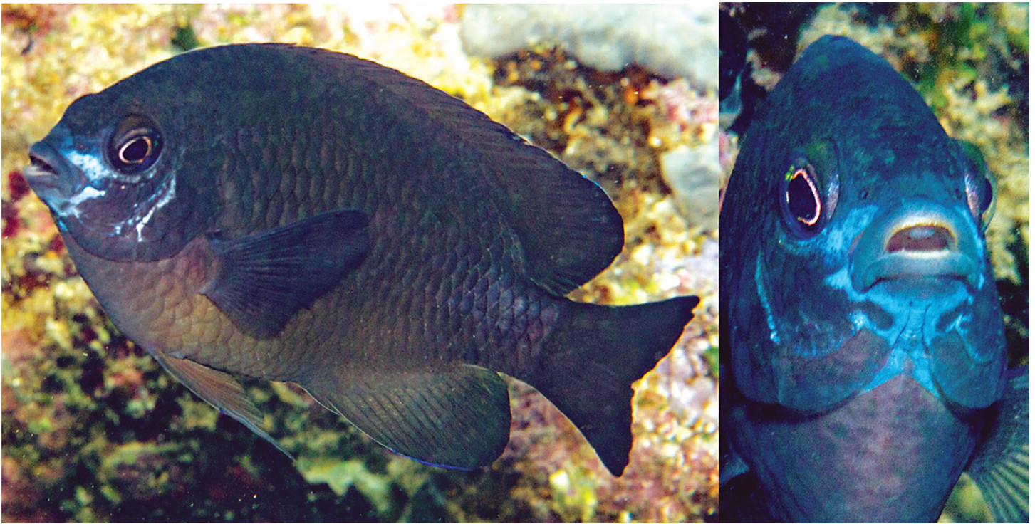
Figure 3. Pomacentrus bellipictus n. sp., underwater photographs of adult, approx. 60 mm SL, Kokas District, West Papua Province, Indonesia.

Color in life. (Figs. 3 & 4A) Adults with body and median fins dark brown, nearly black, with brown thorax and abdomen; head dark brown or blackish with blue facial markings as shown in Fig. 3; pelvic fins brown; pectoral fins translucent with dark brown rays; soft dorsal fin and anterior anal fin with narrow blue margin; iris of adult mostly dark gray with a narrow bronze ring around pupil. Juveniles with a prominent ocellus on soft dorsal fin (Fig. 4A), which gradually disappears with increased growth. It is generally absent in specimens larger than about 45 mm SL.