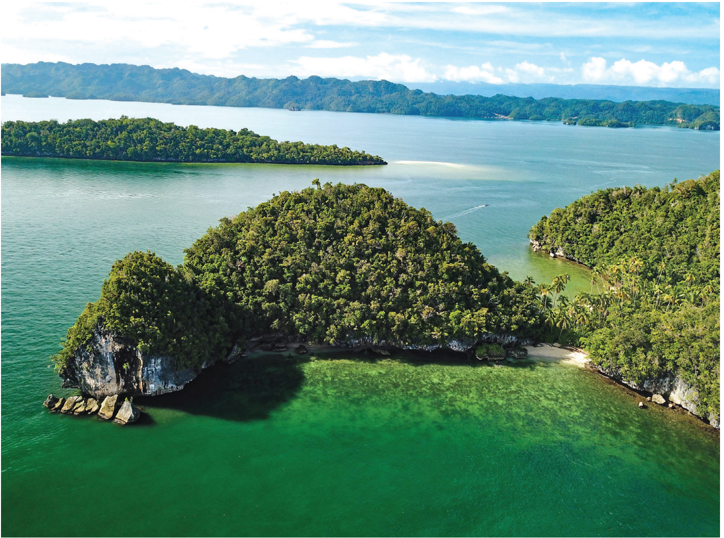
Figure 6. Fuum Islet (foreground), the type locality of Pomacentrus bellipictus . Type specimens were collected from the mostly shaded area adjacent to the rocky shoreline.

the characteristic blue facial markings of P. bellipictus . Pomacentrus fakfakensis further differs in having a mainly yellow-orange iris vs. dark grey for the two other species. Although somewhat variable in color, P. opisthostigma can be differentiated from the other two species by possessing a yellowish pectoral-fin base and axil, as well as having blue or violet streaks on the upper and lower iris. It also differs in having fewer lateral-line scales (usually 15–17 vs. usually 18–19) and more gill rakers on the first arch (26–29 vs. 18–21). Although the three species co-occur on sheltered inshore reefs on the Fakfak Peninsula, there are clear differences in habitat selection, with P. bellipictus inhabiting the very shallow, wave-affected zone adjacent to the rocky shore at about 1–2 m depth, while P. fakfakensis is found on deeper (about 3–8 m) reef flats and the upper edge of fringing-reef slopes, and P. opisthostigma is found mostly on deeper parts (about 6–20 m) of the reef slope.