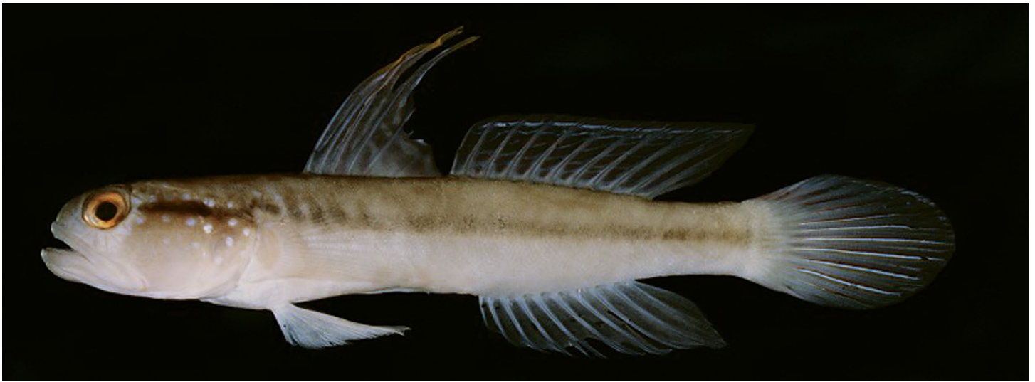
Figure 6. Myersina nigrivirgata , BPBM 29768, 65.5 mm SL, Lombok, Teluk Sira, Indonesia.

Thus, a case could be made for placing the new species either in Myersina or Cryptocentrus ; however, we place more weight on the cephalic papillae pattern in M. balteata which is unlike that of Cryptocentrus . In addition, the similarity in color pattern of the new species to both M. yangii (Fig. 5) and M. nigrivirgata ( Fig. 6) influenced our decision to classify the species in Myersina .