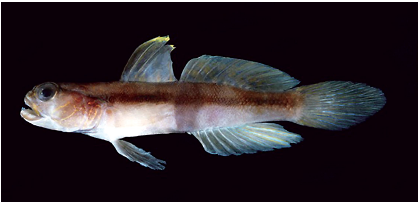
Figure 1. Myersina balteata , fresh holotype, 49.1 mm SL male, BPBM 39016, Guadalcanal, Solomon Islands (J.E. Randall).

Description. Dorsal-fin elements VI-I, 10, none filamentous; all dorsal and anal soft rays branched, last to base; dorsal fin of moderate height (less than HL); anal-fin elements I,9; pectoral-fin rays 17, uppermost and lowermost rays unbranched, 15 branched, longest ray reaching posteriorly to front of second dorsal-fin origin; pelvic-fin elements I,5, 5 th ray longest, reaching to just before anus and joined medially with membrane, frenum present and 25% of pelvic-fin length; caudal-fin length 37% SL, branched caudal-fin rays 13, segmented caudal-fin rays 17, upper unsegmented caudal-fin rays 5, lower 4; scales cycloid, increasing in size from anterior to posterior on body; lateral-scale series 62; anterior transverse scales 21; posterior transverse scales 19; circumpeduncular scales 18; predorsal midline scales 20, extending forward to a point midway between eye and posterior edge of preoperculum (Fig. 3); scales on side of nape extending as far forward as midline predorsal scales; pectoral-fin base naked; prepelvic scales extending forward past posteroventral edge of preoperculum; first gill slit open; gill membranes fused together and to isthmus at ventral midline; gill rakers short and slender, less than one-half length of longest filament of first arch; gill rakers on outer limb of first arch 4+13; 18 short rakers on lower limb of second arch; pseudobranch with 4 short fleshy lobes.