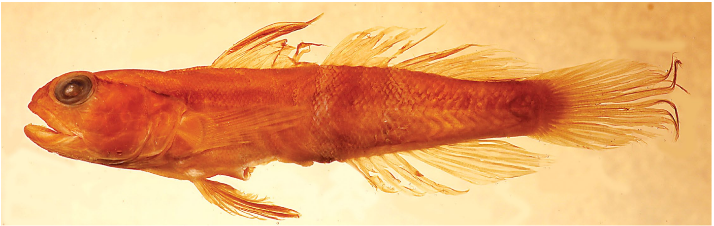
Figure 2. Myersina balteata , preserved holotype, 49.1 mm SL male, BPBM 39016, Guadalcanal, Solomon Islands (D.W. Greenfield).

Body elongate, body depth at pelvic-fin origin 5.3 in SL; body depth at anal-fin origin 5.6 in SL; body width at pectoral-fin origin 3.5 in HL; head length 3.1 in SL; head width 2.7 in HL; snout short, length 5.6 in HL; orbit diameter 4.0 in HL; interorbital space very narrow, least width 19.5 in HL; caudal-peduncle depth 3.2 in HL; caudal-peduncle length 1.8 in HL.