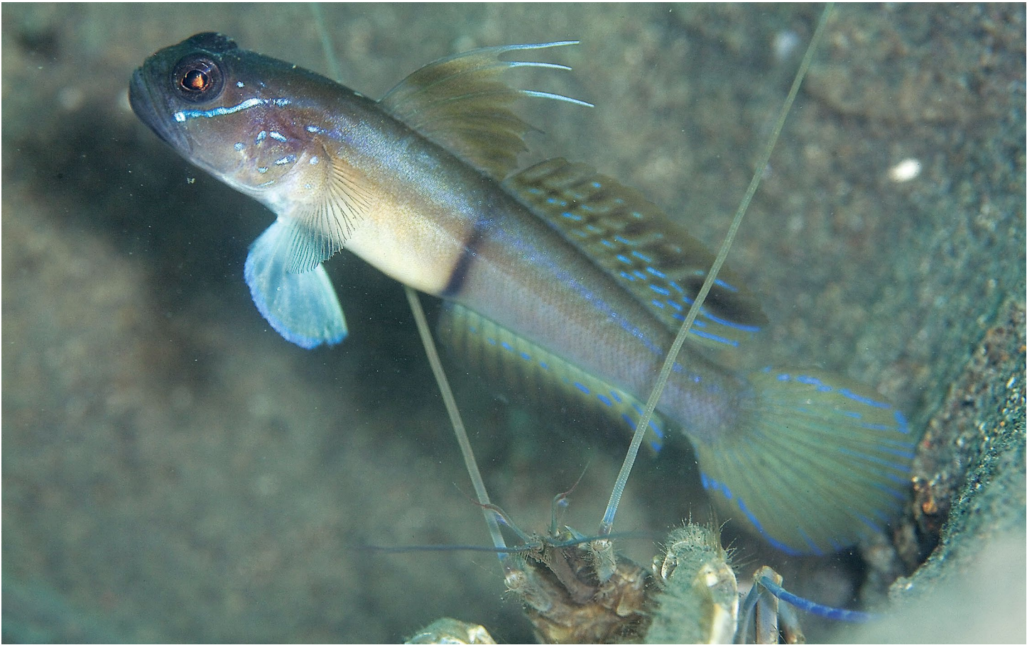
Figure 5. Myersina yangii , KPM-NR 76222A, Liloan, Cebu Island., Visayas Islands, Philippines, 10 Oct. 2010, ©Kanagawa Prefectural Museum of Natural History (image reversed; Naoshi Suzuki).

scales, the predorsal midline naked or with a few scattered scales, 4–5+17–19 gill rakers on the first arch, and orange to blue spots on the head vs. 62 lateral scales, 20 scales on predorsal midline, 4+13 gill rakers on the first arch, and no blue spots on the head in M. balteata . Myersina filifer has 80–101 lateral scales and 5 dark bars on the body vs. 62 lateral scales and a single dark bar in M. balteata . A number of authors and D. Hoese (pers comm., May 2018) place Myersina filifer in Cryptocentrus (Eschmeyer et al. 2018).