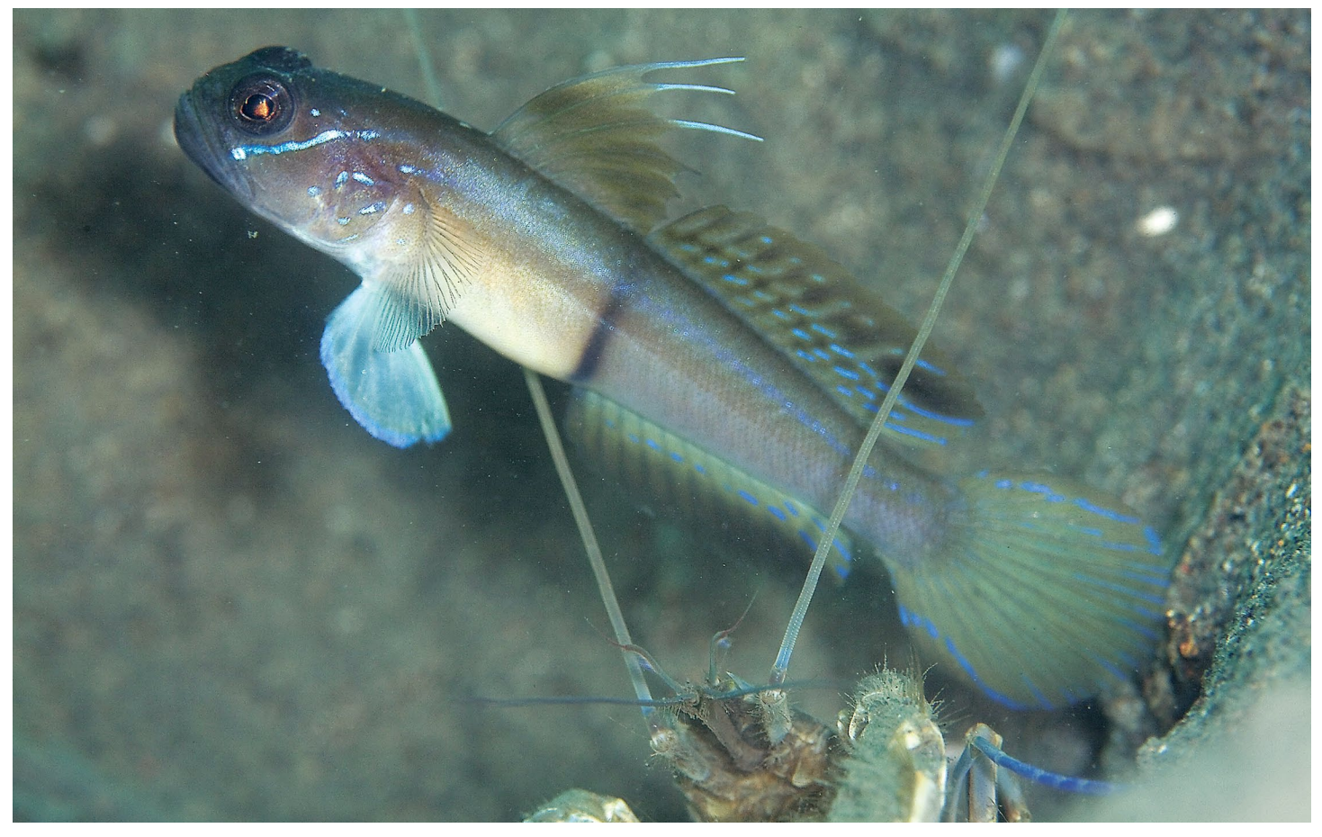
Figure 5. Myersina yangii , KPM-NR 76222A, Liloan, Cebu Island., Visayas Islands, Philippines, 10 Oct. 2010, ©Kanagawa Prefectural Museum of Natural History (image reversed; Naoshi Suzuki).

scales, the predorsal midline naked or with a few scattered scales, 4–5+17–19 gill rakers on the first arch, and orange to blue spots on the head vs. 62 lateral scales, 20 scales on predorsal midline, 4+13 gill rakers on the first arch, and no blue spots on the head in M. balteata . Myersina filifer has 80–101 lateral scales and 5 dark bars on the body vs. 62 lateral scales and a single dark bar in M. balteata . A number of authors and D. Hoese (pers comm., May 2018) place Myersina filifer in Cryptocentrus (Eschmeyer et al. 2018).