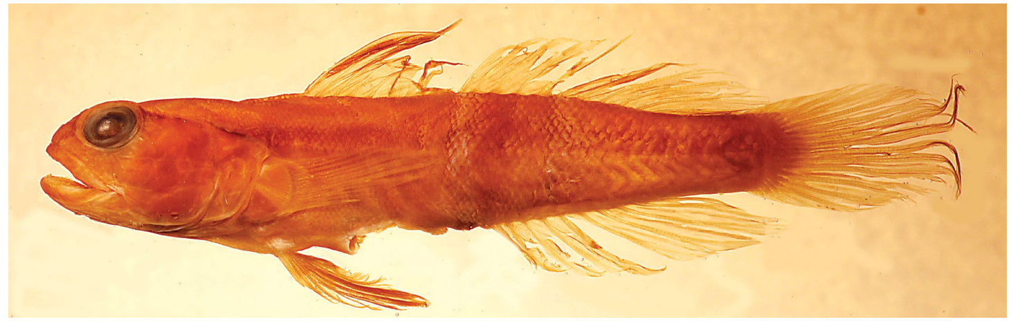
Figure 2. Myersina balteata , preserved holotype, 49.1 mm SL male, BPBM 39016, Guadacanal, Solomon Islands (D.W. Greenfield).

Body elongate, body depth at pelvic-fin origin 5.3 in SL; body depth at anal-fin origin 5.6 in SL; body width at pectoral-fin origin 3.5 in HL; head length 3.1 in SL; head width 2.7 in HL; snout short, length 5.6 in HL; orbit diameter 4.0 in HL; interorbital space very narrow, least width 19.5 in HL; caudal-peduncle depth 3.2 in HL; caudal-peduncle length 1.8 in HL.