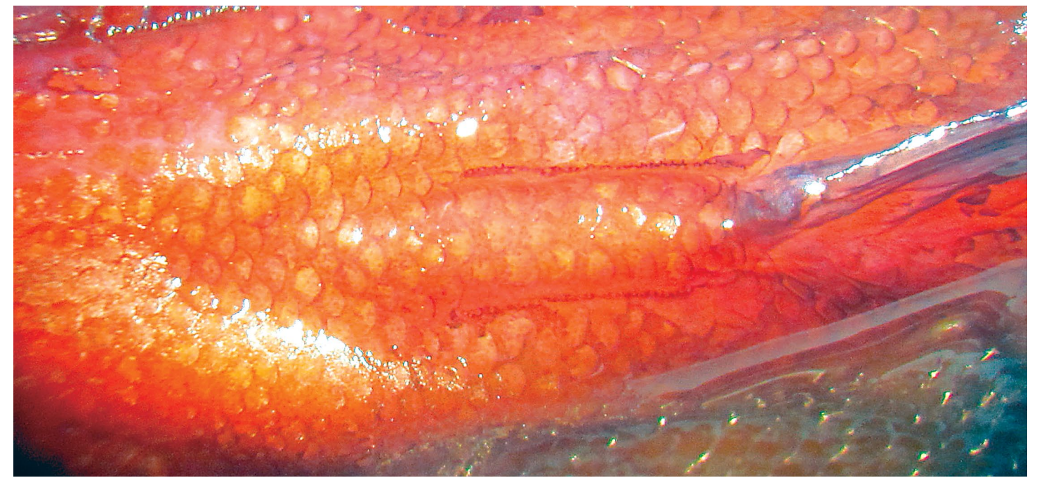
Figure 3. Myersina balteata , preserved holotype, predorsal midline scale pattern, BPBM 39016, Guadacanal, Solomon Islands (D.W. Greenfield).