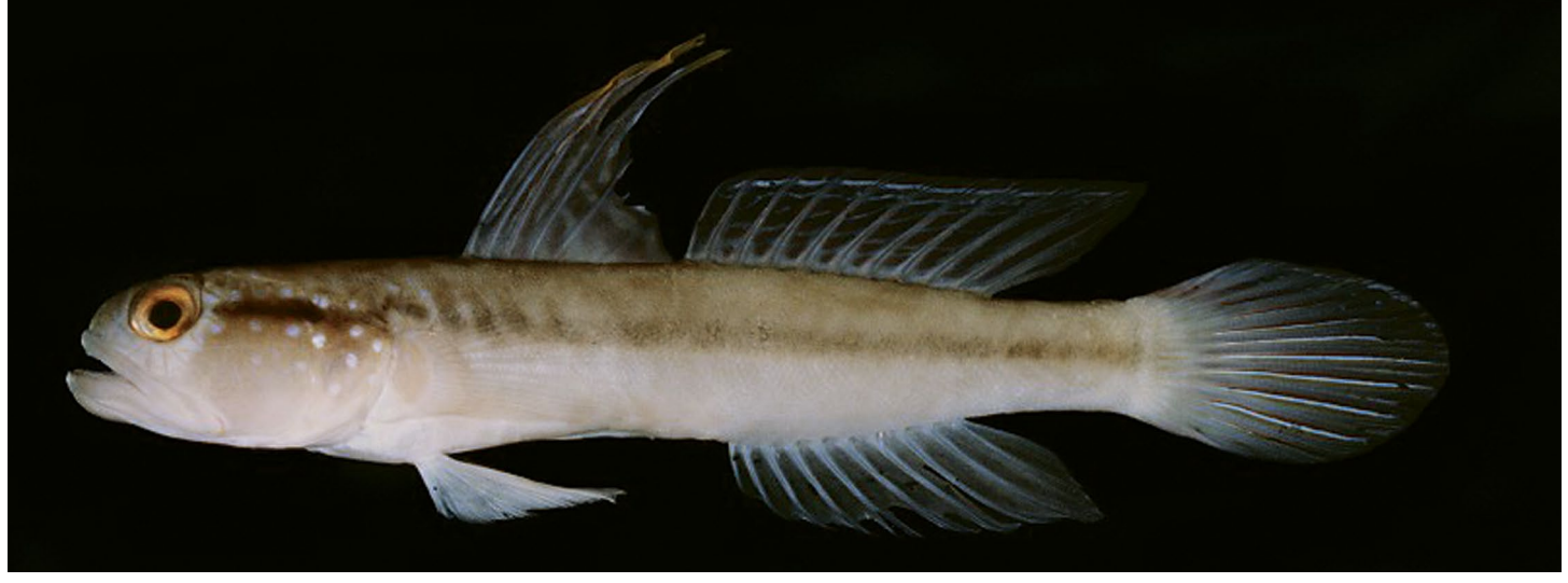
Figure 6. Myersina nigrivirgata, BPBM 29768, 65.5 mm SL, Lombok, Teluk Sira, Indonesia.

Thus, a case could be made for placing the new species either in Myersina or Cryptocentrus ; however, we place more weight on the cephalic papillae pattern in M. balteata which is unlike that of Cryptocentrus . In addition, the similarity in color pattern of the new species to both M. yangii (Fig. 5) and M. nigrivirgata (Fig. 6) influenced our decision to classify the species in Myersina .