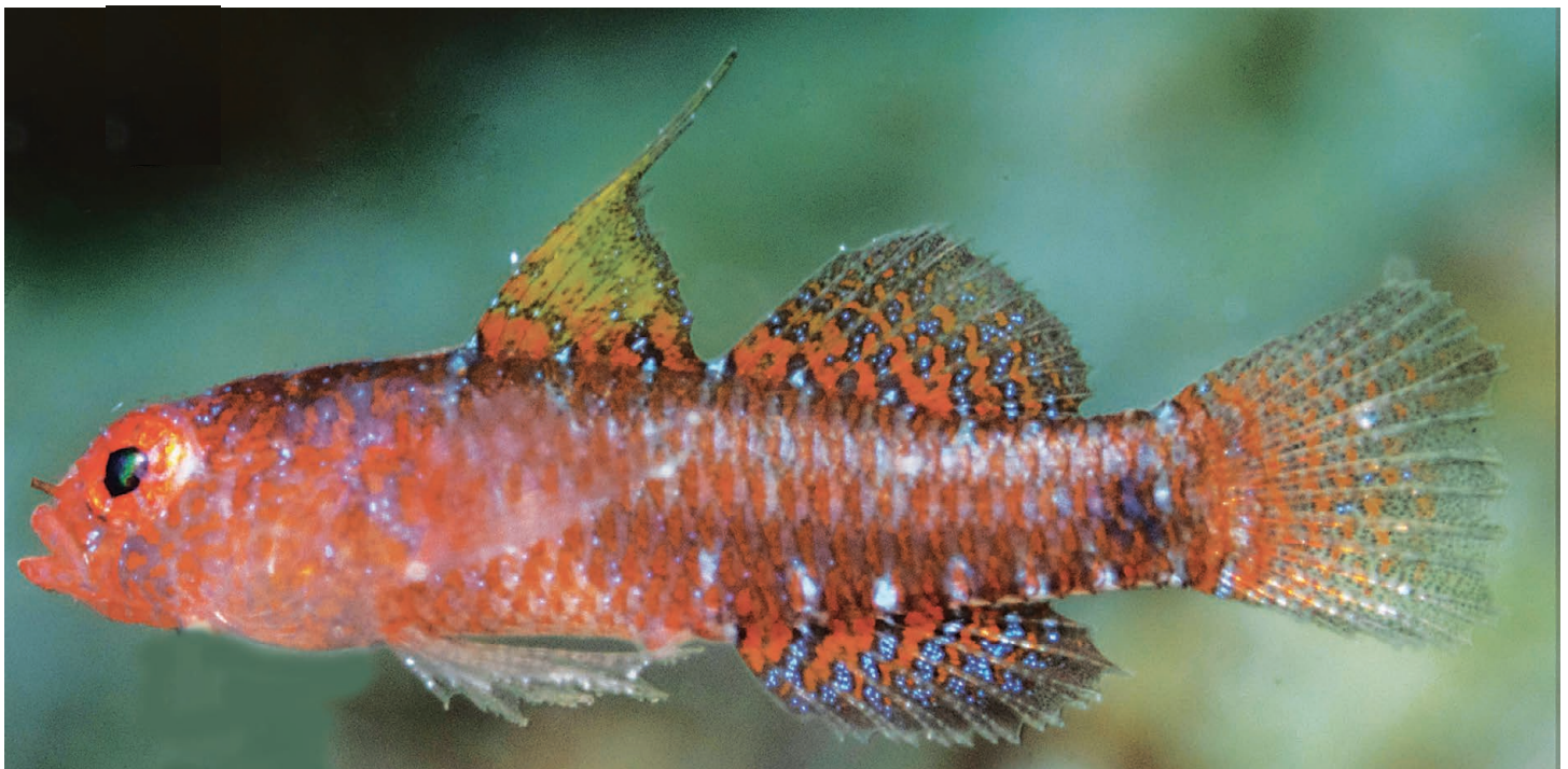
Figure 1. Eviota marteynae , fresh female paratype, CAS 247236, Laamu Atoll, Maldives Islands (Mark V. Erdmann).

Description. Dorsal-fin elements VI + I,8, first dorsal fin triangular, first two spines filamentous in males and females, second spine reaching to second ray of second dorsal fin when adpressed; all second-dorsal-fin soft rays branched except first and penultimate branched, last ray branched to base; anal-fin elements I,8, all soft rays branched, last ray branched to base; pectoral-fin rays 15 (13–15, usually 15), some branched, pointed, reaching to below second dorsal fin when unbroken; pelvic-fin rays I,5, fifth ray 10% (7–12%) of length of fourth; 3 (0–5) branches, 3 (2–3) segments between consecutive branches of fourth pelvic-fin ray, pelvic-fin membrane well developed, basal membrane reduced; caudal fin with 12 (11–13) branched and 17 segmented rays; lateral-line scales 25 (24–25, usually 25); transverse scale rows 7; urogenital papilla of male smooth, wide, with several short finger-like projections at tip; female papilla also smooth but somewhat more bulbous and with slightly longer projections, making sex determination subjective; front of head rounded with an angle of about 60° from