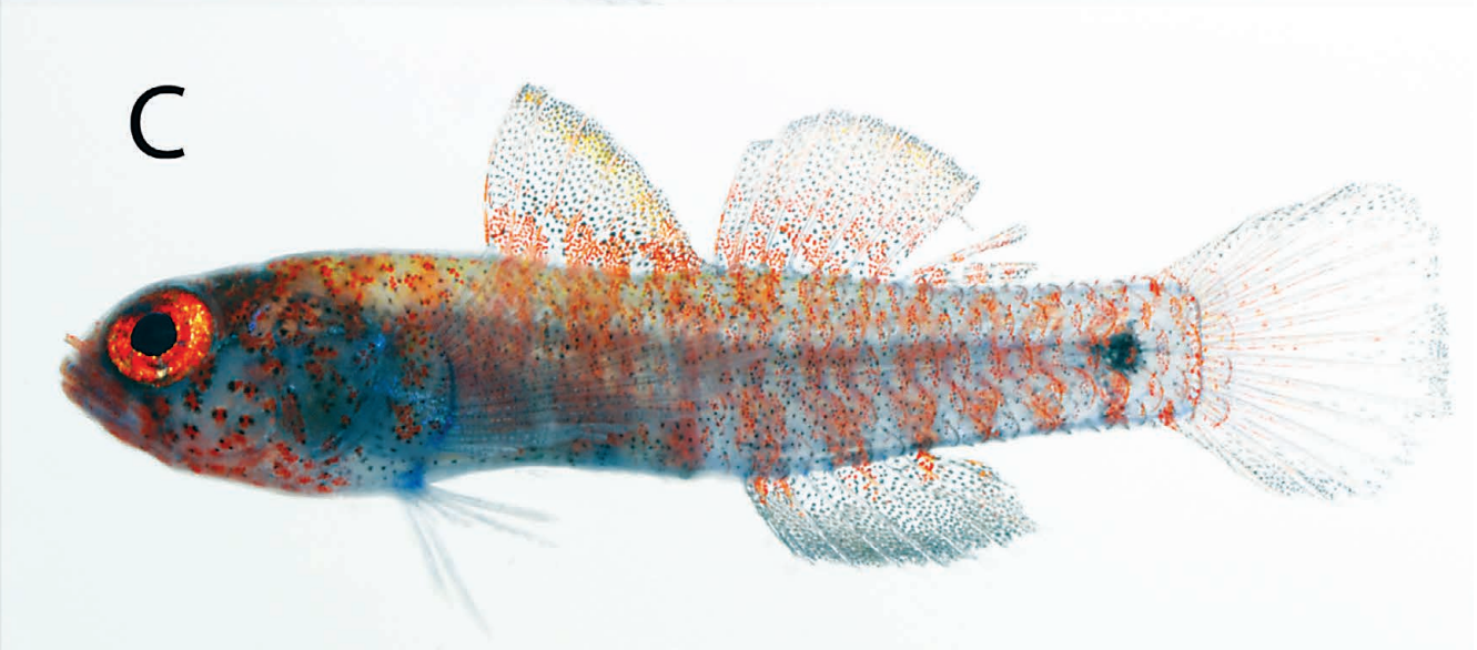
Figure 7. Eviota marteynae , fresh female paratype (A), CAS 247236, Laamu Atoll, Maldive Island (Mark V. Erdmann) vs. Eviota shibukawai , fresh female holotype (B), NSMT-P 114946, 9.9 mm SL, Iriomote-jima, Japan (Toshiyuki Suzuki) and freshly collected juvenile paratype (C), NSMT-P 114947, 9.2 mm SL, Iriomote-jima, Japan (Koichi Shibukawa) (from Figs. 2 & 3 of Suzuki & Greenfield [2014]).