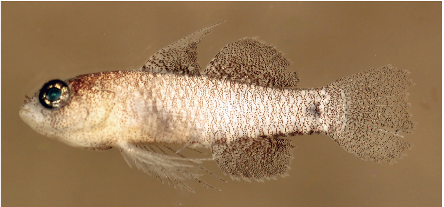
Figure 4. Eviota marteynae , preserved female paratype, CAS 247236, Laamu Atoll, Maldives Islands (David W. Greenfield).

bluish gray bands radiating from pupil-like spokes. First dorsal fin red orange along basal third, remainder of fin lemon yellow with a black margin, crossed by two curved rows of white dots on orange area; second dorsal and anal fins red orange along basal half, distal portion black, entire fin covered with electric-blue spots and blotches; caudal fin red orange on basal three-fourths and black on distal portion with electric blue spots covering entire fin; pectoral and pelvic fins clear.