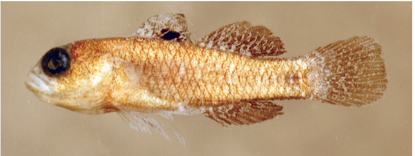
Figure 3. Eviota marteynae , preserved male holotype, CAS 247235, Laamu Atoll, Maldives Islands (David W. Greenfield).

Color of fresh specimens. (Figs. 1, 2 & 7A) Background color of head and body translucent bluish gray; scales on body burnt orange, scale pockets lined with black; a round dark internal spot centered over preural centrum; a series of white spots extend along dorsal surface from top of head, under dorsal fins, and onto caudal peduncle, a similar line of white spots extend along ventral surface from anal-fin origin to caudal fin. Head covered with irregular-shaped burnt-orange blotches; snout and jaws burnt orange; iris red orange with 7 narrow,