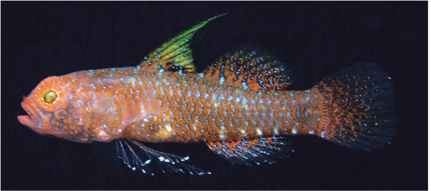
Figure 2. Eviota marteynae , fresh male holotype, CAS 247235, Laamu Atoll, Maldives Islands (Mark V. Erdmann).

horizontal axis; mouth slanted obliquely upwards, forming an angle of about 55^\circ to horizontal axis of body, lower jaw not projecting; maxilla extending posteriorly to front of pupil; anterior tubular nares long, extending to center of upper lip; gill opening extending forward to below posteroventral edge of preoperculum. Cephalic sensory-canal pore system lacking only an IT pore (Pattern 2); cheek papillae in a very reduced transverse pattern, and, as discussed by Winterbottom & Greenfield (2020), papilla row b is comprised of two sections.