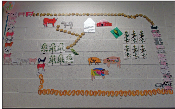
A map at the school shows Nebraska agriculture products.