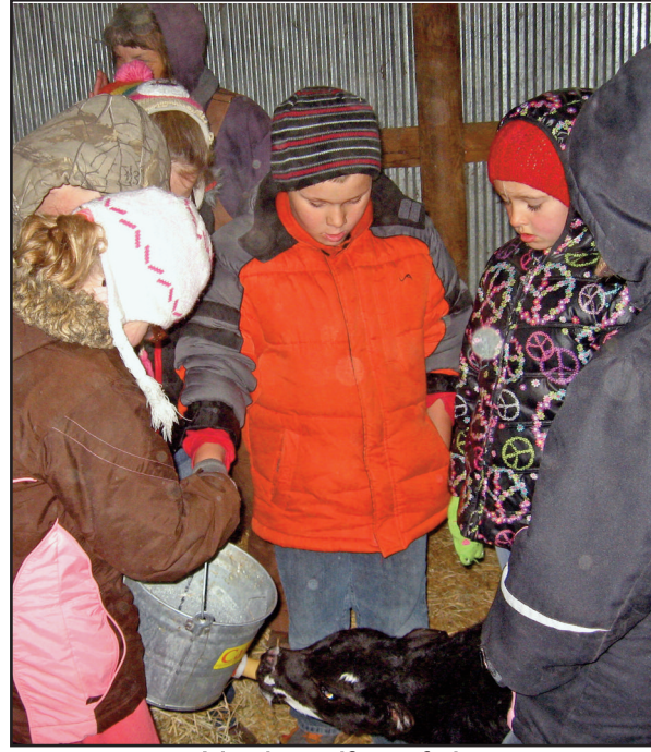
A bucket calf gets fed.