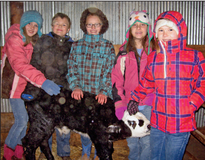
These students got to pet a baby calf.