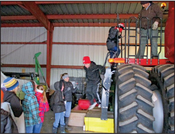
Checking out a combine.