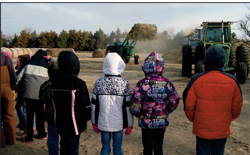
Students watch as the cattle get fed.