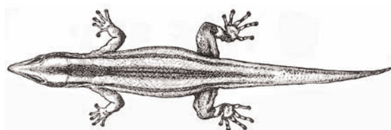
FIGURE 2. The dorsal pattern of the type specimen (from Ruibal 1946).

and number 20–26 from axilla to groin. Dorsal caudal scales are keeled, acute, imbricate, and flat; ventral caudal scales are smooth, cycloid, imbricate, and slightly enlarged midventrally. The snout is acuminate, not depressed or decurved; snout scales are large, broad, flat, keeled, and juxtaposed. Scales of