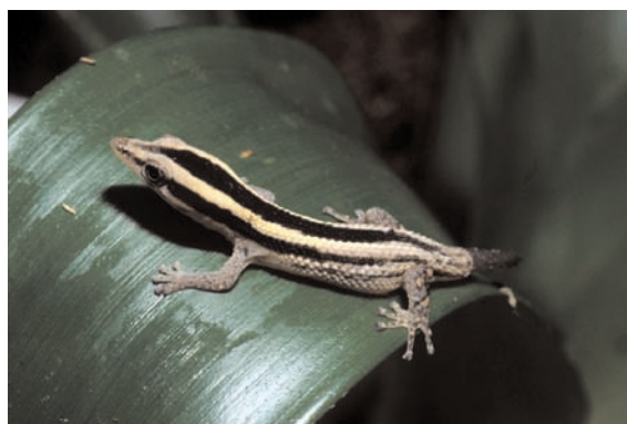
FIGURE 1. Adult Sphaerodactylus cochranae from Los Haitises National Park, Dominican Republic.

• DEFINITION. Sphaerodactylus cochranae is a moderately sized sphaerodactyl, with male SVL to 30 mm and female SVL to 28 mm. Dorsal scales are large, acute, strongly keeled, flattened, imbricate, and number 20–23 from axilla to groin. Middorsal granules or granular scales are absent. Dorsal body scales have hair-bearing organs, with 3–8 organs around the free edges of scales (occasionally 3 organs set back from the edge); each organ has 1 hair. Ventral scales are smooth, cycloid, imbricate,