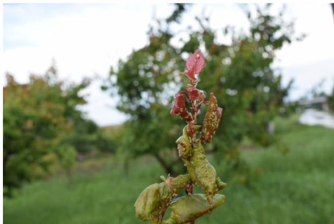
Figure 4. Myzus mumecola , pseudo-galls on tips of branches.