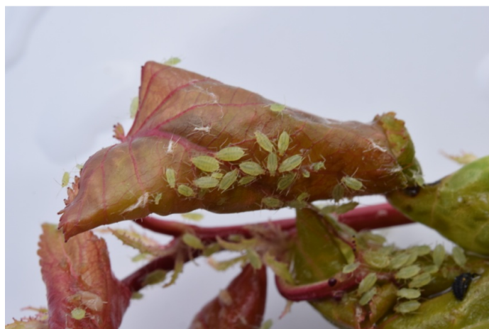
Figure 5. Myzus mumecola , aphids on leaves deformities.