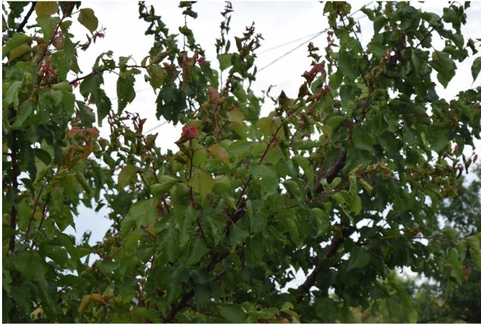
Figure 6. Appearance of tips of apricot tree infested with M. mumecola , at the end of May.

sexuales (males and oviparous females), which are expected to come back to apricot before winter. Further research on biology of M. mumecola is necessary.