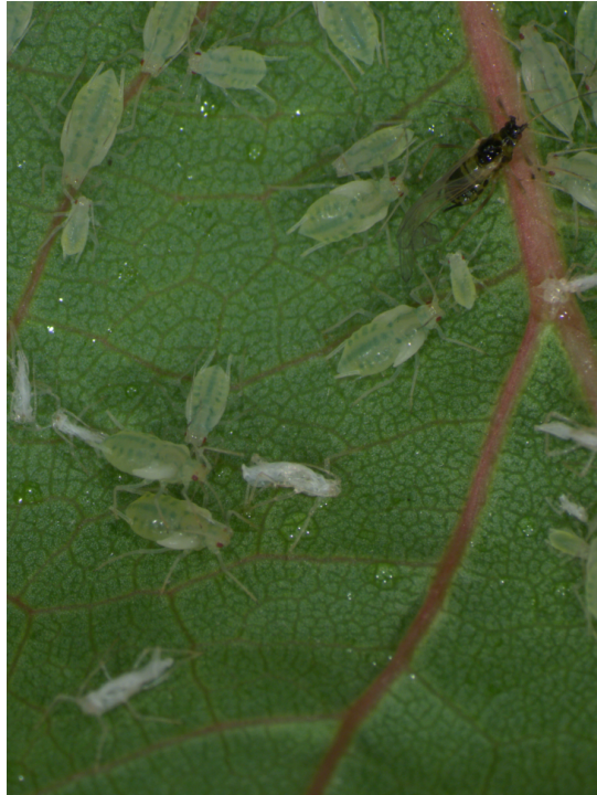
Figure 3. Myzus mumecola , colony on apricot leaf (one alatae viviparous parthenogenetic female and larvae of the same).

Order Hemiptera, family Aphididae, subfamily Aphidinae, genera Myzus , subgenera Myzus . Synonyms: Macrosiphum mumecola Matsumura 1917 and Myzus umecola Shinji, 1924. M. mumecola is morphologically similar to common Prunus persicae feeding species, M. persicae from which apterous viviparous females and alatae can be distinguished by shape of siphunculi. In M. mumecola siphunculi are tapering from base to flange but they are slightly swollen in M. persicae . Also, siphunculi are more than 2.3 times longer than cauda in M. mumecola , and less than 2.3 times longer than cauda in M. persicae (Blackman and Eastop 2021).