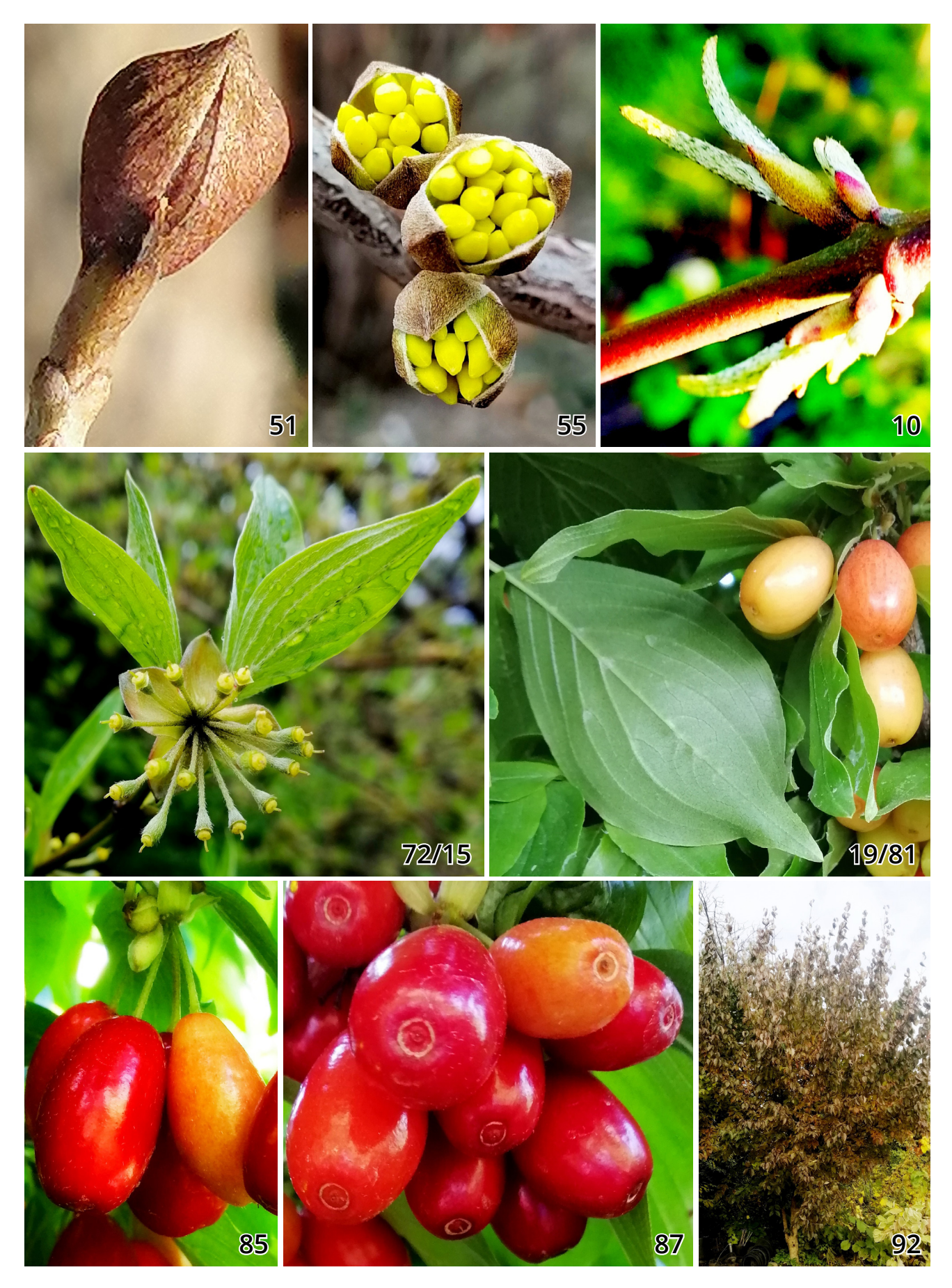
Figure 3. Phenological stages of the cultivar 'Vytivka Svitlany' in 2021 according to the BBCH scale.