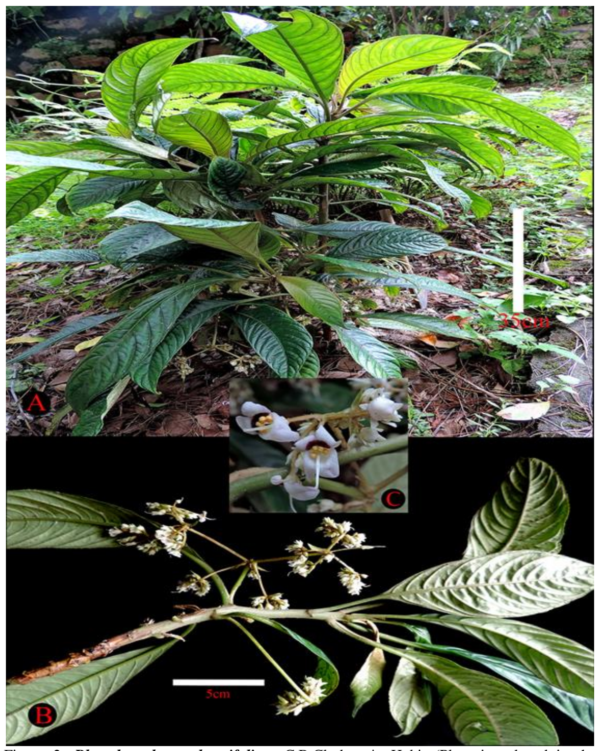
Figure 2: Rhynchotechum alternifolium C.B.Clarke: A. Habit (Plant introduced in the Garden of Botanical Survey of India, Shillong, Meghalaya), B. Inflorescences, C. Flowers in close view.