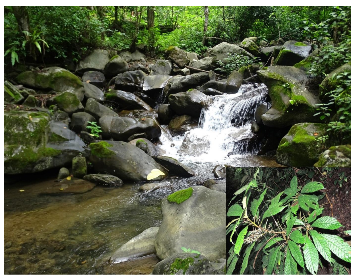
Figure 4: Natural habitat of Rhynchotechum alternifolium C.B.Clarke (Tuensang district, Nagaland).

Conservation: IUCN status not yet evaluated. However, anthropogenic disturbances in the form of timber and non-timber forest product extraction, jhum cultivation and forest fires are the major threats to the species in the present study area.