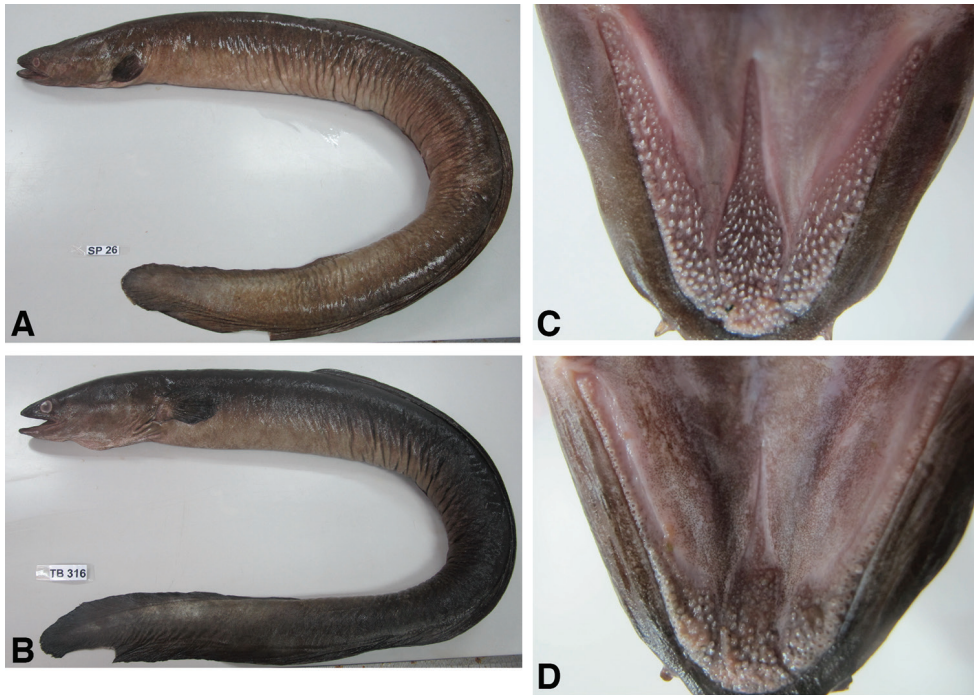
Figure 2. Anguilla marmorata and A. bengalensis bengalensis collected in the Pondok Upeh River in Penang Island of Peninsular Malaysia. A Anguilla marmorata (904 mm in TL) B Anguilla bengalensis bengalensis (889 mm in TL) C Wide maxillary bands of teeth of A. marmorata D Narrow maxillary bands of teeth of A. bengalensis bengalensis . DNA was extracted from dorsal fin clip of each specimen, and hence the posterior dorsal fin of each specimen is lacking.

The geographical distribution of anguillids is used in combination with key morphological characteristics to determine the classification of each species into four groups. Within the first group, A. interioris , A. megastoma , A. luzonensis exist in New Guinea, Solomon Islands, New Caledonia, Fiji Islands, Cook Islands, and northern Philippines (Ege 1939). Therefore, SP26 was considered to be A. celebesensis with a range of FDI from 6 to 12 and of NMM from 4 to 9 (Ege 1939, Watanabe et al. 2004).