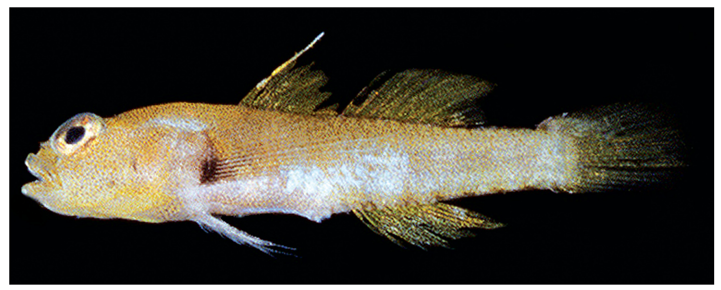
Figure 2. Eviota lentiginosa, fresh holotype, QM I.40817, 13.4 mm SL, male, Norfolk Island, Australia (J.E. Randall).

Color of fresh holotype. (Fig. 2) Background color of head and body yellow. Lower side below pectoral fin