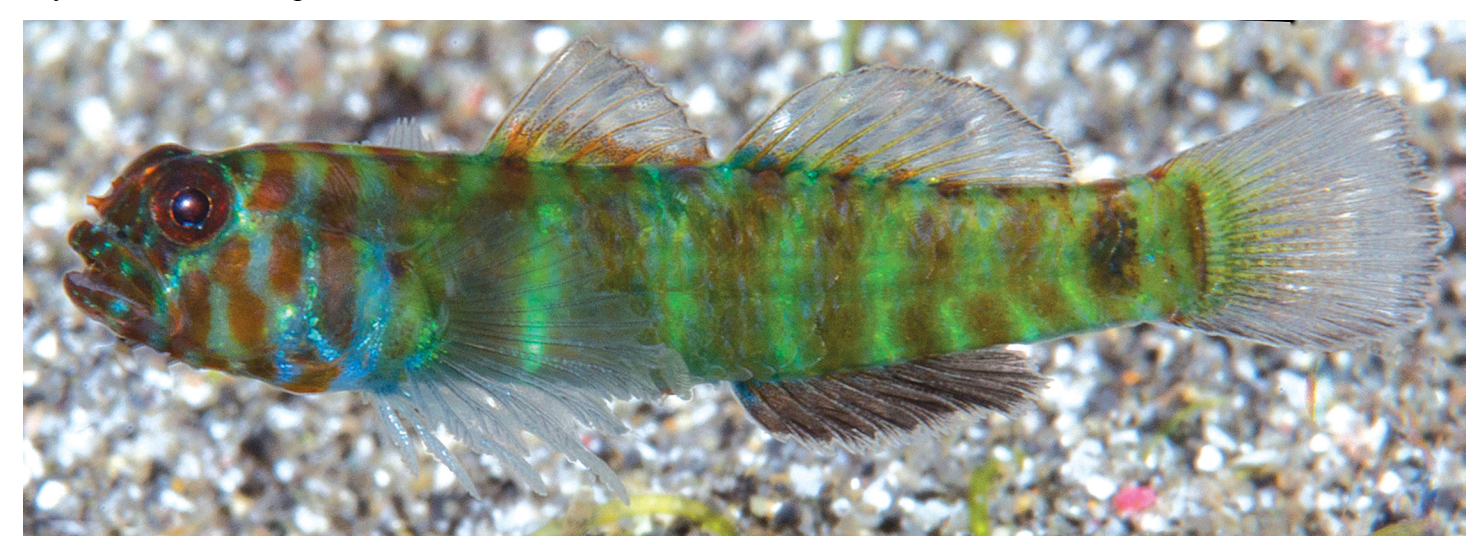
Figure 3. Eviota bipunctata, underwater photograph, CAS 243925, Timor Leste (M.V. Erdmann).

the missing ends. If this were the case, then E. lentiginosa would be most similar to E. bipunctata , which shares the dorsal/anal formula of 8/8 and also has some individuals with a dark spot on the lower portion of the pectoral-fin base. However, E. bipunctata has a fifth pelvic-fin ray that is 10% of the length of the fourth ray (vs. absent in E. lentiginosa ), the male urogenital papilla is elongate with prominent fringing on the tip (vs. a flat rounded plate), and the fresh coloration is very different from E. lentiginosa (Fig. 3). Additional specimens are necessary to resolve the question of pectoral-fin branching, but regardless, E. lentiginosa can be easily distinguished from any other described species of Eviota .