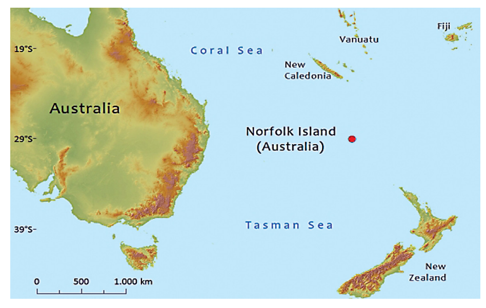
Figure 1. Map of southwestern region of Pacific Ocean with Norfolk Island represented by red circle.

Counts and measurements, descriptions of fin morphology, and the cephalic sensory-canal pore patterns follow Lachner & Karnella (1980) and Jewett & Lachner (1983). Postanal ventral-midline spots begin at the anal-fin origin and extend to a vertical about 2–3 scale rows anterior to the end of the hypurals, the additional smaller spot posterior to this, if present, is not counted. We follow Lachner & Karnella (1980:4) in describing the membranes joining the first 4 pelvic-fin rays, which "…are considered to be well developed when the membranes extend beyond the bases of the first branches; they are considered to be reduced when they are slightly developed, not extending to the bases of the first branches". Dorsal/anal fin-ray formula counts (eg. 9/8) only include segmented rays. Measurements were made to the nearest 0.1 mm using an ocular micrometer or dial calipers, and are presented as percentage of standard length (SL). All specimen lengths are SL in mm. Cyanine Blue 5R (acid blue 113) stain and an airjet were used to make the cephalic sensory-canal pores more obvious (Akihito et al. 1993, 2002, Saruwatari et al. 1997). For measurements, values for the holotype are given first, followed by that for the paratype in parentheses.