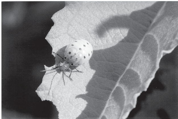
Figure 2. A gravid female of Metacycla insolita J. L. LeConte on its host.