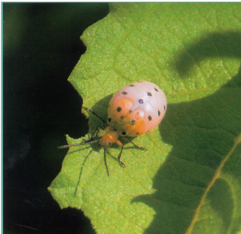
Metacycla insolita J. L. LeConte, see p. 101